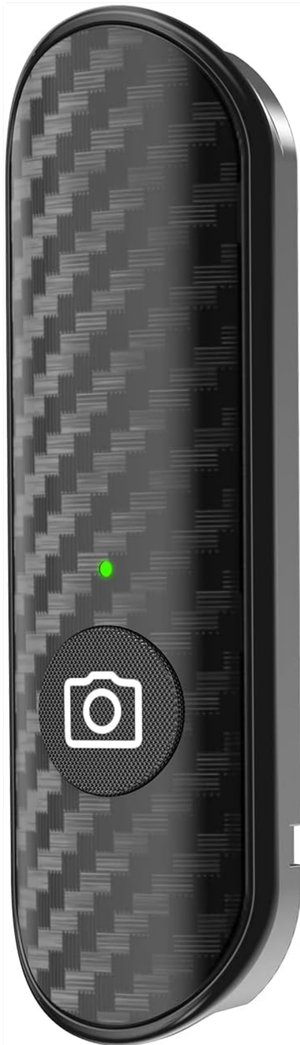
Image 1.1: The TONEOF Phone Tripod Chargeable Remote, featuring a sleek design with a carbon fiber texture and a single shutter