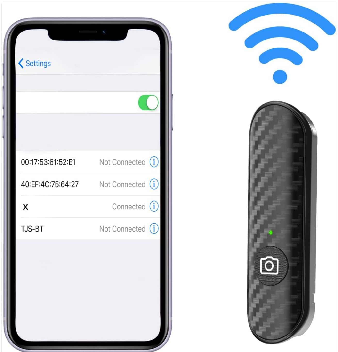
Image 3.1: An example of a smartphone's Bluetooth settings screen, showing available devices for pairing, including 'TJS-BT'.

Once paired, the remote will automatically connect to your device when both are powered on and within range.