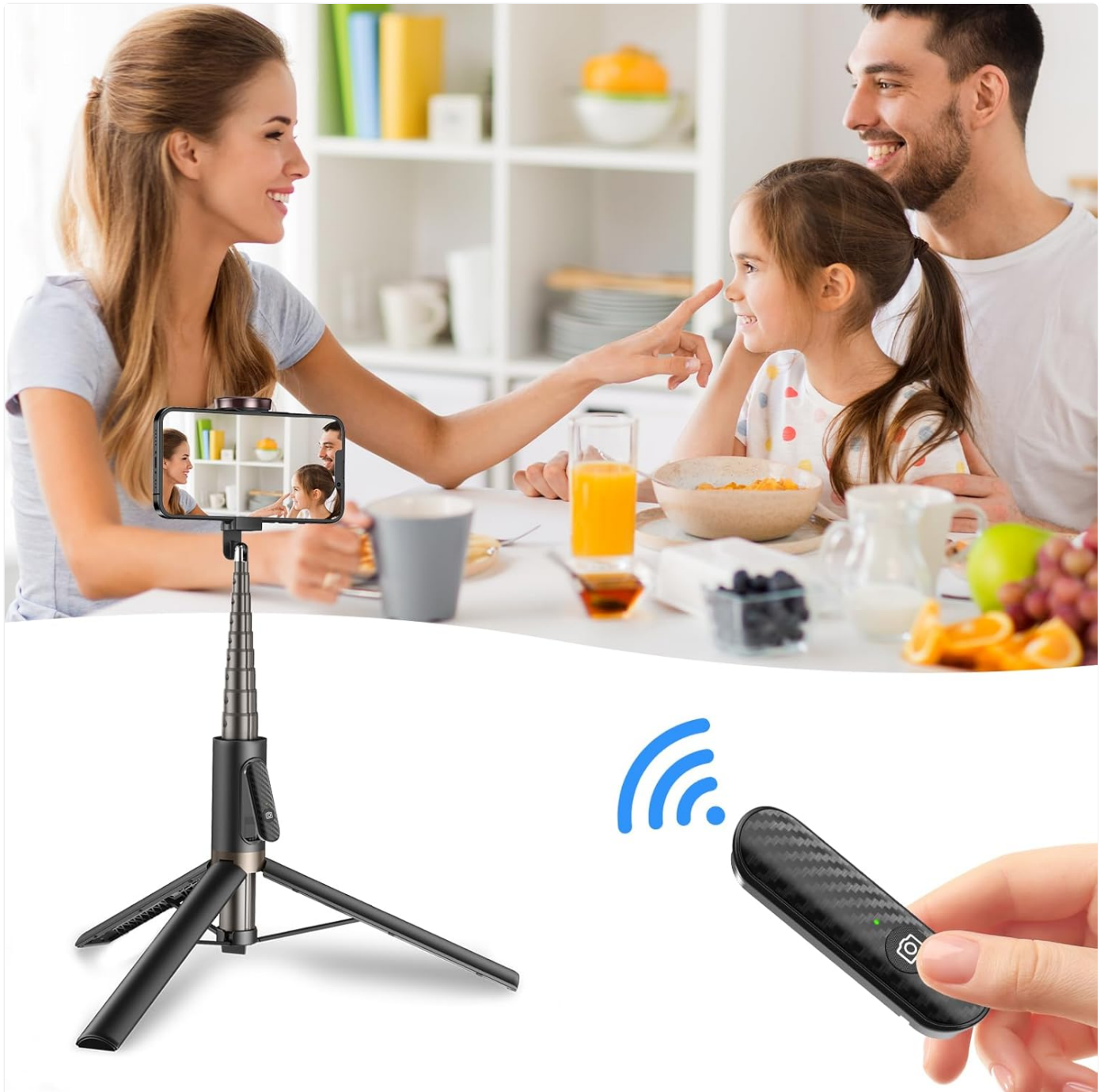
Image 4.1: A family using the TONEOF remote with a tripod-mounted smartphone to capture a group photo, demonstrating hands-free operation.

The remote operates effectively within a range of up to 10 meters (33 feet), providing flexibility for various shooting scenarios.