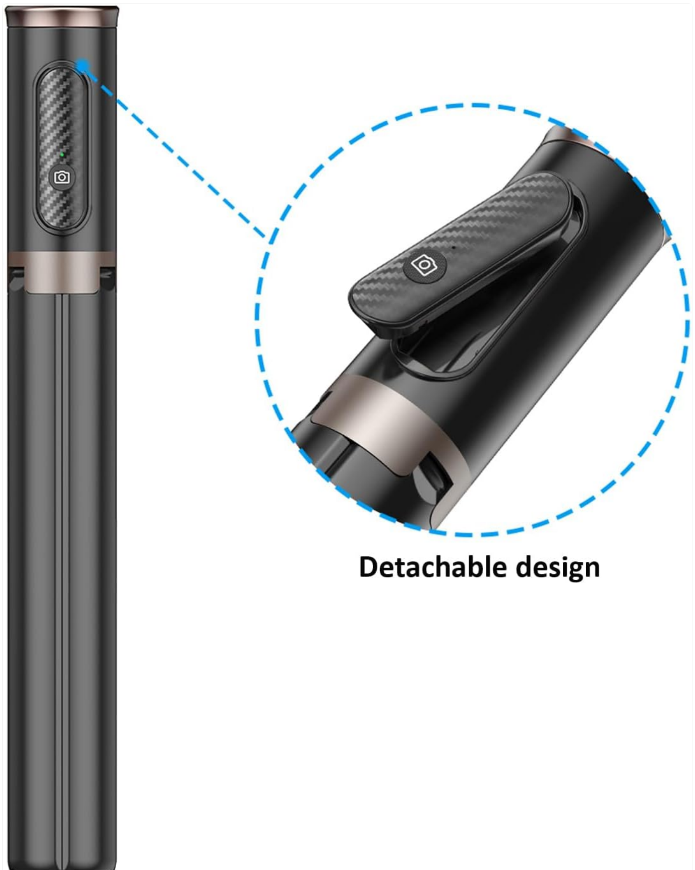
Image 4.2: The TONEOF remote shown detached from a selfie stick/tripod, highlighting its portable and versatile design.