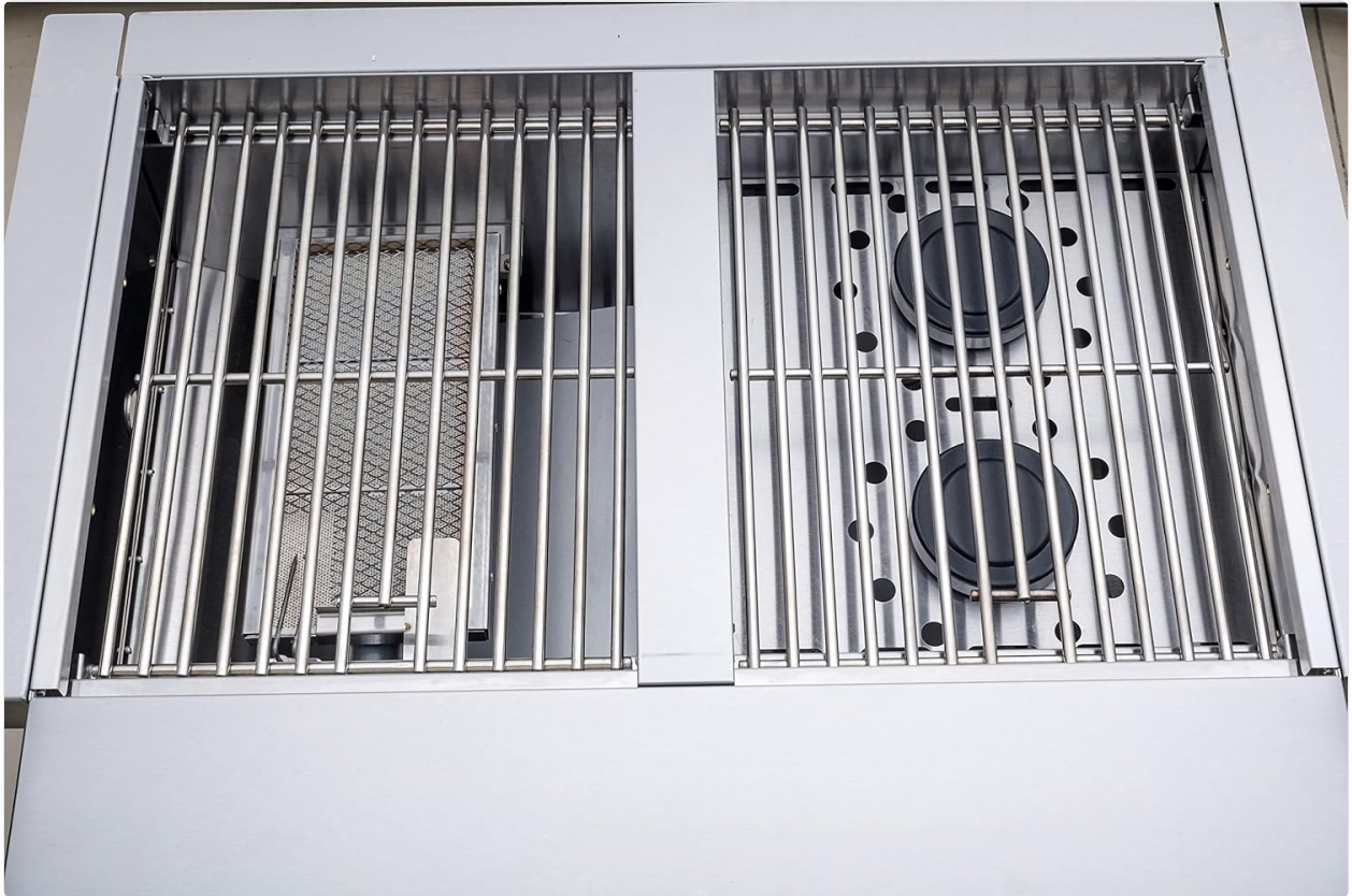
Top view of the NXR 24" Drop-in Side Burner Set, showing the stainless steel grates, infrared burner (left), and two gas burners (right).

The side burner set includes a robust stainless steel body, a hinged lid, stainless steel cooking grates, an infrared burner, two conventional gas burners, and control knobs with an integrated ignition button.