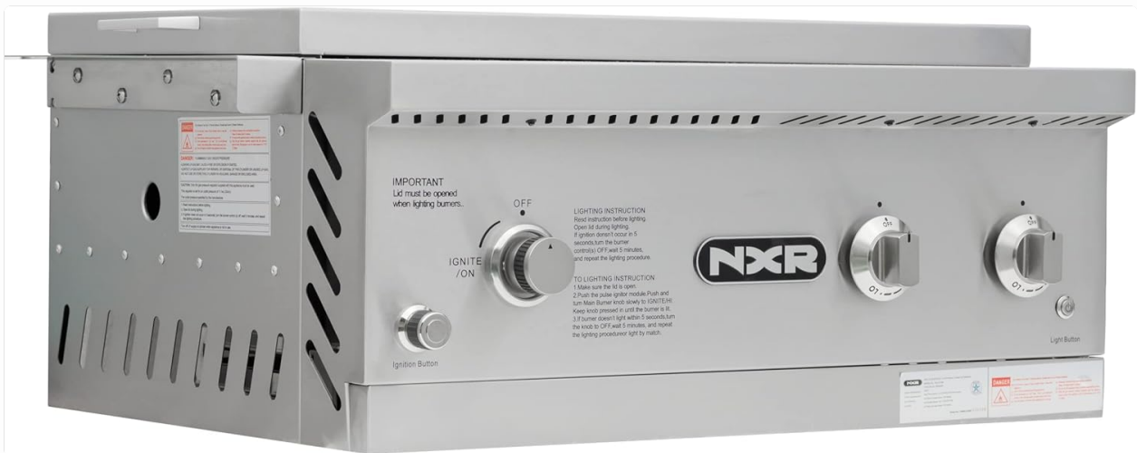
Angled view of the NXR 24" Drop-in Side Burner Set, highlighting its stainless steel construction and compact design for integration into an outdoor kitchen.