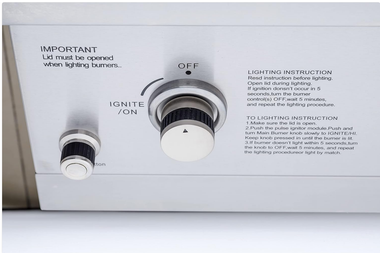
Close-up view of the control panel of the NXR 24" Drop-in Side Burner Set, showing the ignition button, main burner control knob, and printed lighting instructions.