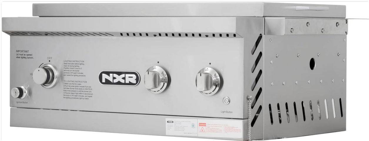
Side view of the NXR 24" Drop-in Side Burner Set, illustrating its depth and the ventilation grilles on the side panel.