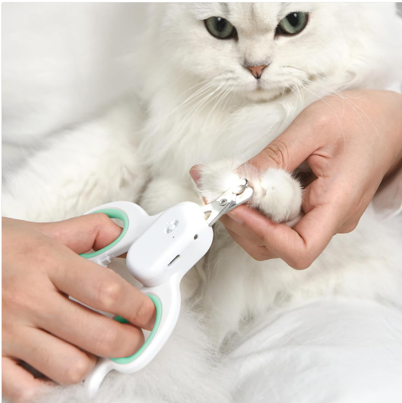
Image: A person demonstrating the use of the PAKEWAY Pet Nail Clipper to trim a cat's nails, highlighting the ergonomic grip and ease of use.