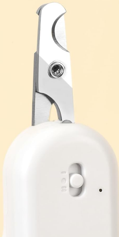
Image: A detailed view of the high-quality stainless steel blades, emphasizing their sharpness and curved design for effective nail trimming.

Steel Sharp Blades The Curved Incision Perfectly Fits the Cat's Nails