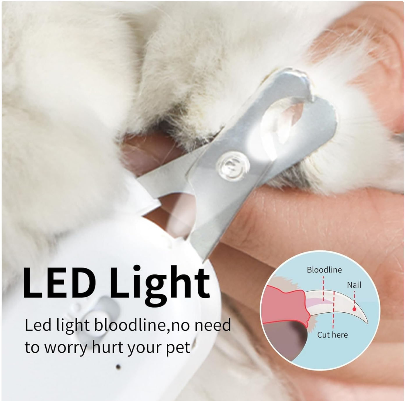
Image: The LED light feature in action, clearly showing how it illuminates the pet's nail to reveal the bloodline, indicating where to cut.