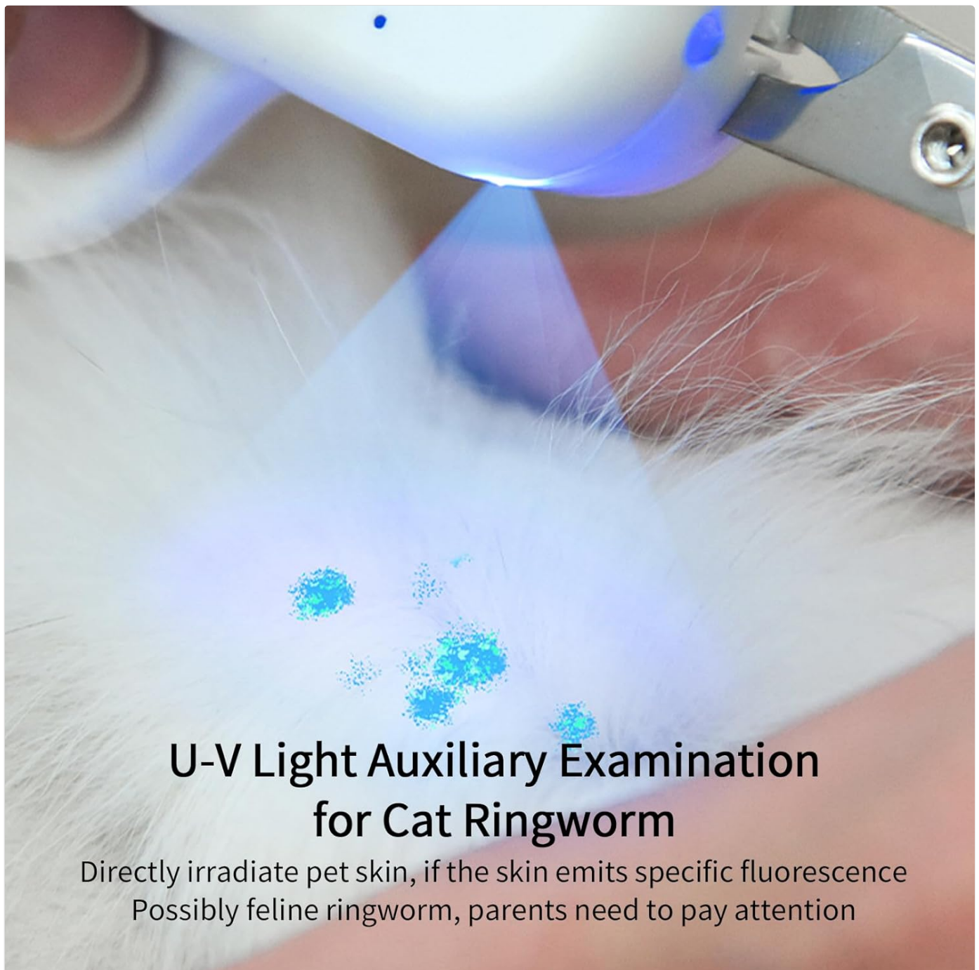
Image: The UV light feature being used to inspect a pet's fur, demonstrating its capability to detect potential skin issues like ringworm.