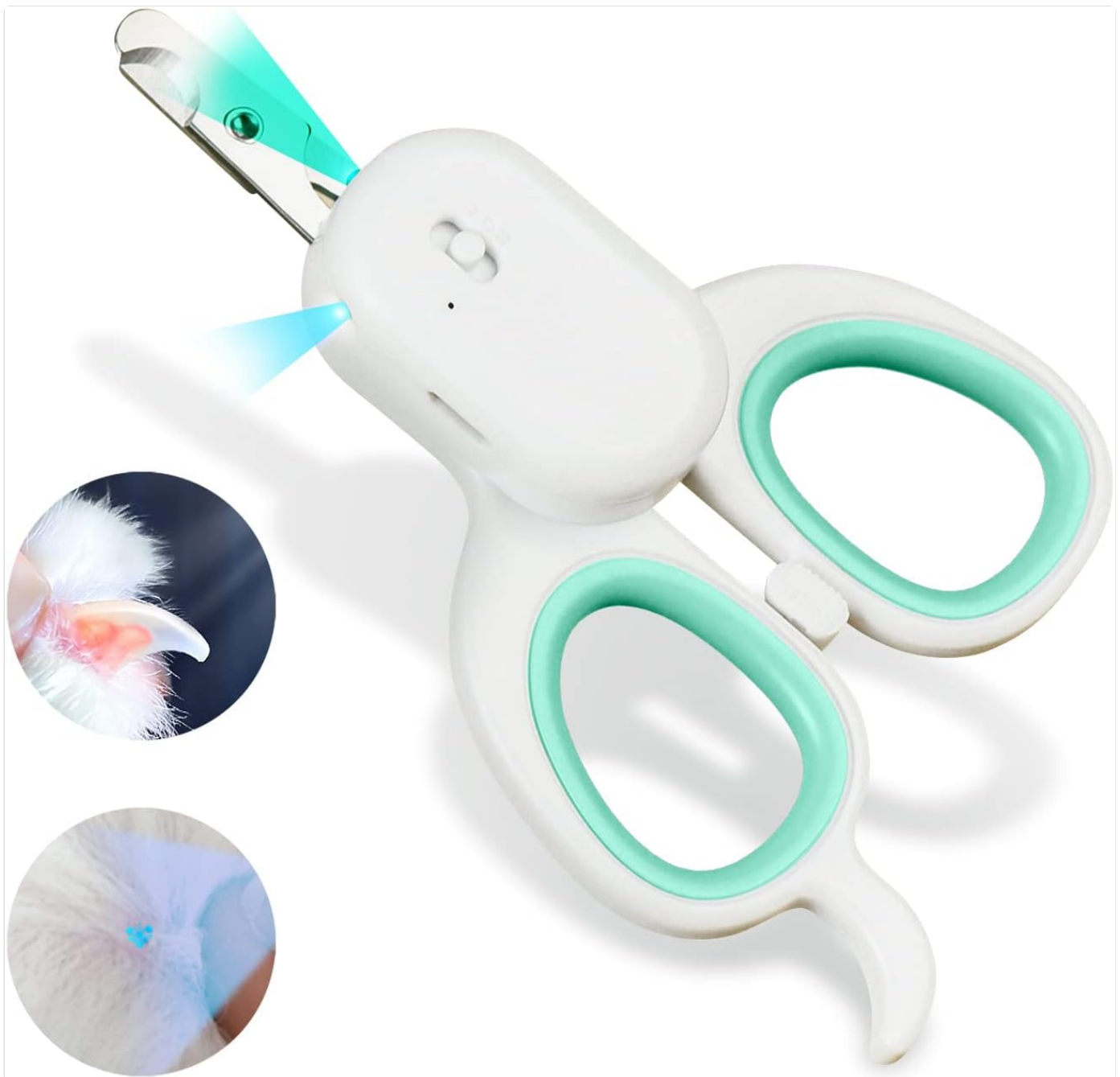
Image: The PAKEWAY Pet Nail Clipper, showcasing its compact design with integrated LED and UV lights, and ergonomic handles.