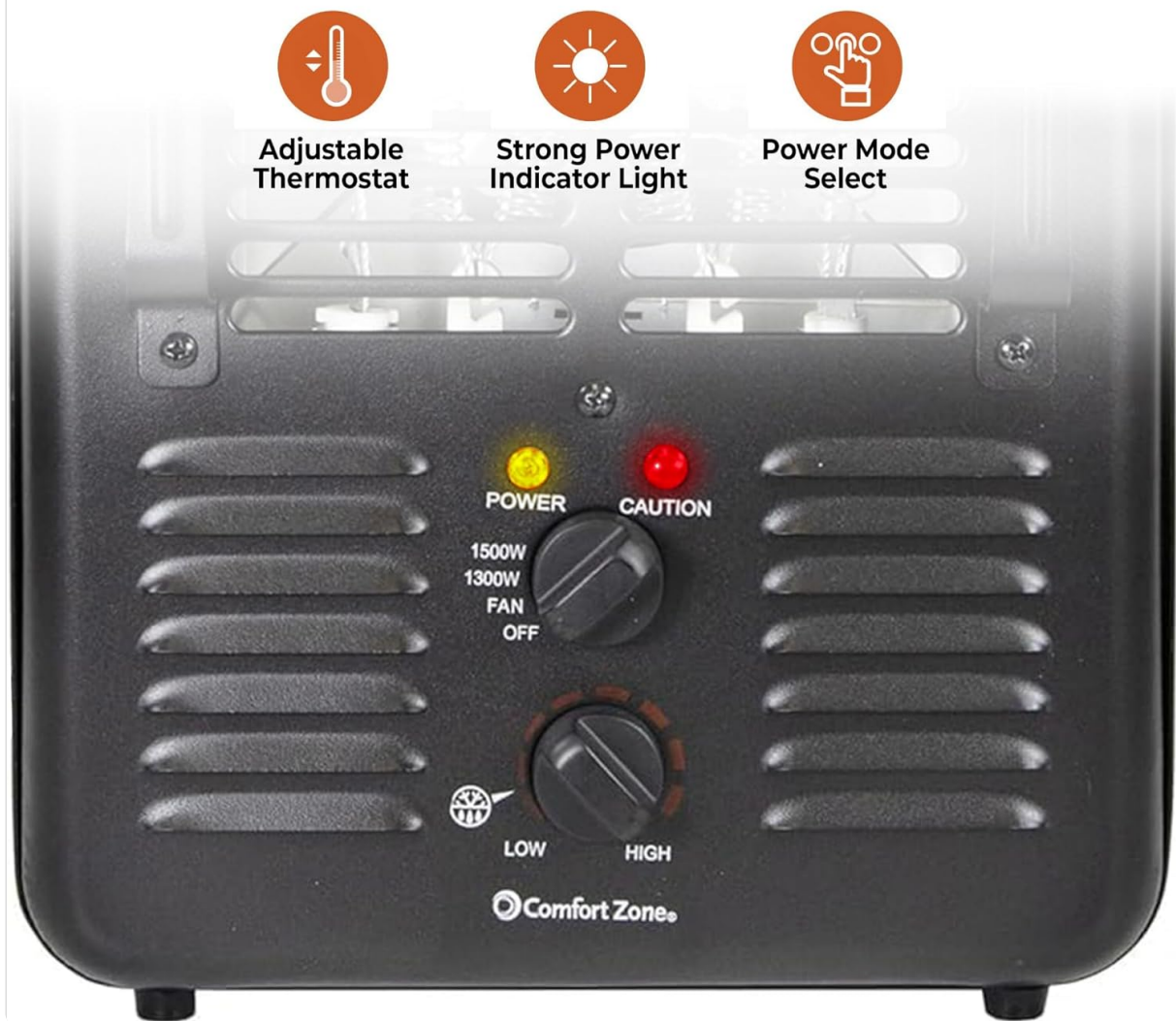
Image: A detailed view of the heater's control panel, highlighting the power/mode selector and the adjustable thermostat dial, along with Power and Caution indicator lights.

1. Power On/Mode Selection: Turn the upper rotary switch to select your desired mode: