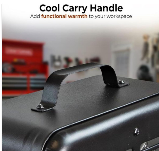
Image: Close-up of the heater's cool-touch metal carry handle, designed for easy portability.

Features a sturdy all-metal housing and an oversized carry handle for easy transport.