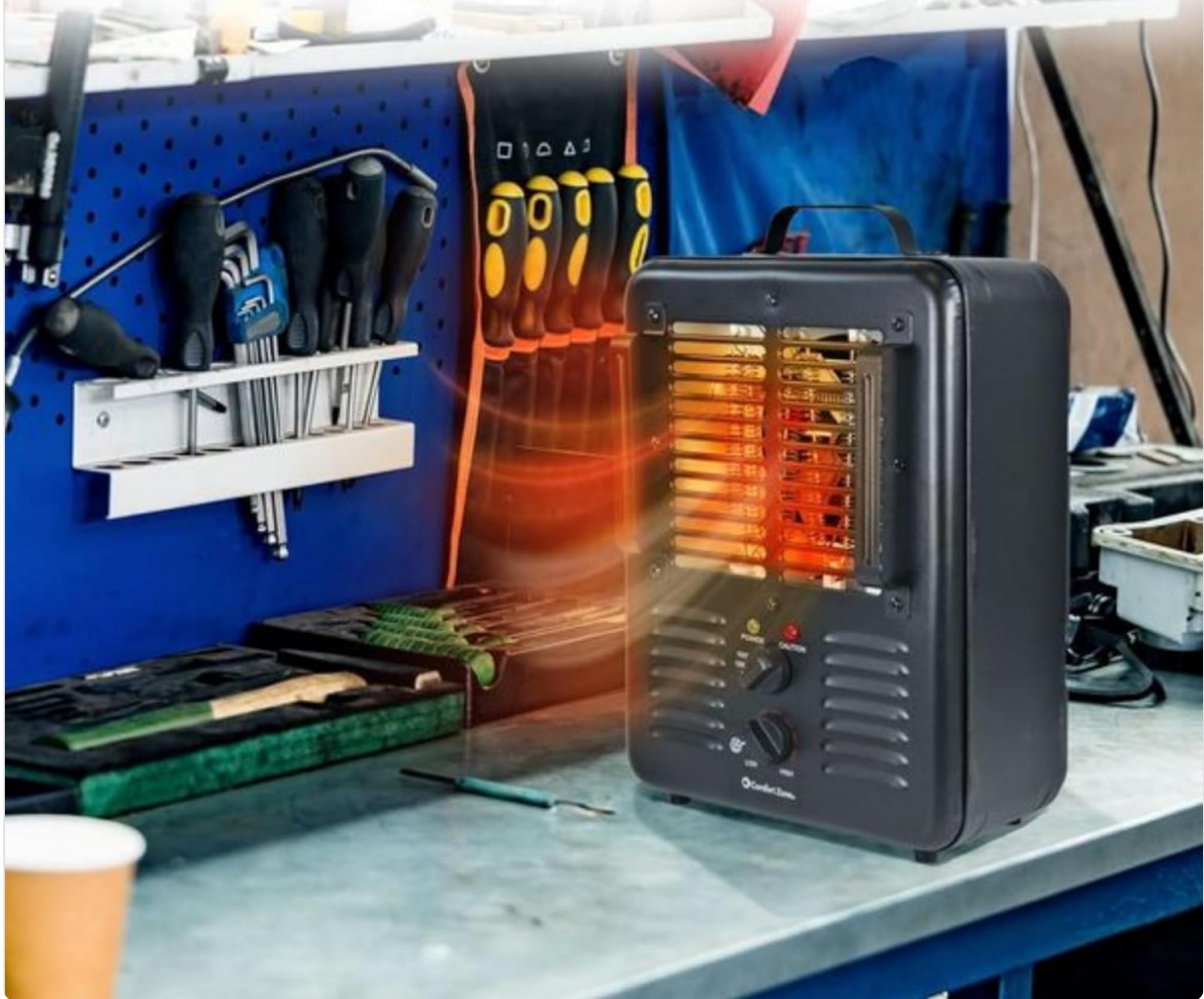
Image: The Comfort Zone CZ799BK heater positioned on a workbench in a garage setting, demonstrating appropriate placement.