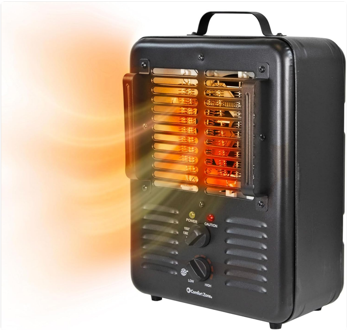
Image: The Comfort Zone CZ799BK Electric Portable Utility Space Heater, showing heat emanating from the front grille.