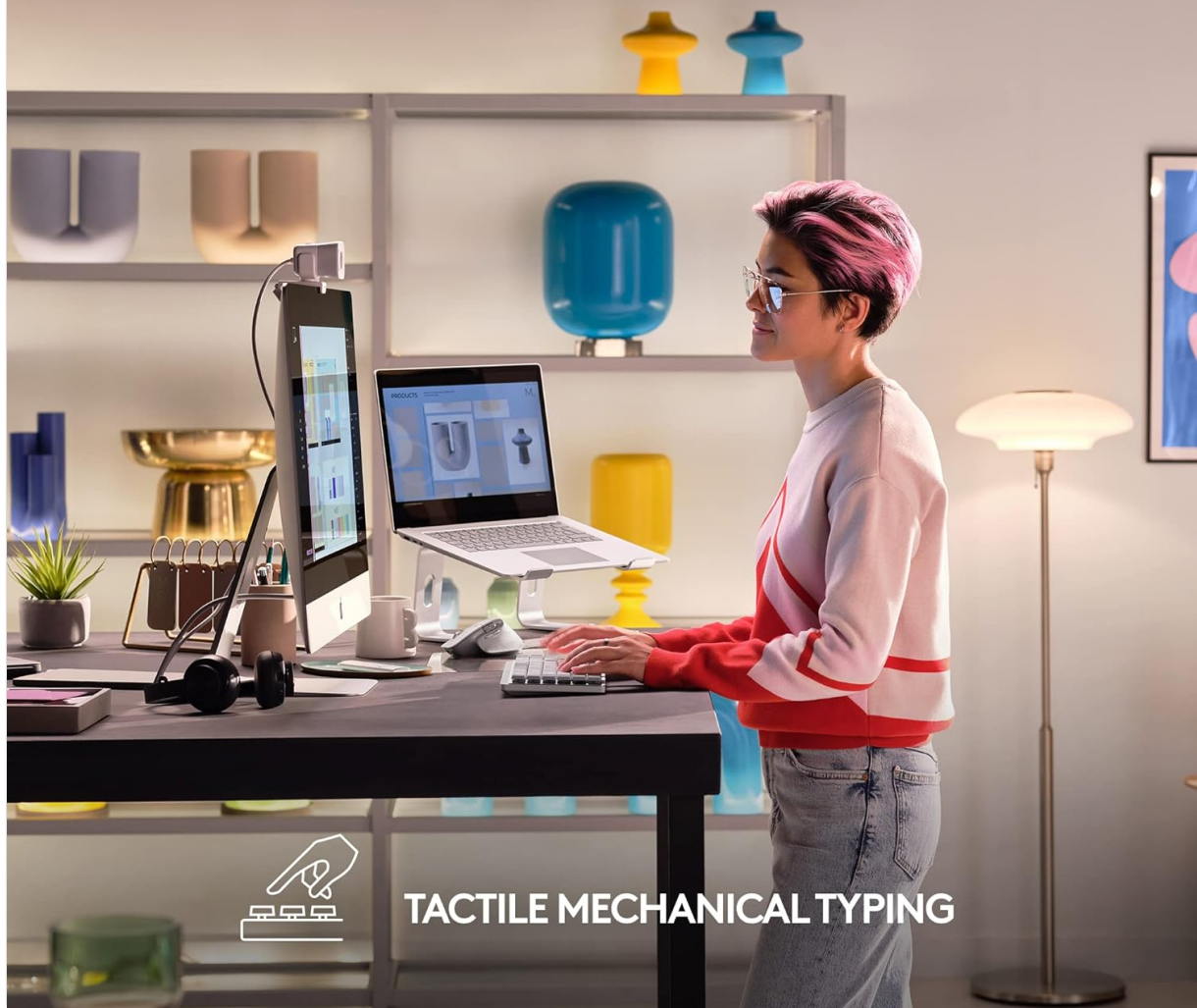
Figure 4: The keyboard's tactile mechanical switches provide a quiet yet responsive typing experience.