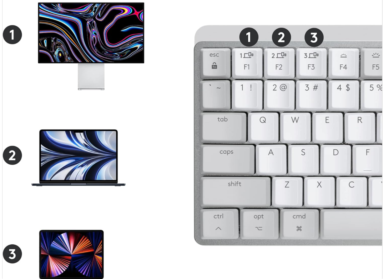
Figure 6: The Logi Options+ software allows for advanced customization of keyboard functions and backlighting.