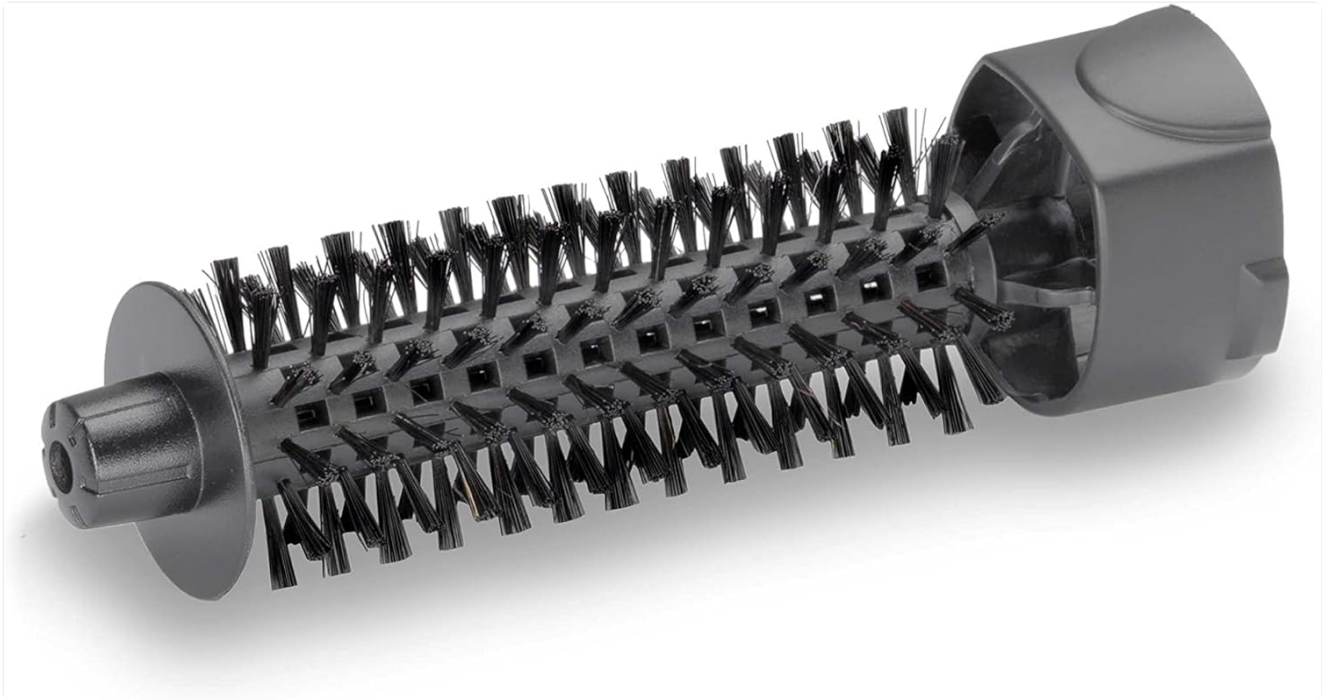
Image: The drying nozzle attachment, designed for initial drying of hair.

Attach the drying nozzle to quickly remove excess moisture from your hair before styling with other attachments. Direct the airflow towards sections of your hair, moving the styler continuously.