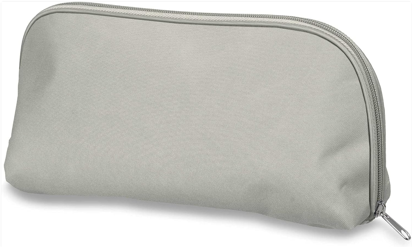
Image: The grey storage bag provided with the BaByliss Hot Air Styler, suitable for keeping the unit and its attachments organized and protected.