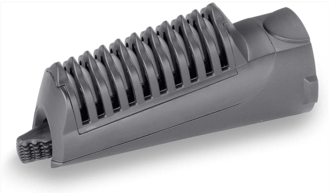
Image: The straightening attachment, designed with comb-like teeth to smooth and straighten hair.

For sleek, straight styles, attach the straightening nozzle. Take small sections of hair and slowly glide the attachment from roots to ends. The airflow and comb-like design help to smooth the hair cuticle.