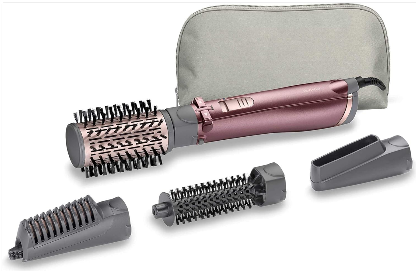
Image: The BaByliss Beliss AS960E Hot Air Styler handle with the 50mm brush attached, alongside the 20mm brush, straightening attachment, and drying nozzle.