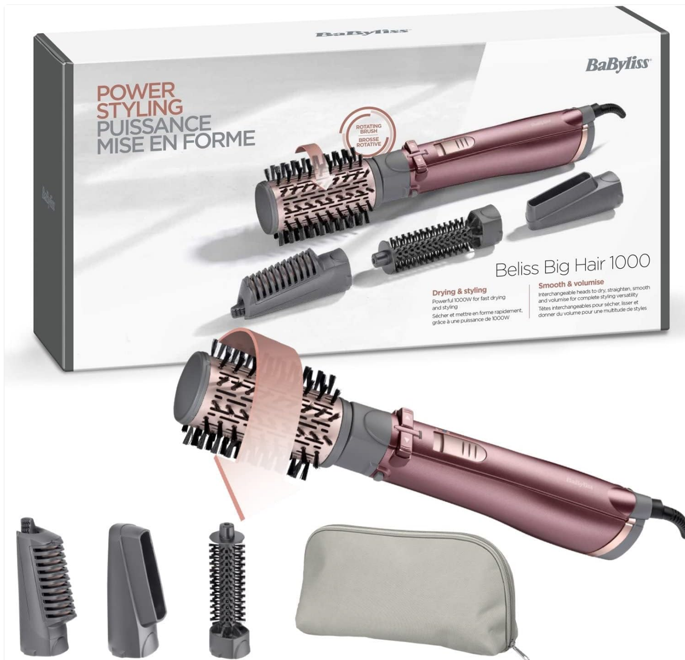
Image: The BaByliss Beliss AS960E Hot Air Styler, its various attachments, and the product packaging, illustrating the complete set.