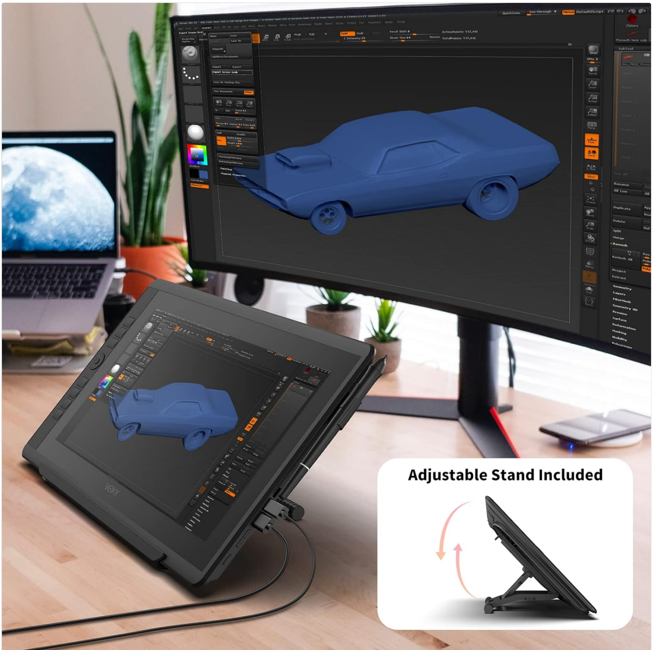
Image: The VEIKK VK1560 Pro drawing monitor shown with its adjustable stand, demonstrating various viewing angles.