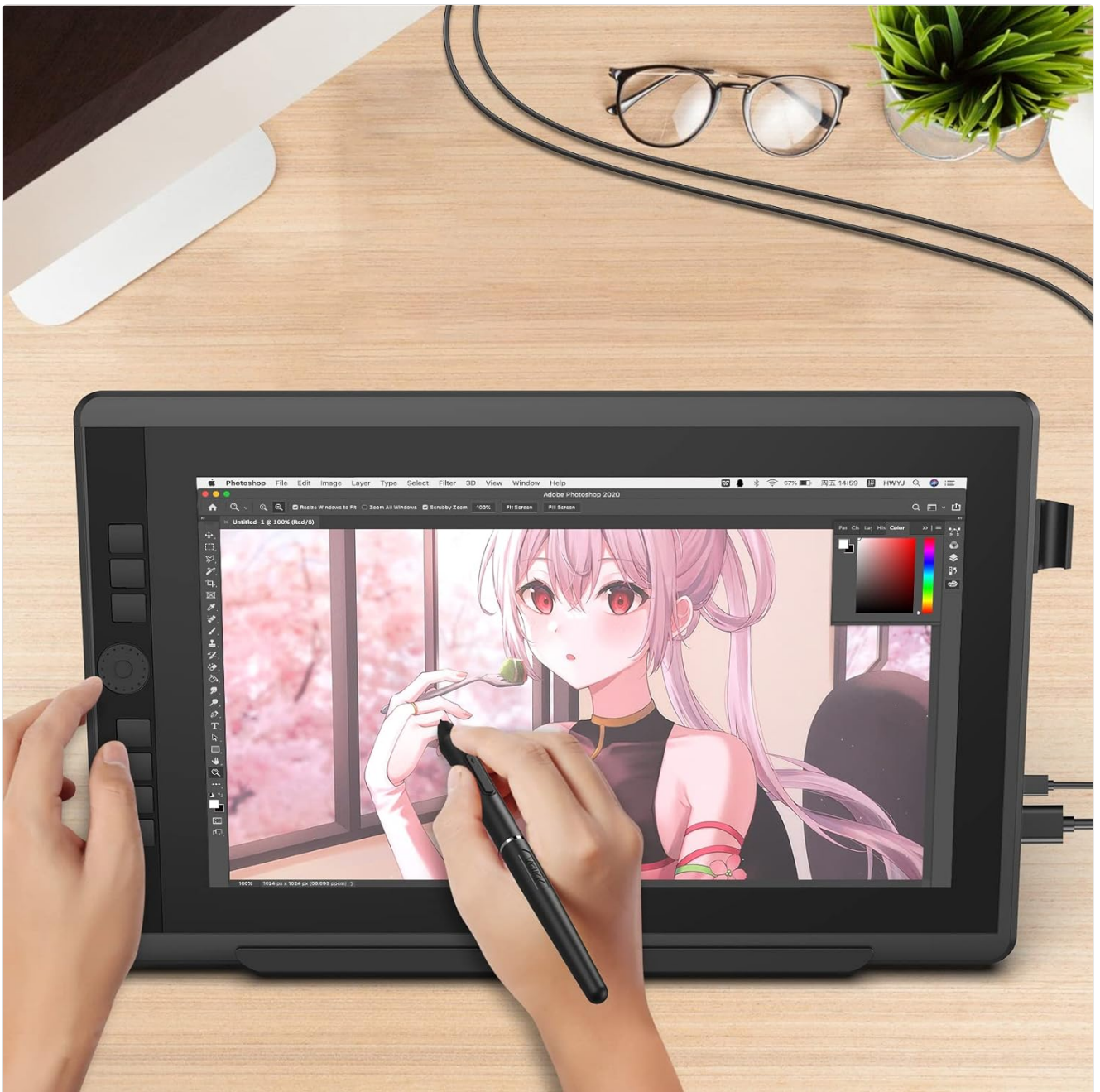
Image: A user actively drawing on the VEIKK VK1560 Pro screen using the battery-free stylus, demonstrating its use in creative applications.