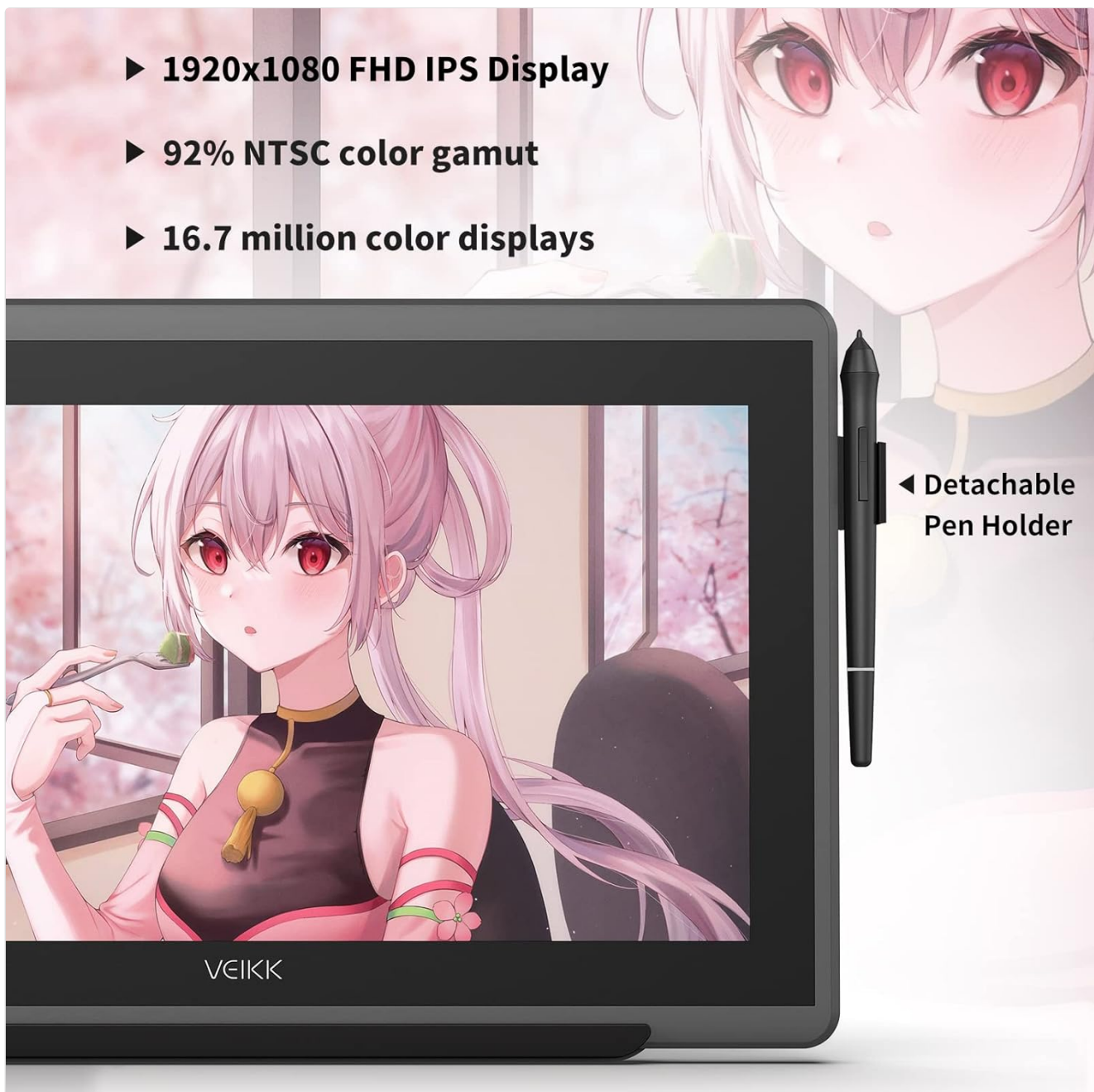
Image: The VEIkk VK1560 Pro screen showcasing its 1920x1080 FHD IPS display, 92% NTSC color gamut, and 16.7 million colors.