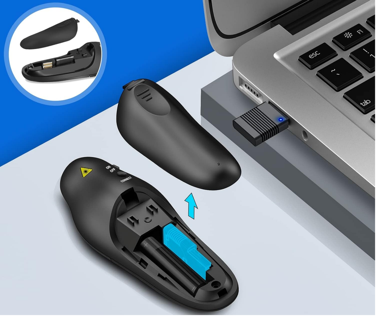
Figure 4: Plug and Play setup with the USB receiver.

Just Plug The Usb Receiver Into The Computer, No Need To Download Additional Drivers