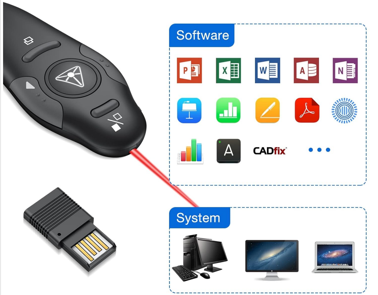
Figure 7: Compatibility with popular software and operating systems.

Support Operation Keynote, Prezi, Google Slides, Ms Word, Excel, Powerpoint, Acd See, Website Etc and Applicable To Windows, Mac Os, Linux