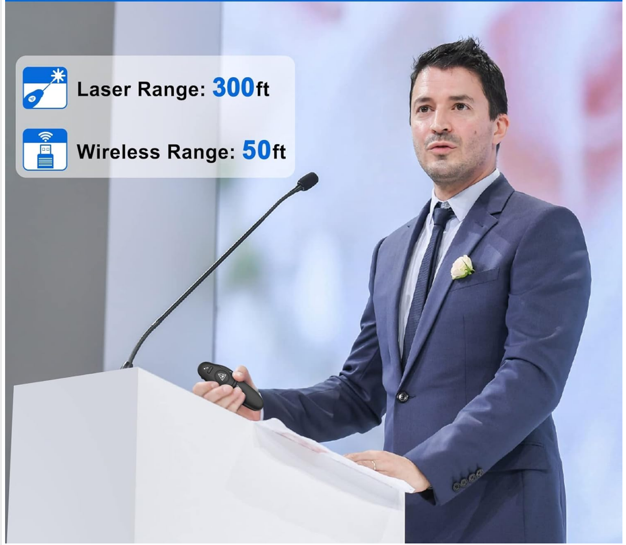
Figure 6: The Wireless Presenter is a valuable tool for various presentation settings.