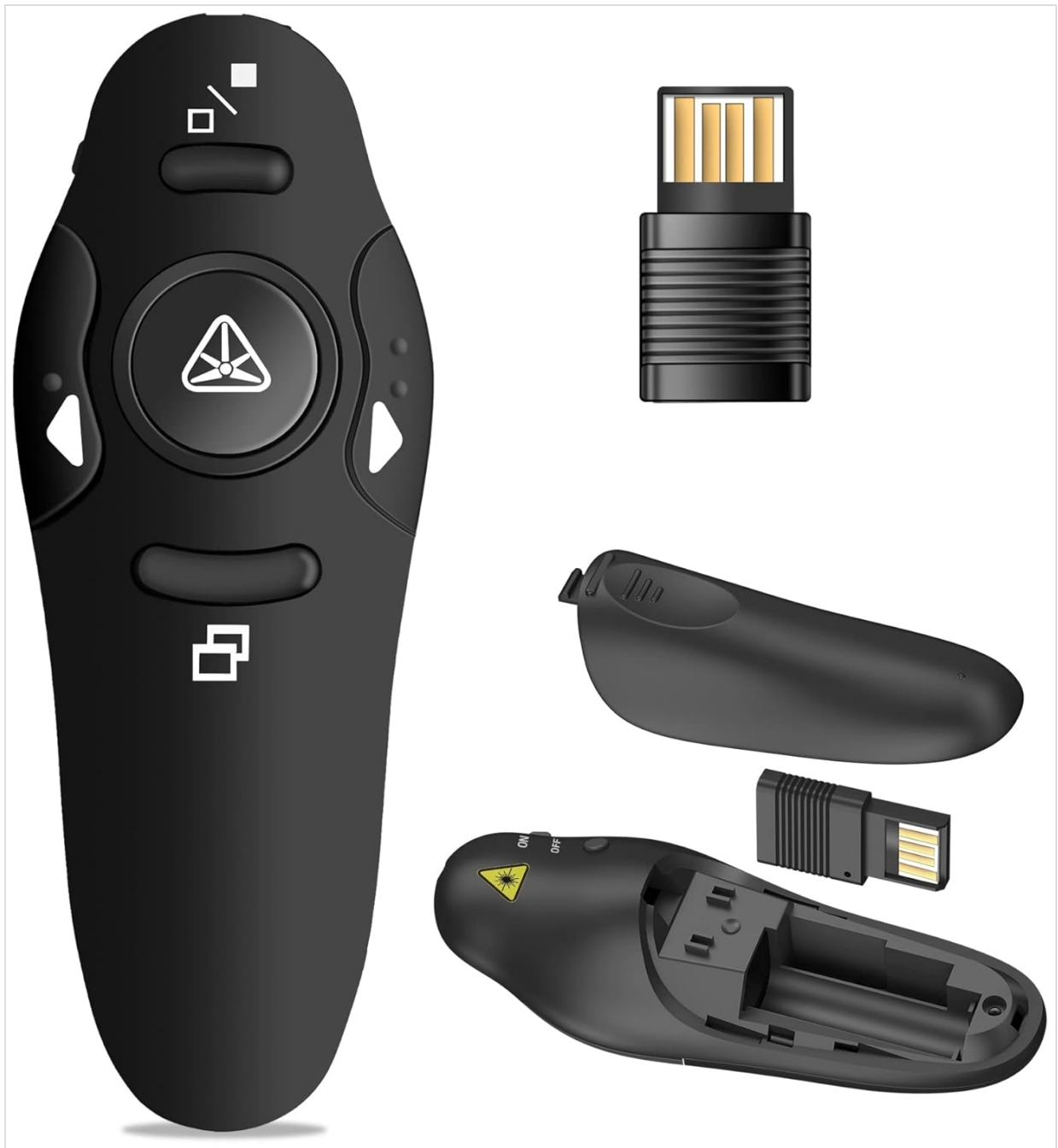
Figure 3: Battery installation and USB receiver location.