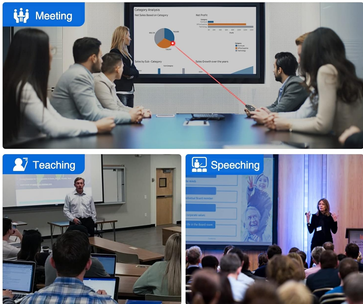
Figure 5: Wireless and laser range for effective interaction.

The Wireless Presenter makes office activities easier