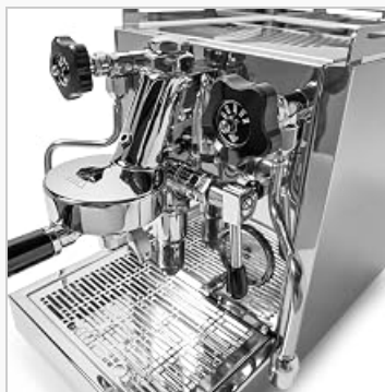
Figure 3: Close-up view of the E61 brew group, showing the manual control lever.