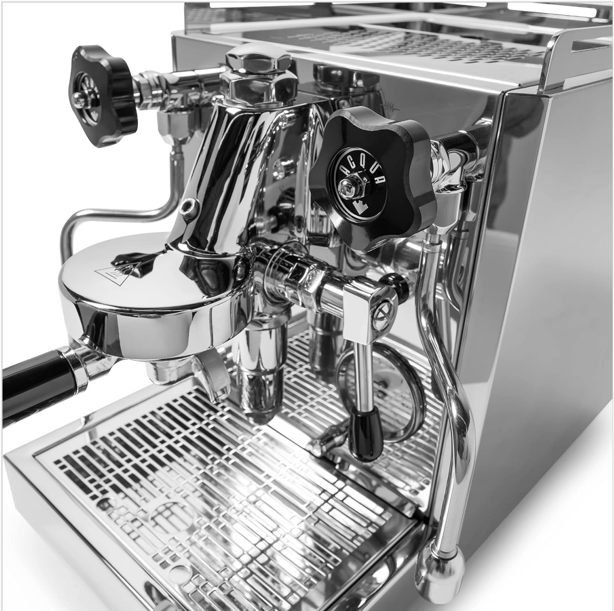
Figure 2: Diletta Bello Espresso Machine placed on a kitchen counter.