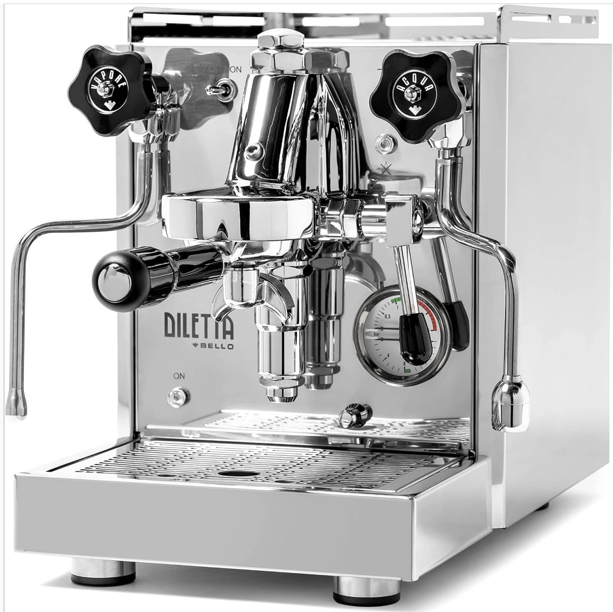
Figure 1: Front view of the Diletta Bello Espresso Machine.