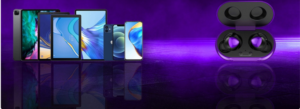
Image: A graphic displaying various mobile phones, tablets, and laptops, alongside the UrbanX Street Buds Plus in their charging case, indicating broad compatibility with Android and iOS operating systems.

Compatible with all phone models and all operating systems. iOS, android, windows pc, tablets and more.