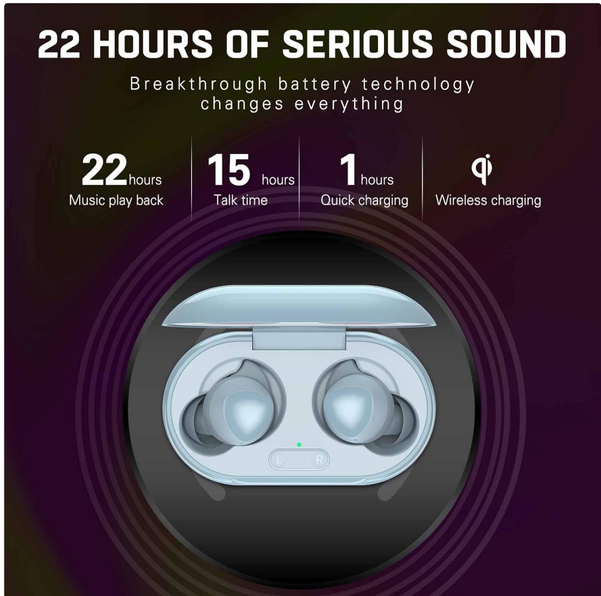
Image: An illustration showing the UrbanX Street Buds Plus in their charging case, highlighting battery life: 22 hours music playback, 15 hours talk time, 1 hour quick charging, and wireless charging capability.

A full charge provides approximately 22 hours of music playback and 15 hours of talk time. Quick charging can provide significant power in about 1 hour.