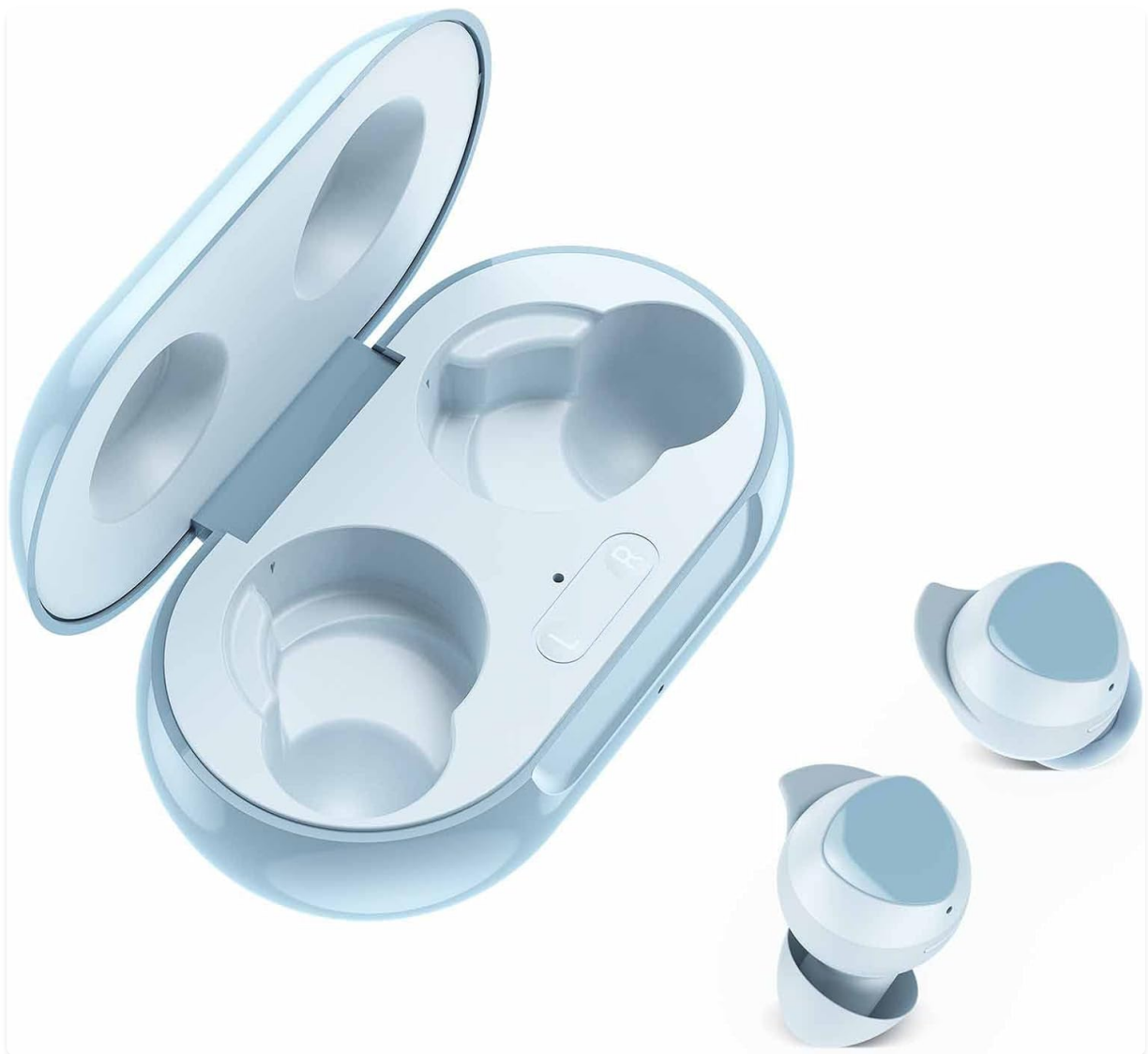
Image: UrbanX Street Buds Plus earbuds shown outside their open charging case. The case is light blue with two earbud compartments and a small indicator light.