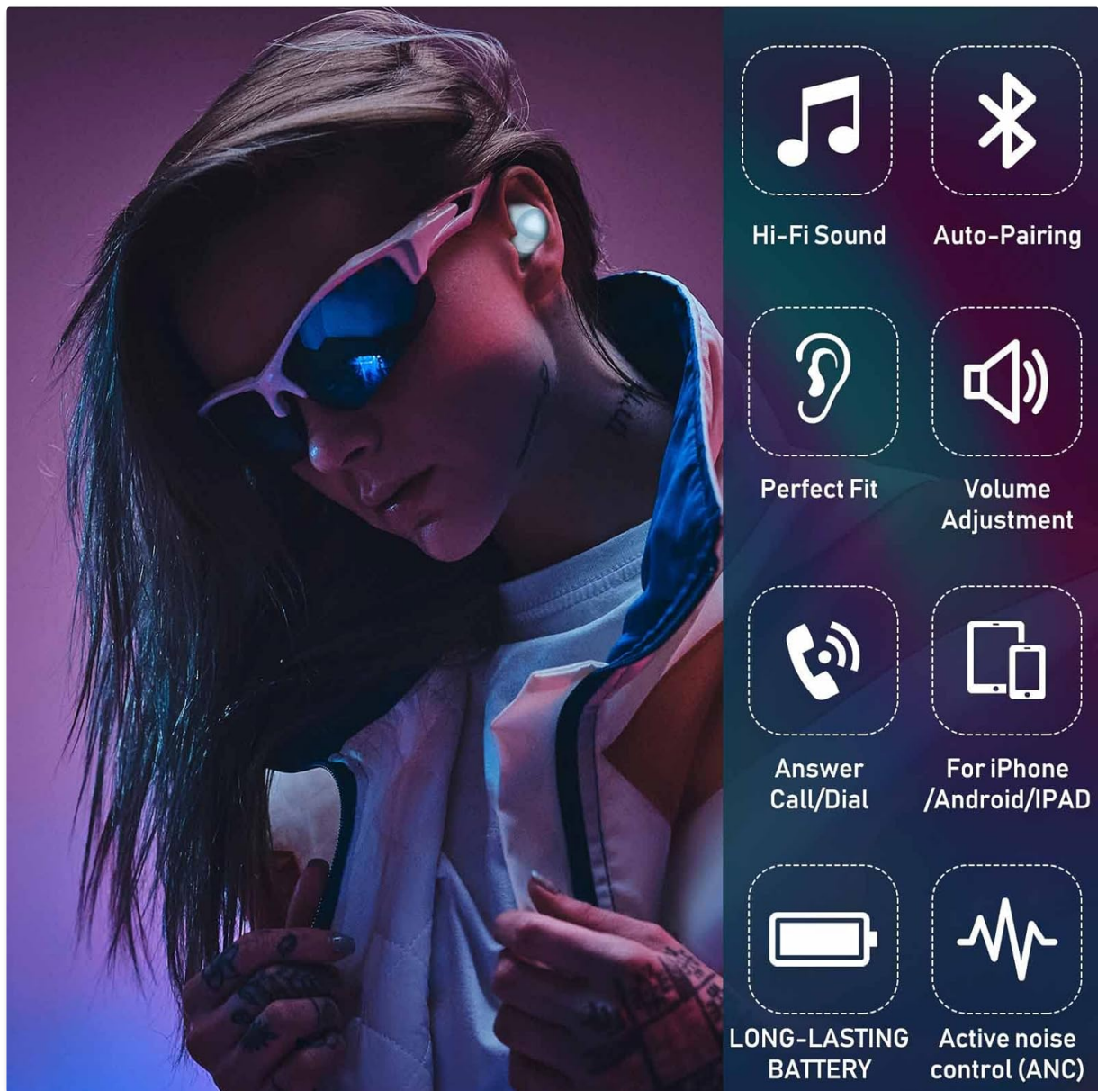
Image: A person wearing an earbud, with icons illustrating key features: Hi-Fi Sound, Auto-Pairing, Perfect Fit, Volume Adjustment, Answer Call/Dial, Compatibility (iPhone/Android/iPad), Long-Lasting Battery, and Active Noise Control.