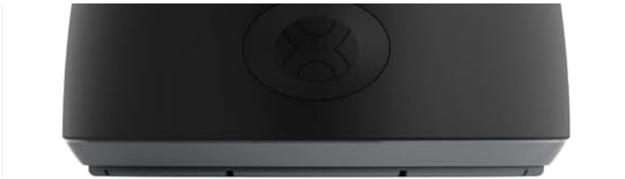
Image: The Promixx shaker bottle in action, demonstrating the powerful vortex created by the motor for efficient mixing of liquids and powders.