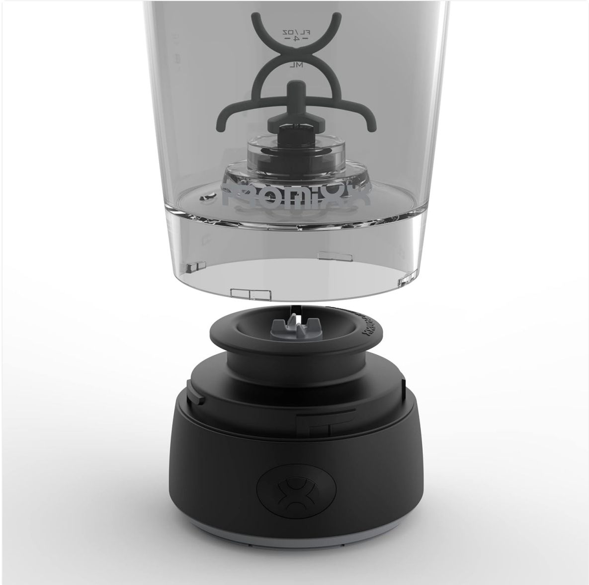
Image: The Promixx shaker bottle with its motor base detached, demonstrating the modular design for easy assembly and cleaning.