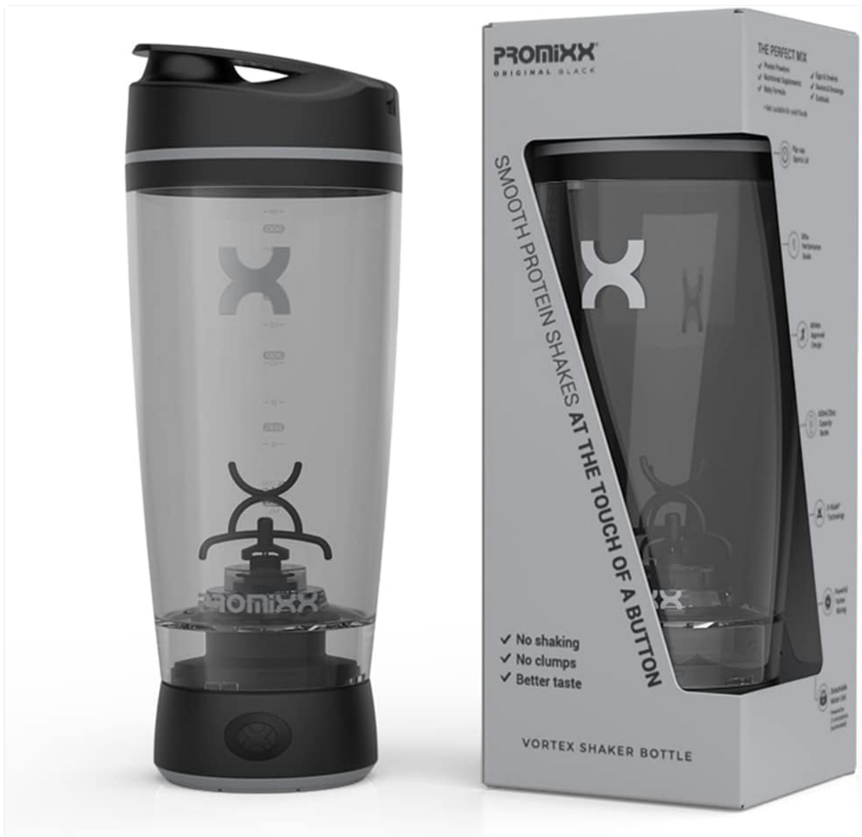
Image: The Promixx Original Shaker Bottle displayed next to its retail packaging, highlighting its sleek design and key features.