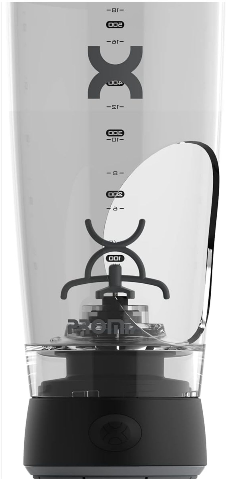
Image: A close-up view of the detachable motor base, illustrating the battery compartment and how to access it for battery installation.