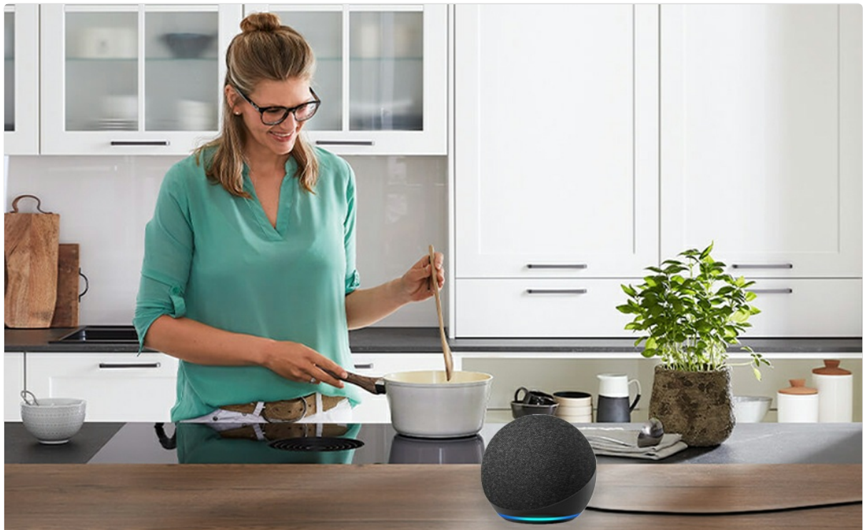
Image: The PDEEY 15W Power Cord Replacement shown alongside various compatible Amazon Echo devices, illustrating its intended use.

Key features include a 15W power output, a convenient 5-foot cable length, and a durable DC barrel tip connector. Its compact design makes it suitable for both home use and travel.