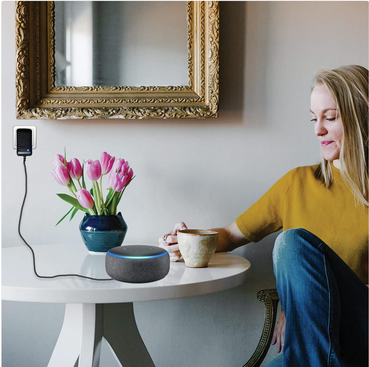
Image: A woman connecting the PDEEY power cord to an Alexa Dot device, demonstrating the setup process.