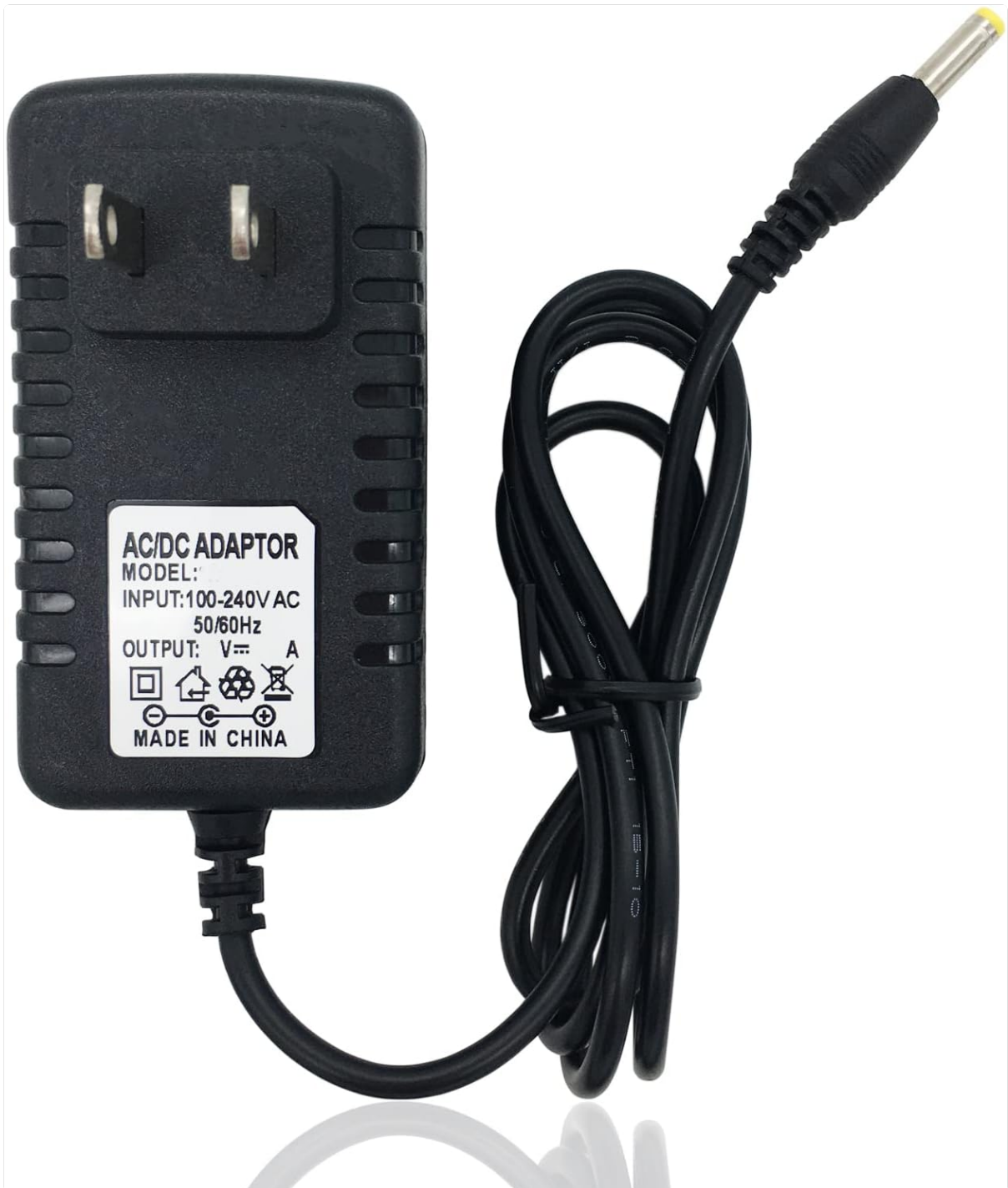
Image: A detailed view of the PDEEY 15W power adapter, showing its specifications label and barrel connector.