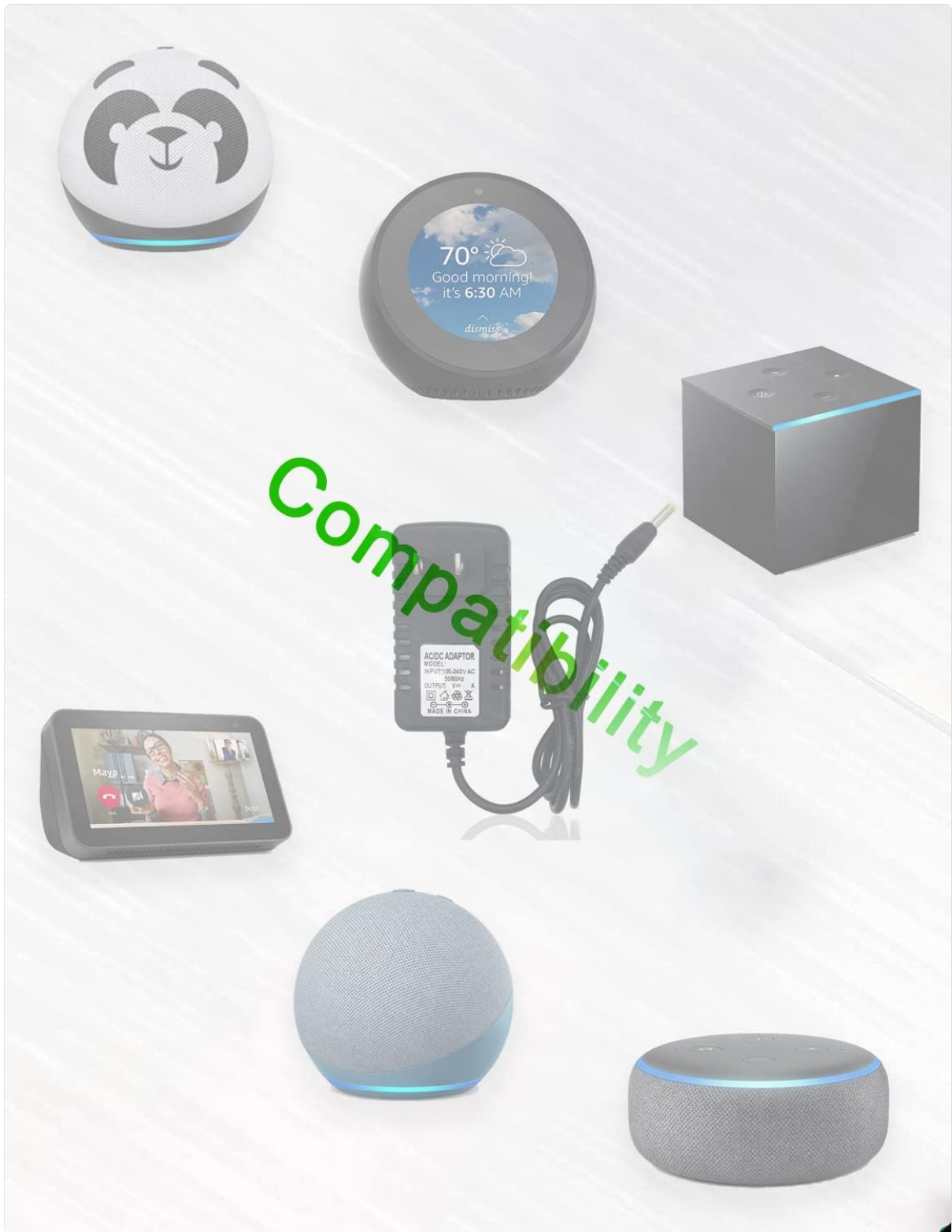
Image: A visual representation of the various Amazon Echo devices compatible with this 15W power cord.

No additional configuration or software is required for the power cord itself. Its function is solely to deliver stable power to your device.