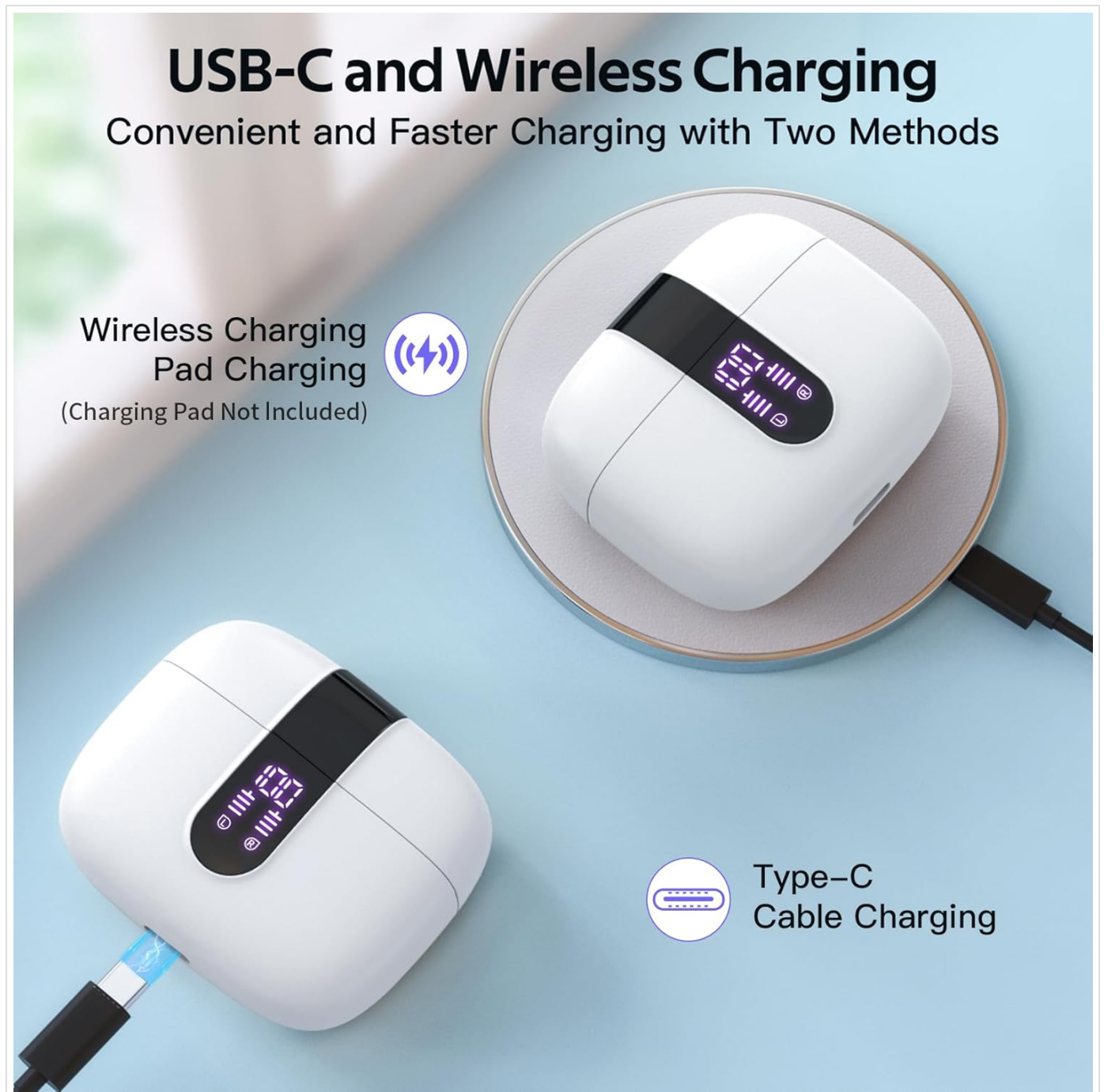
Image: USB-C and Wireless Charging options.