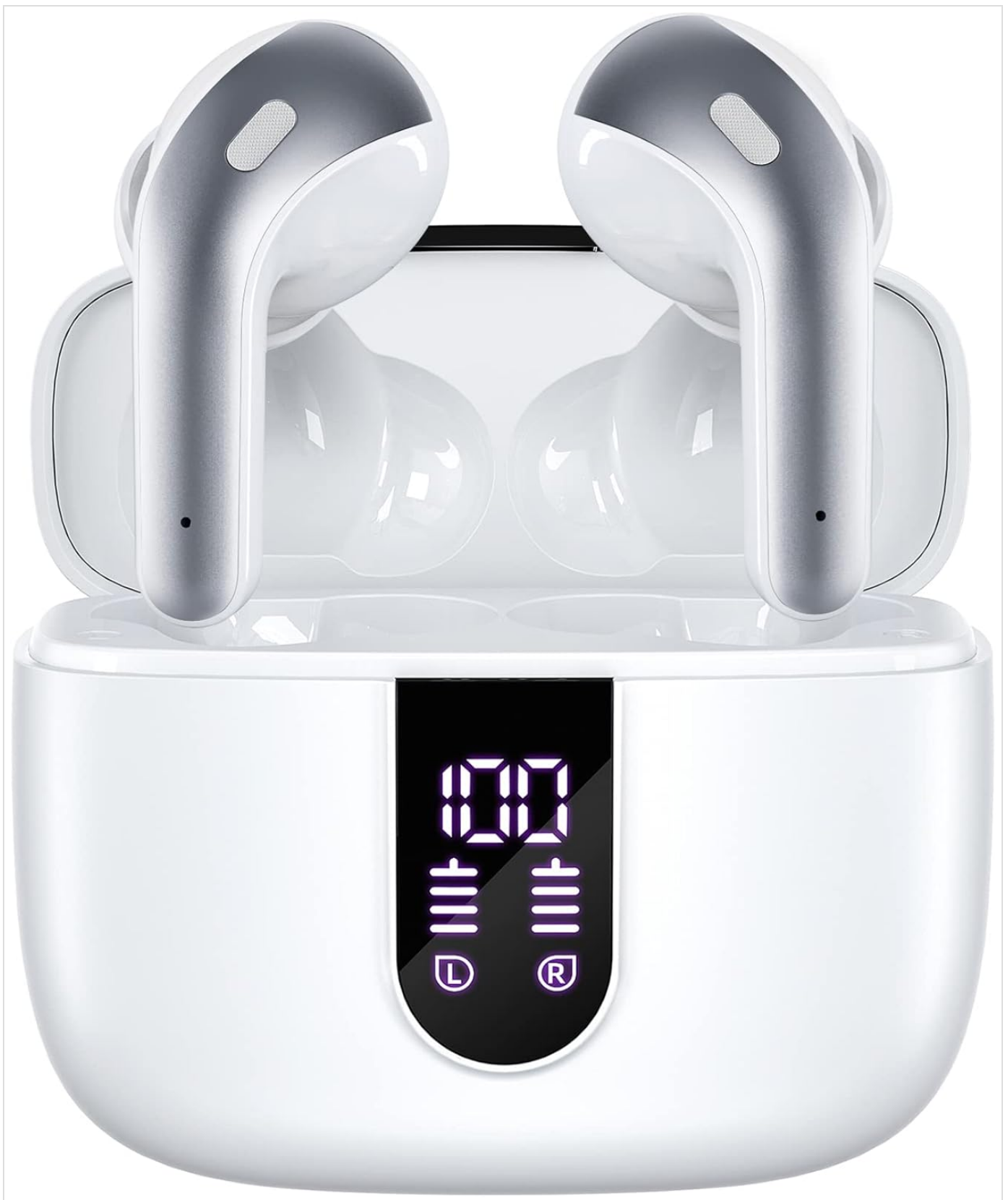
Image: TAGRY X08 True Wireless Earbuds in their charging case.