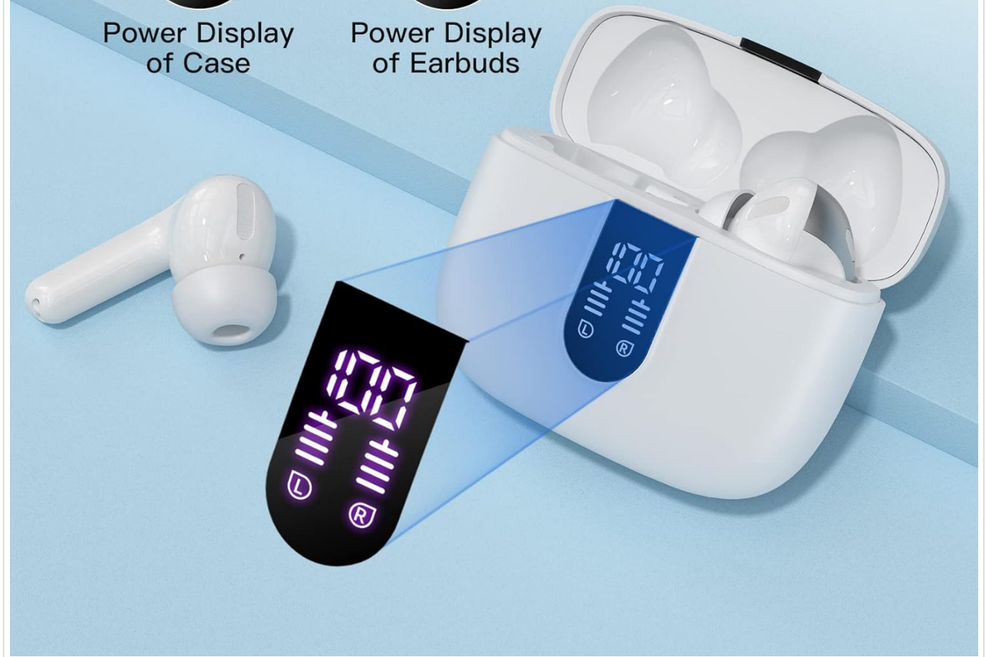
Image: Digital Power Display on the charging case.