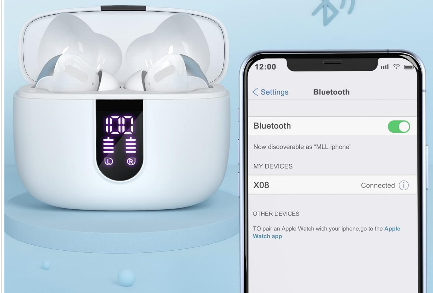
Image: Ergonomic design and customizable ear tips.