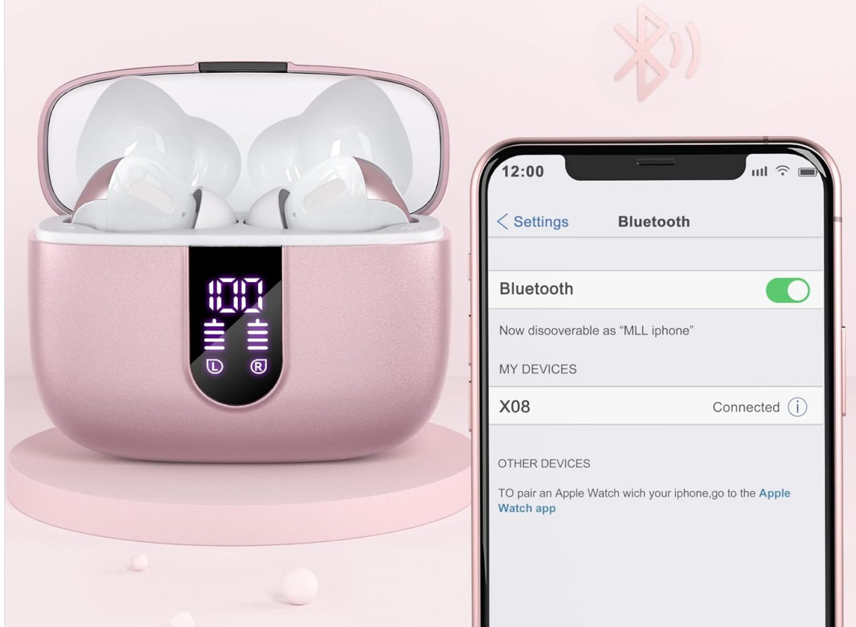
Image: A smartphone screen showing "X08" as a connected Bluetooth device, with the earbuds in their open charging case.

After first pairing, earbuds auto pair with your phone while opening the case