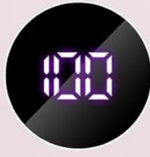
Power Display of Case

Dual digital display to show the power of the charging case and earbuds