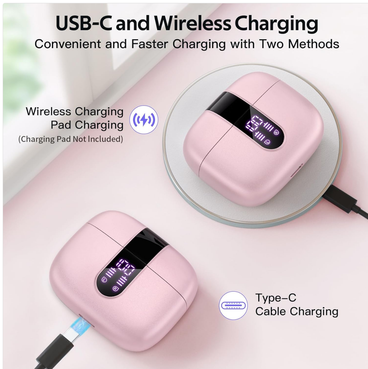
Image: The TAGRY X08 charging case being charged via USB-C cable and wirelessly on a charging pad.

indicators on the case's LED display will show their charging status.