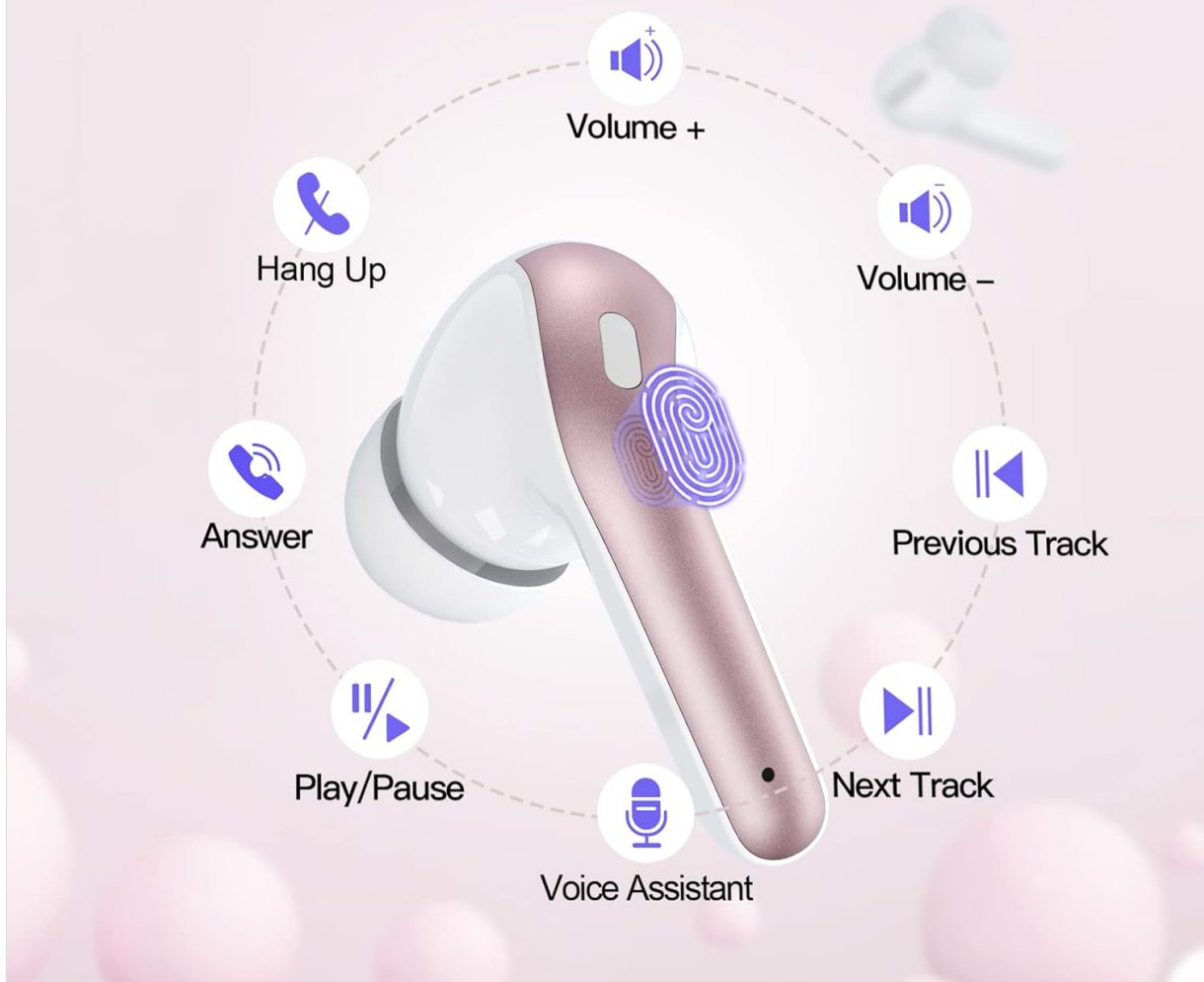
Image: A detailed diagram illustrating the various touch control functions on the earbud, including volume, track control, call management, and voice assistant activation.

Control music and calls with your finger tap