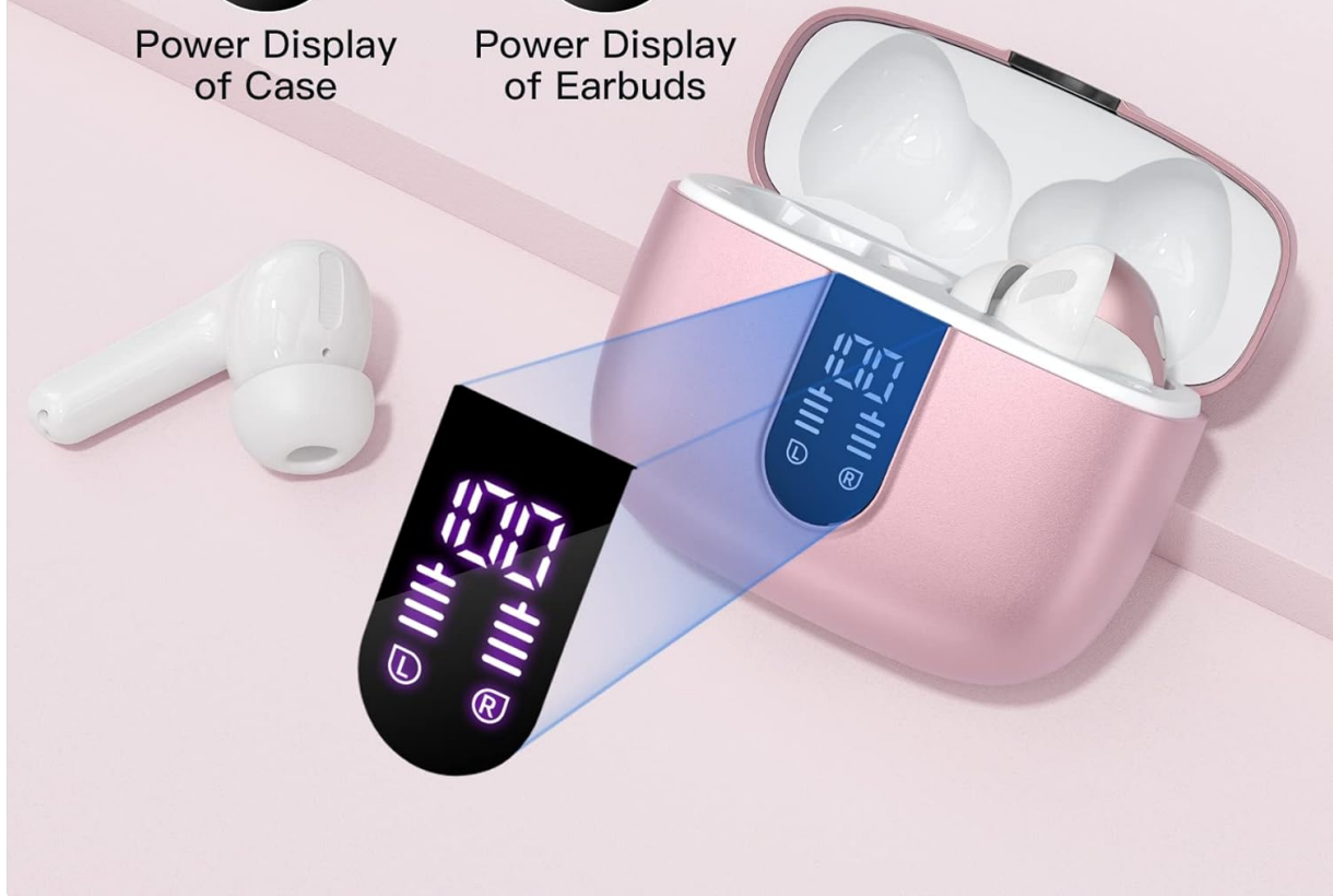
Image: Close-up of the charging case's digital LED display, showing battery percentages for the case and charge indicators for the left and right earbuds.