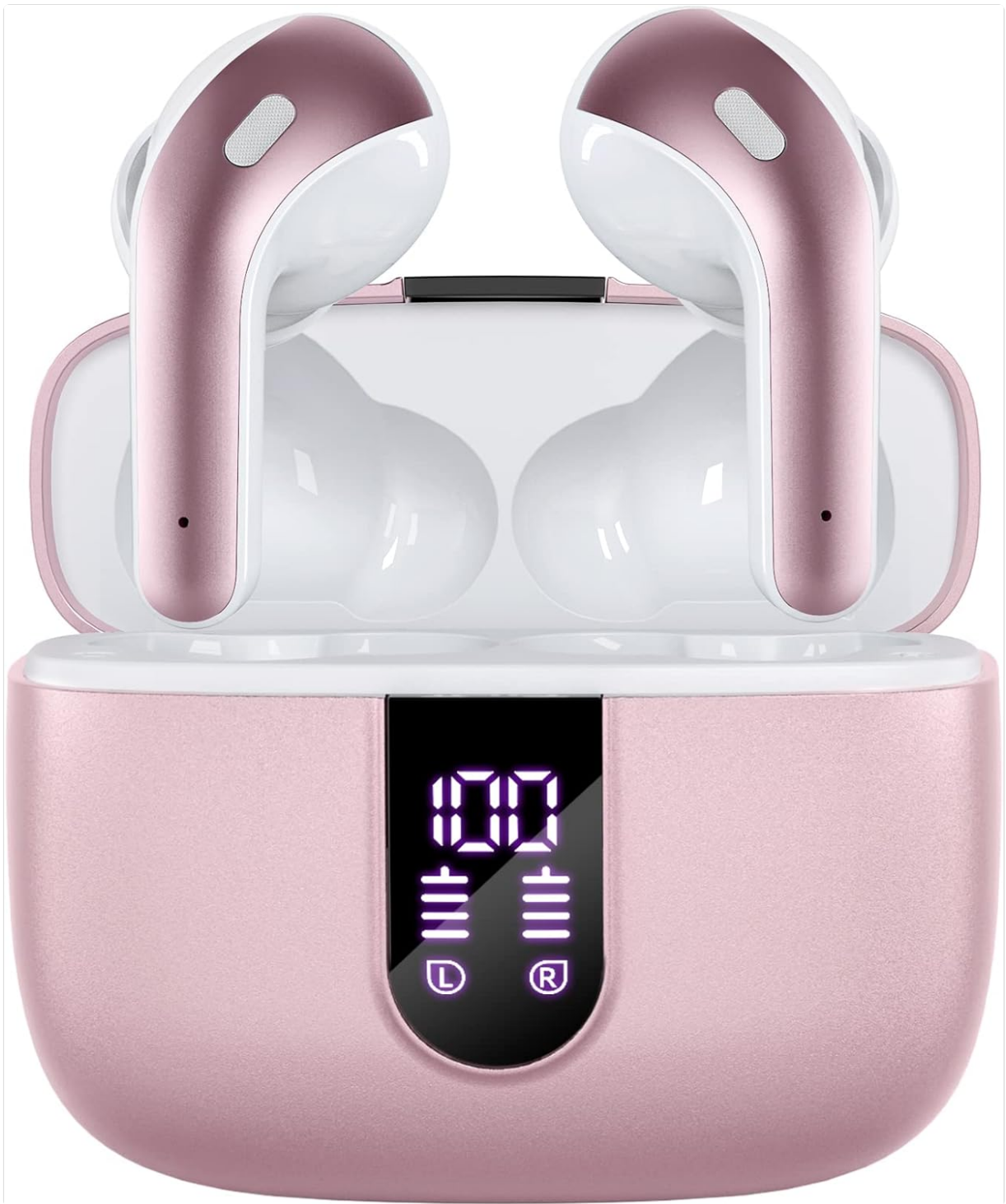
Image: The TAGRY X08 True Wireless Earbuds in their charging case, showcasing the overall product design.