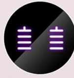
Power Display of Earbuds