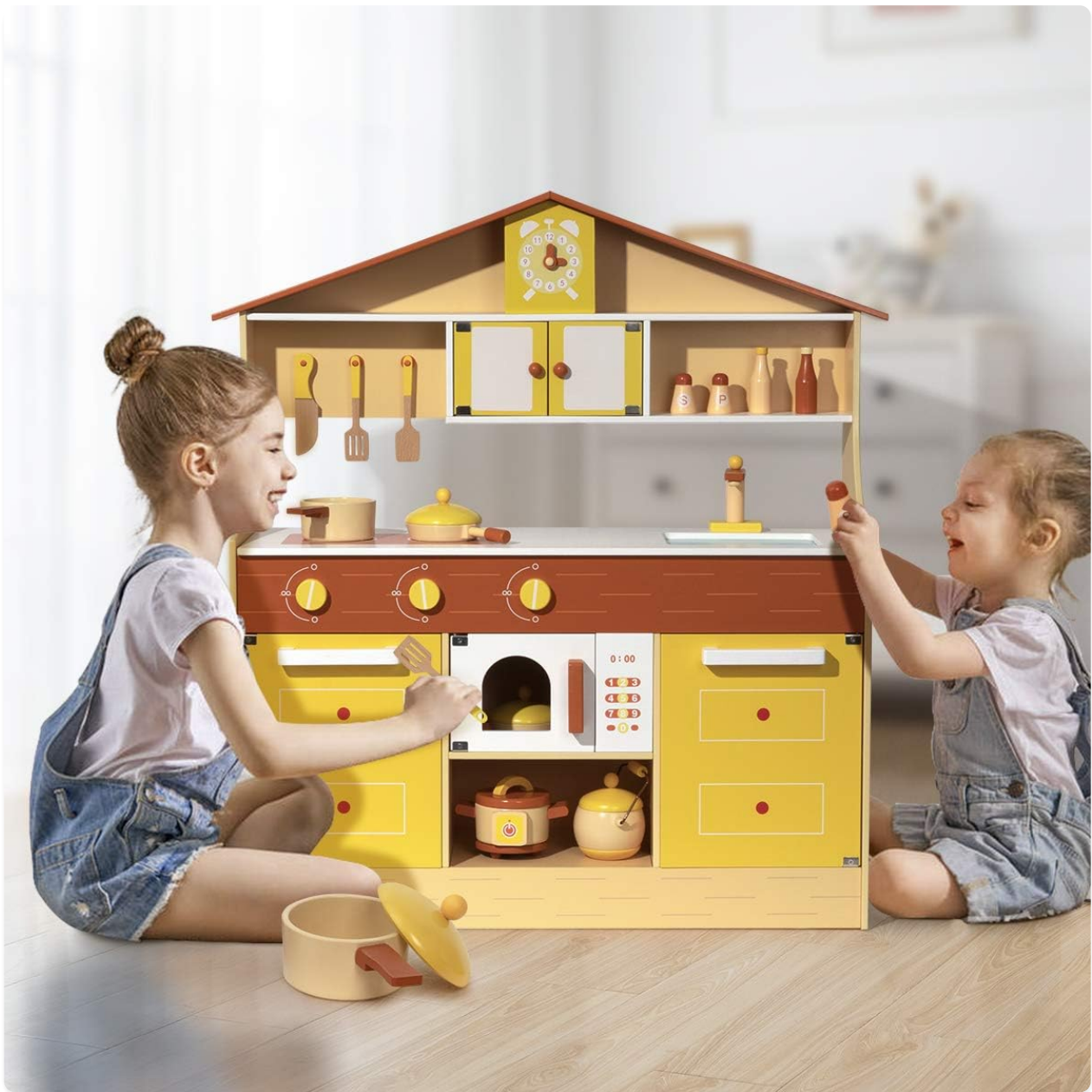
Image: Two children engaged in pretend play with the ROBOTIME WCF01 Wooden Play Kitchen, illustrating typical usage and interaction.