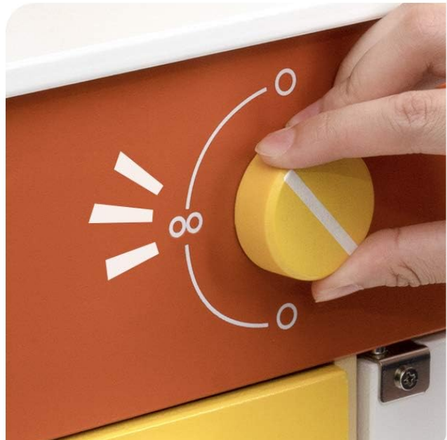
Image: A detailed view highlighting the functional doors and the rotatable, clicking knobs on the play kitchen, demonstrating interactive elements.

Knobs makes a click – Click sound when it turned.