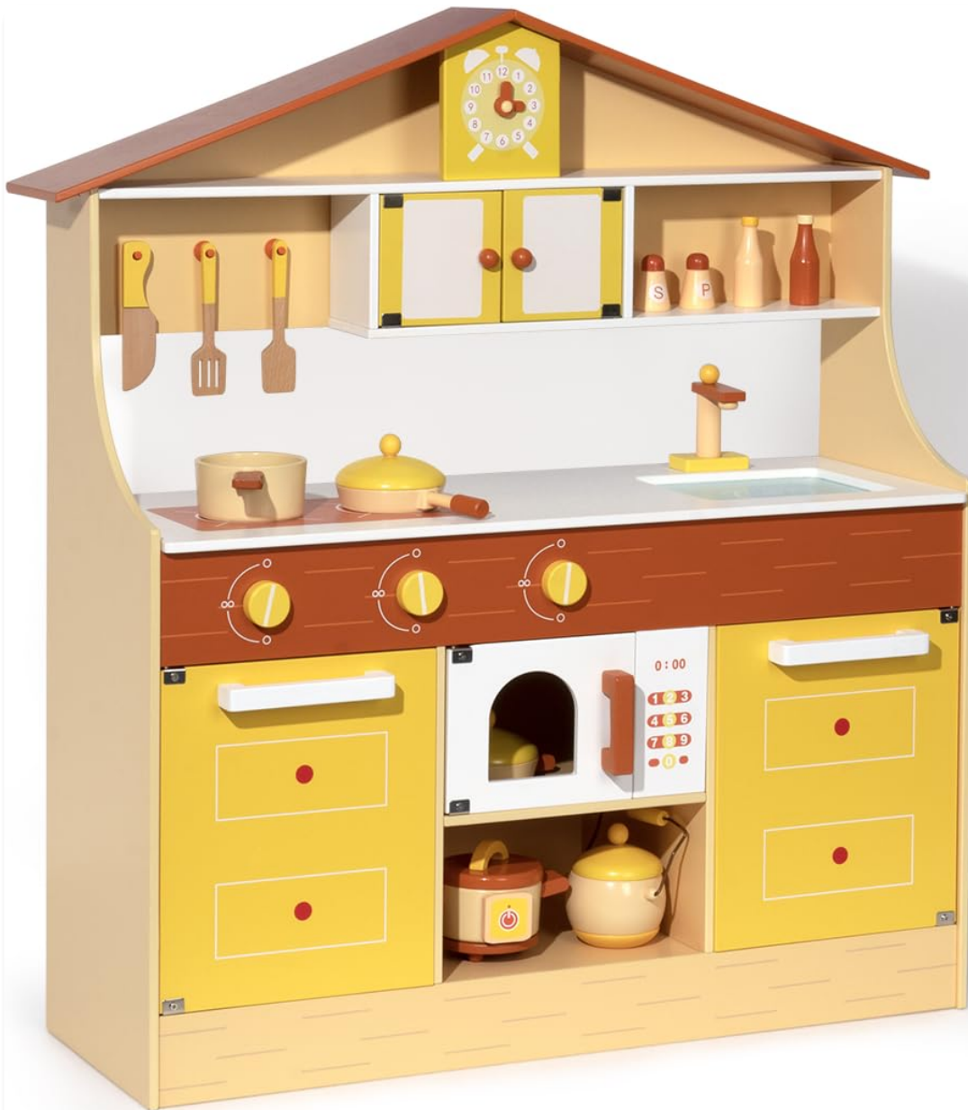
Image: A clear, front-facing view of the ROBOTIME WCF01 Wooden Play Kitchen, showcasing its complete structure and features after assembly.