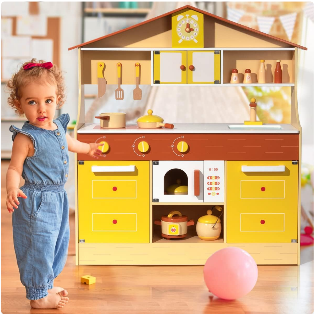
Image: The ROBOTIME WCF01 Wooden Play Kitchen, fully assembled, with a child interacting with it. This image provides an overview of the product's appearance and scale.