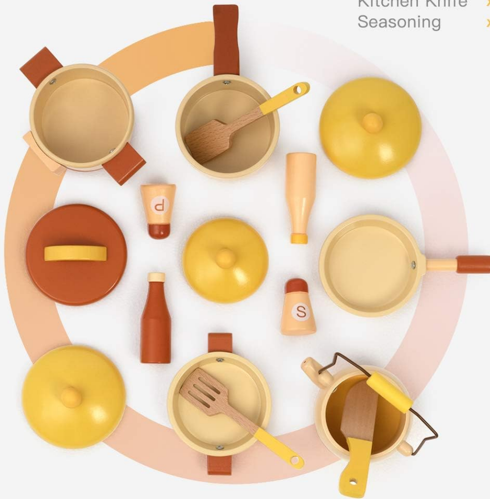
Image: A top-down view of the various accessories included with the play kitchen, such as pots, pans, spatulas, knives, and seasoning bottles, laid out on a neutral background.

Pots x5 Kitchen Shovel x2 Kitchen Knife x1 Seasoning x4