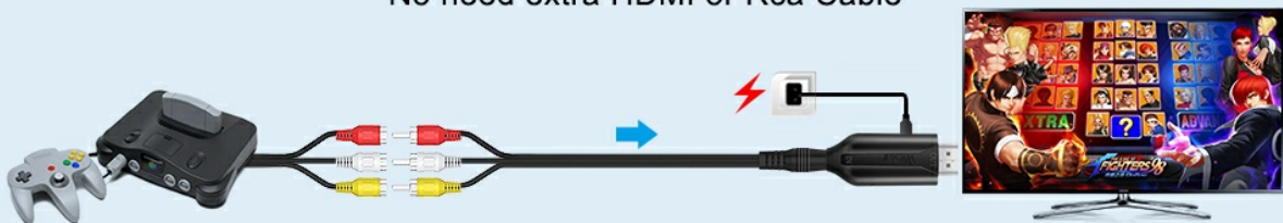
Figure 4.2: Connecting an N64 console to an HDMI TV.

Plug and Play No need extra HDMI or Rca Cable