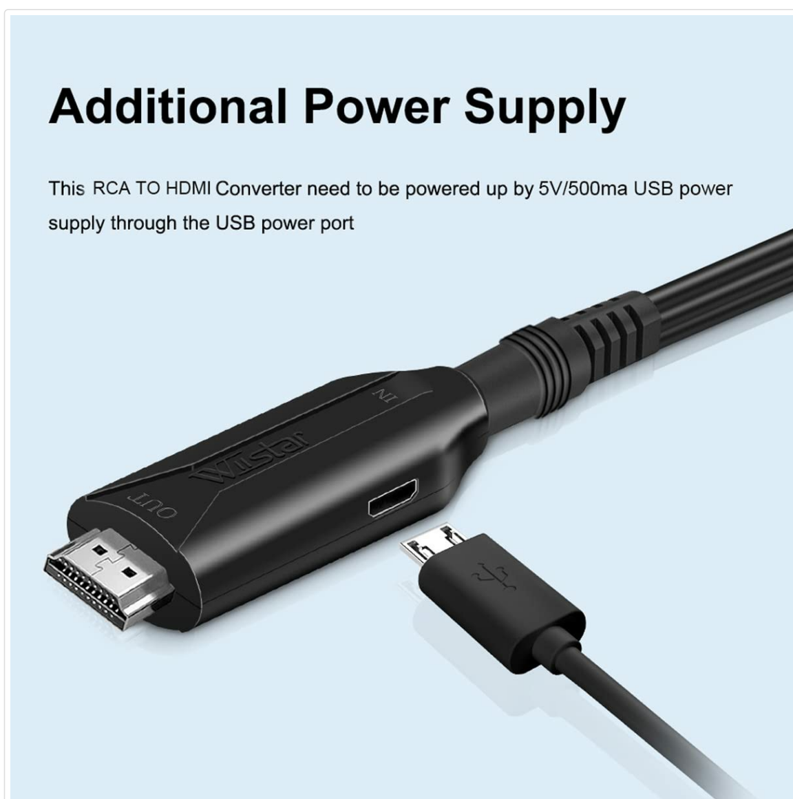
Figure 3.1: Connecting the USB power cable to the converter.