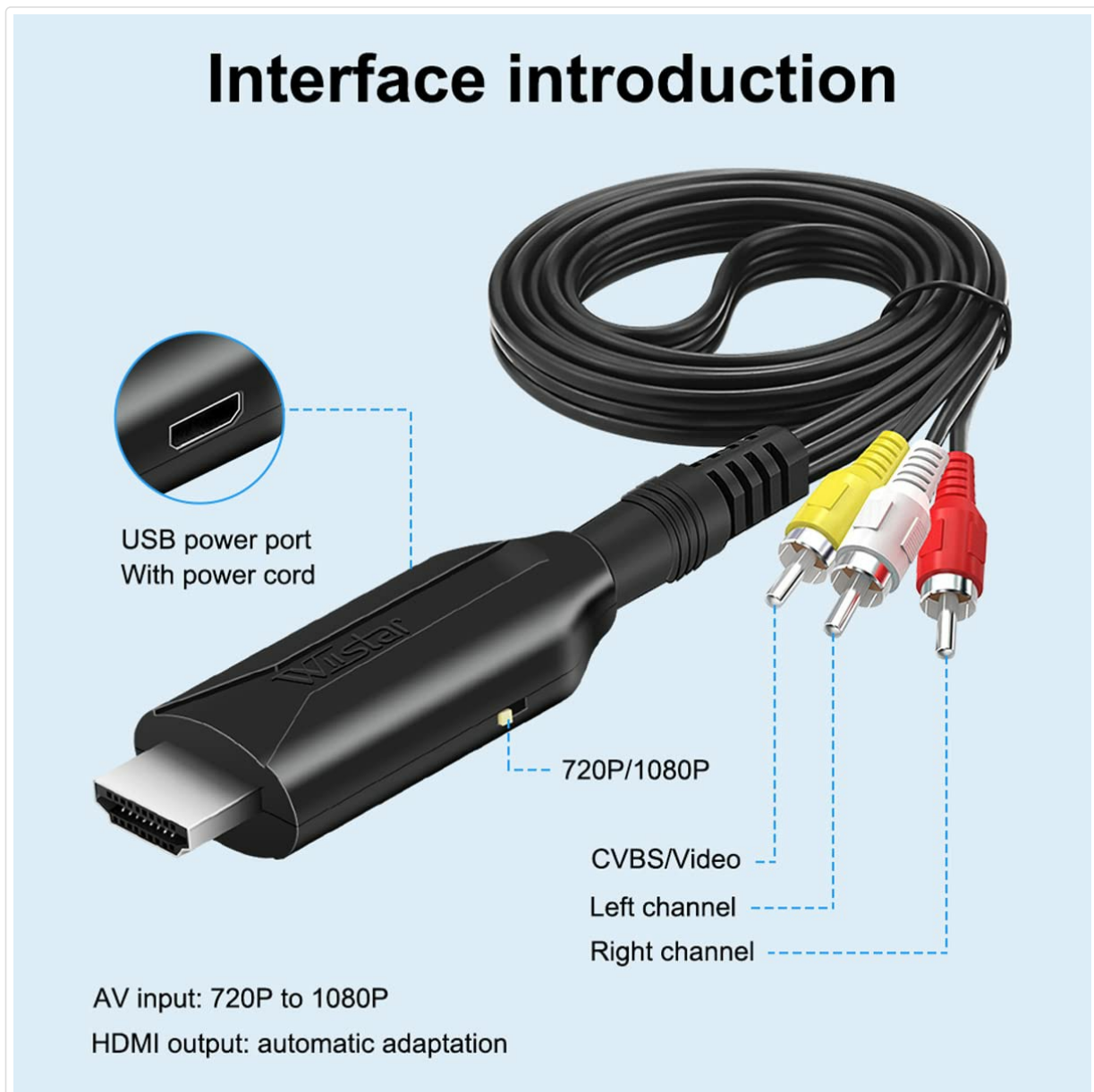
Figure 2.3: Interface diagram of the converter.