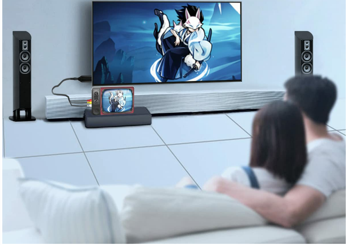
Figure 4.1: Example of connecting an old device to an HDMI TV.