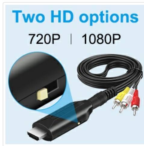
Figure 3.2: Resolution selection switch.