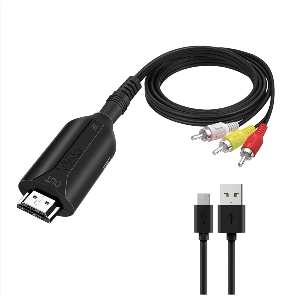
Figure 2.1: Overview of the HDSUNWSTD AV to HDMI Converter Cable Adapter and its USB power cable.