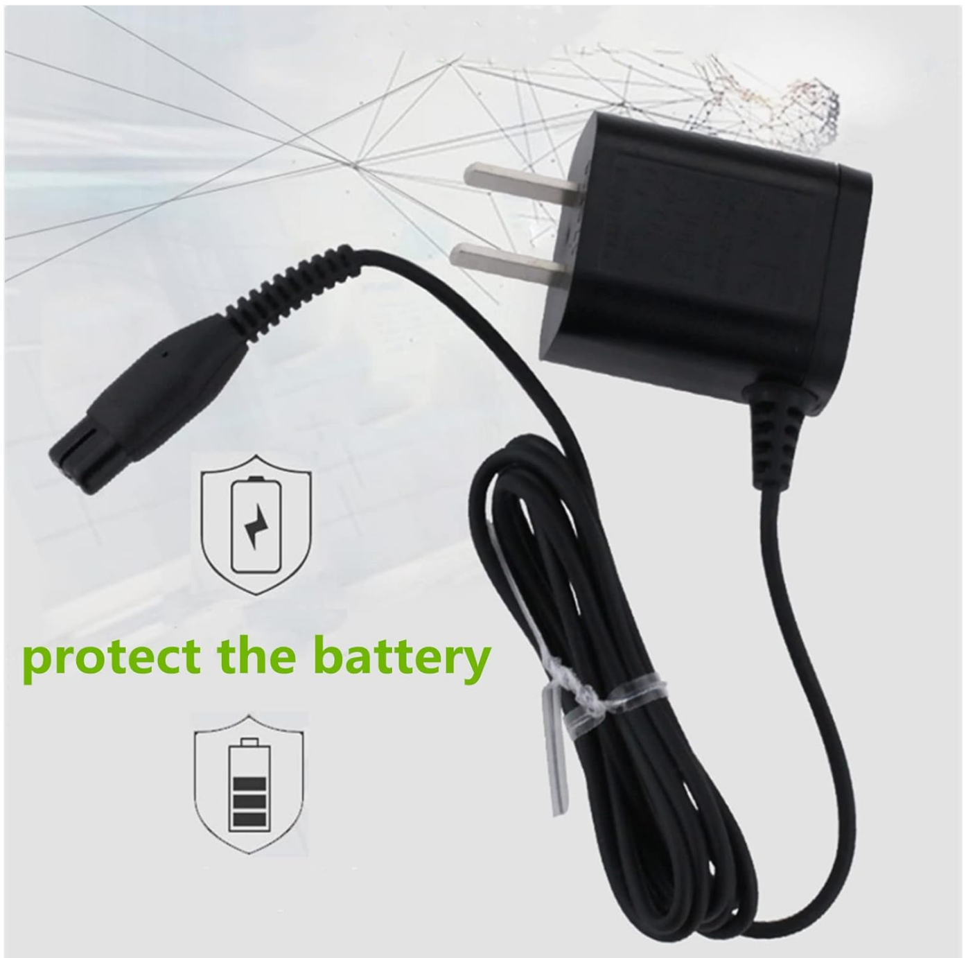
Figure 2: The charger is designed with built-in protections to safeguard your device's battery.

This charger is ETL Listed, FCC, and ROHS Certified, conforming to UL STD. 1310. It includes Over-Voltage Protection, Over-Current Protection, Over-Charge Protection, and Short-Circuit Protection to ensure safe operation.