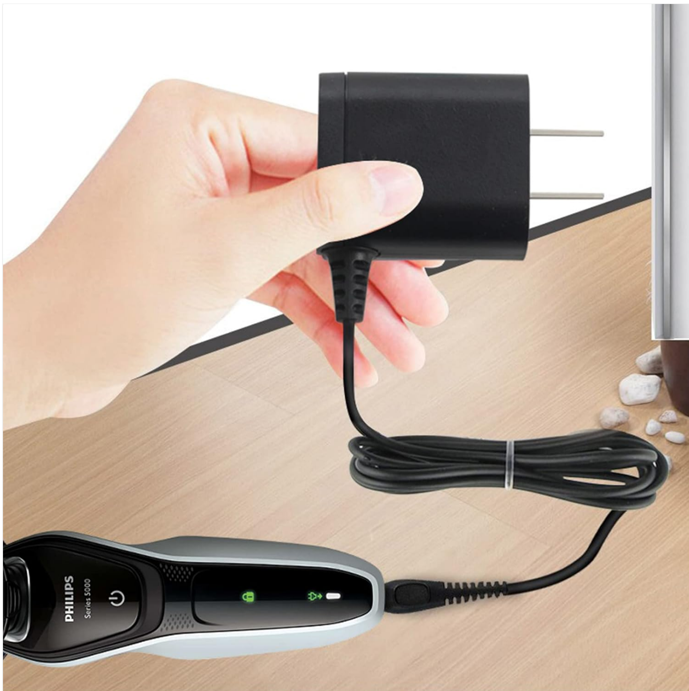
Figure 3: Illustrates the process of connecting the charger to a Philips Norelco shaver.