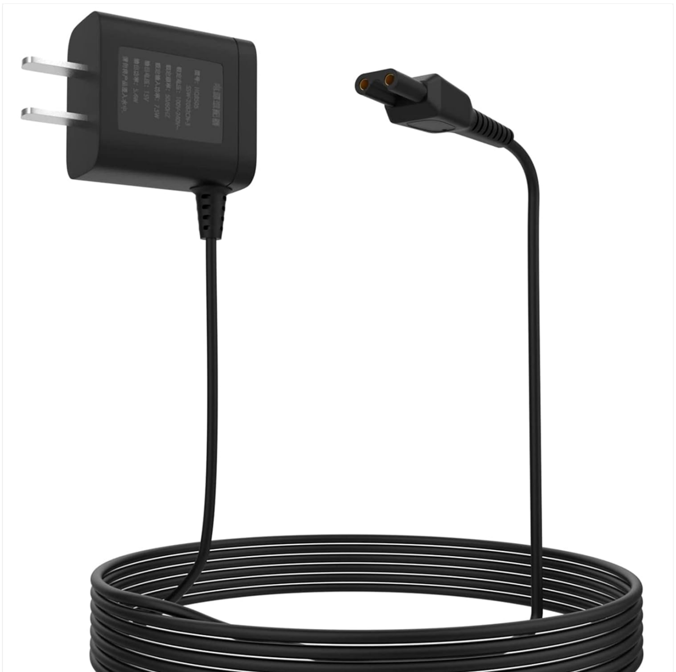
Figure 1: The Saipomor HQ8505 Shaver Charger Cable, showing the two-prong plug and the shaver connector.