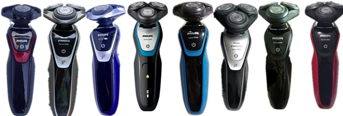
Figure 7: Visual representation of charger specifications and various compatible Philips Norelco shaver models.