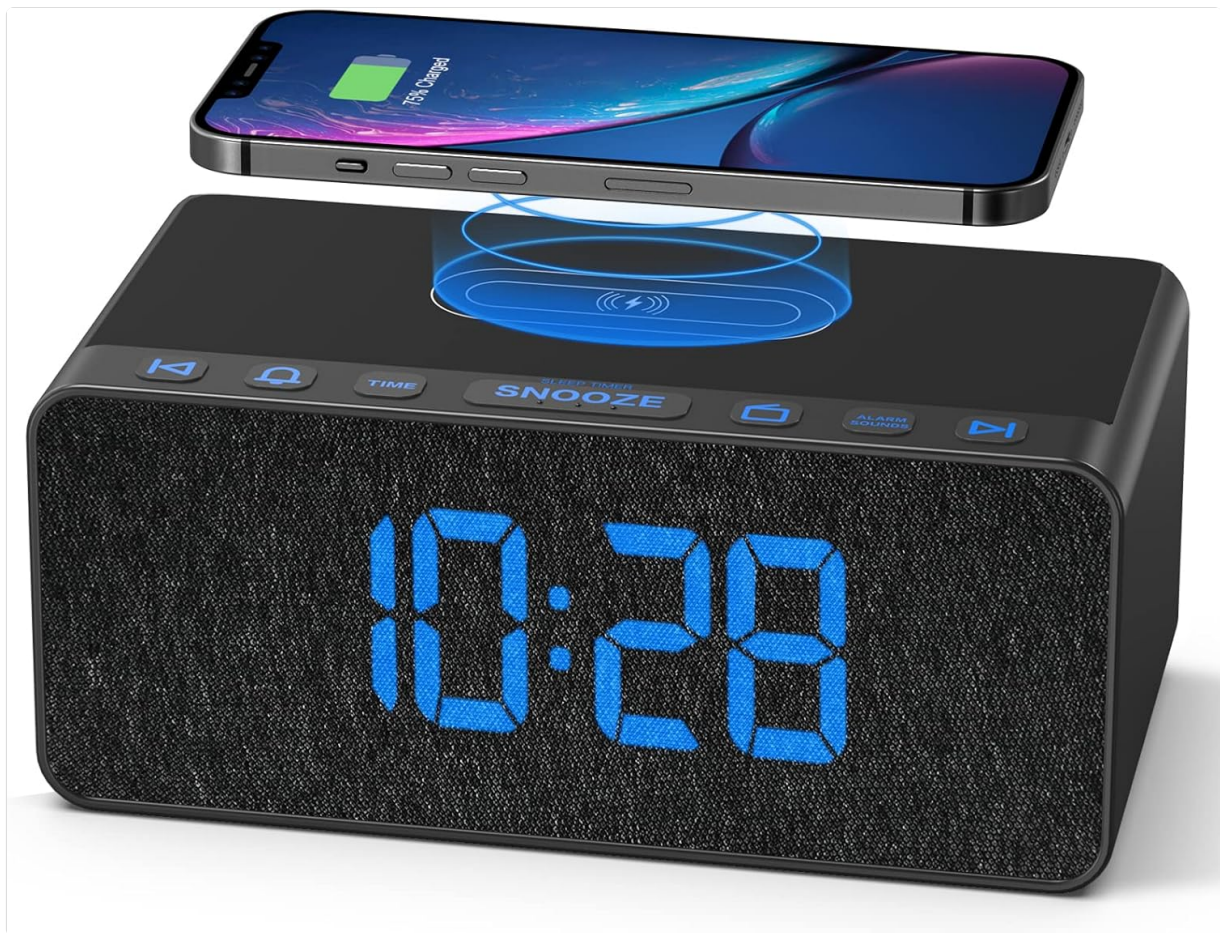
Figure 1.1: BUFFBEE Digital Alarm Clock with a smartphone wirelessly charging on top.