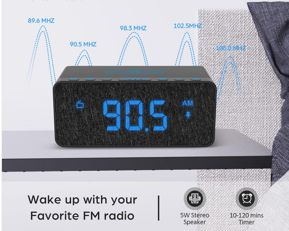
Figure 3.4: FM Radio display.