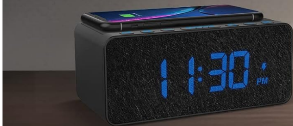
Figure 3.2: Wireless charging compatibility.