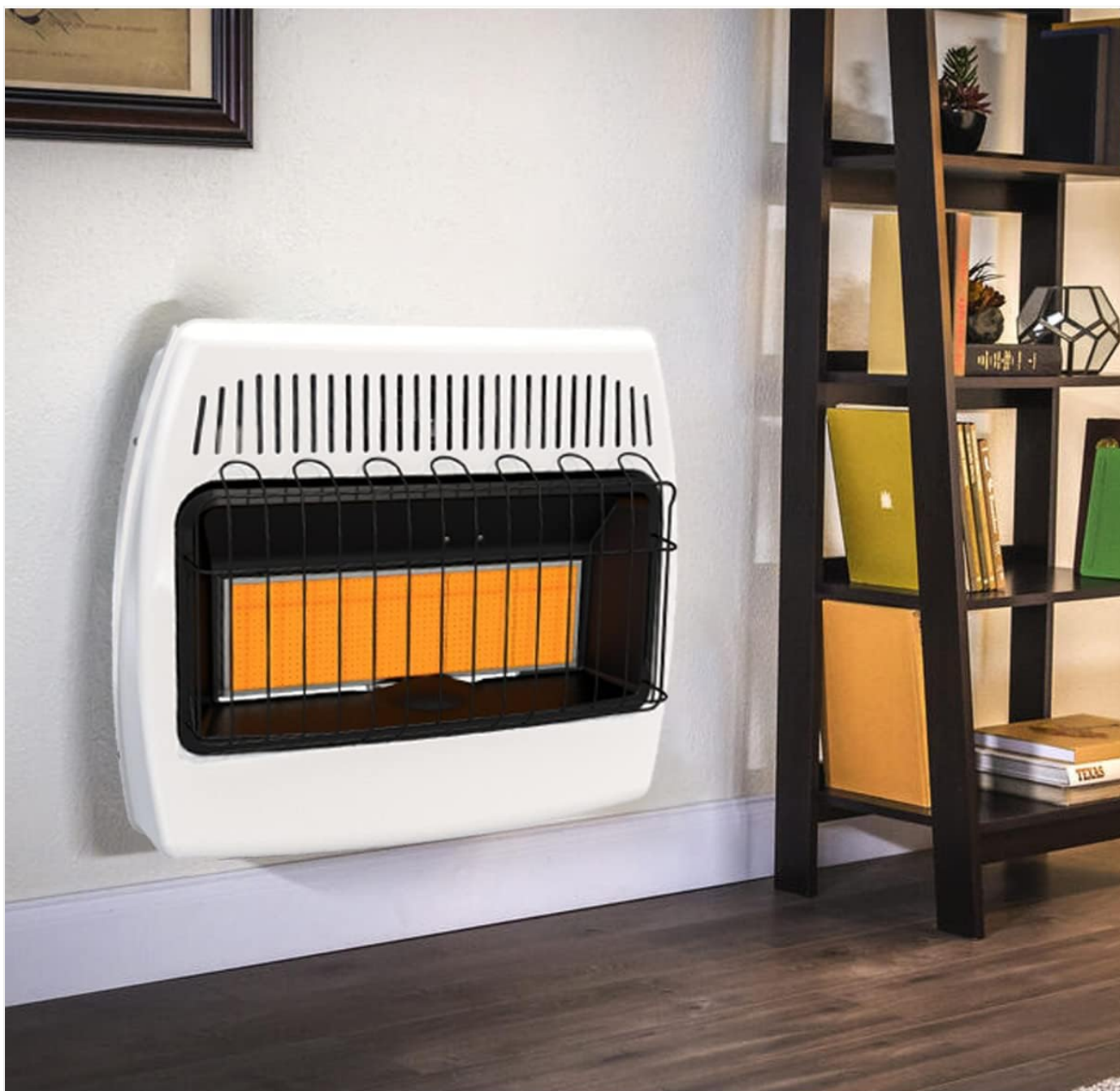
Figure 4: Example of the heater wall-mounted in an indoor living space.