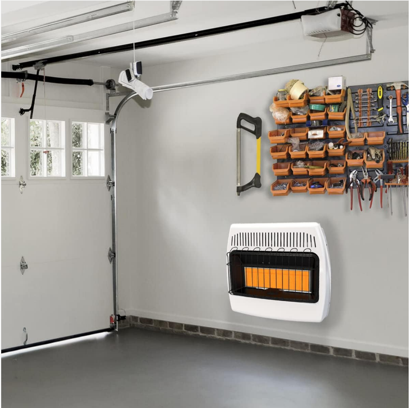
Figure 3: Example of the heater wall-mounted in a garage setting.