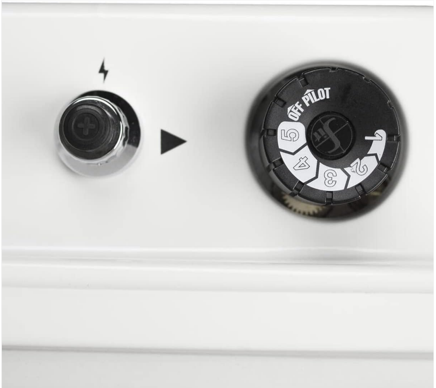
Figure 5: Control knob and igniter button for operating the heater.

Before operating, ensure all installation steps are complete and gas connections are leak-free.