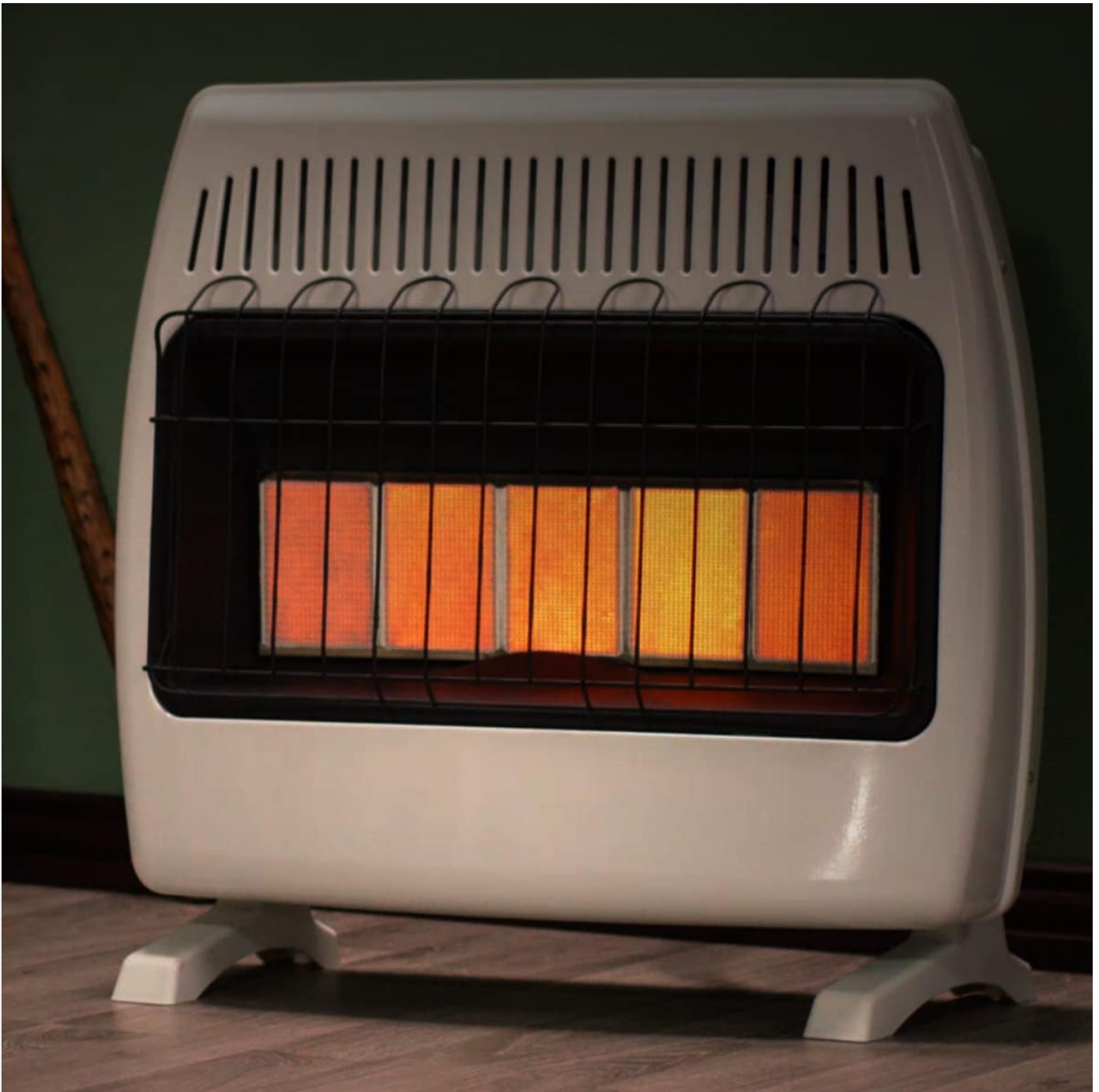
Figure 2: Close-up view of the radiant heating panels, which glow orange during operation to provide heat.