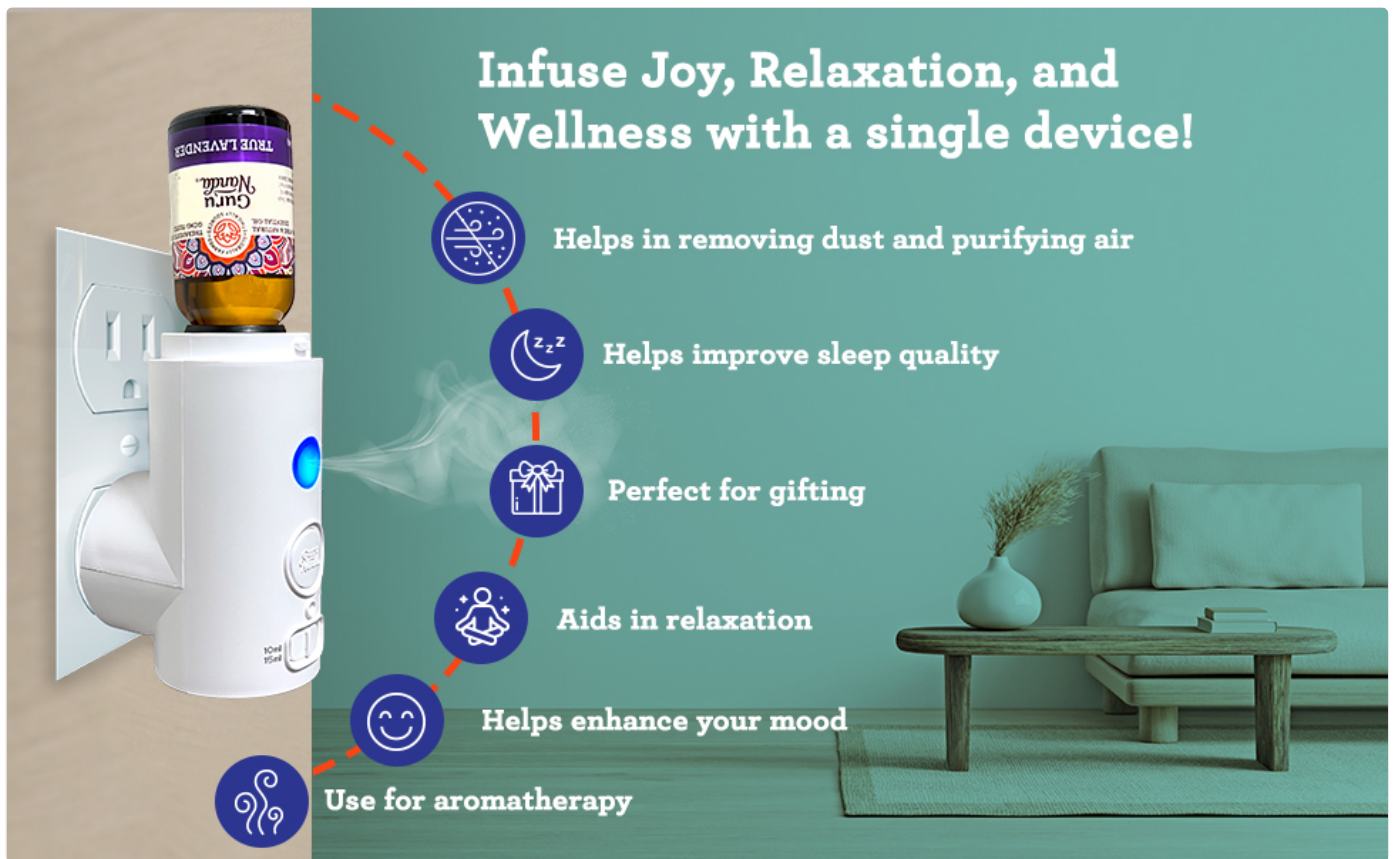
Image: The diffuser in operation, highlighting its cordless design and features like mist modes and auto shut-off.