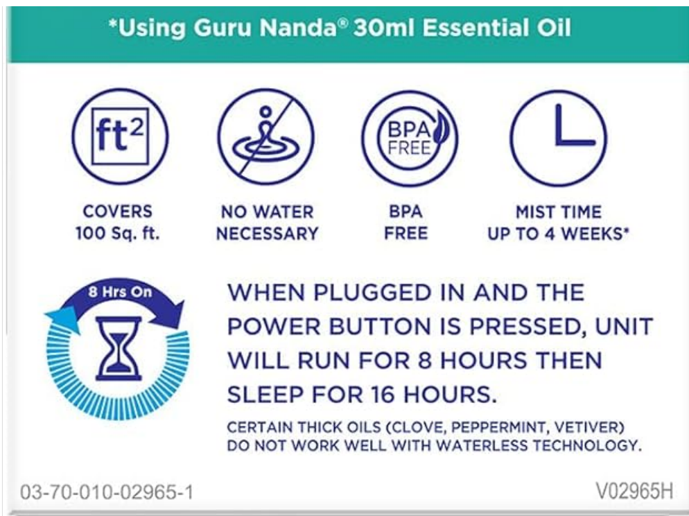
Image: Contents and features of the GuruNanda Portable Diffuser 2.0.