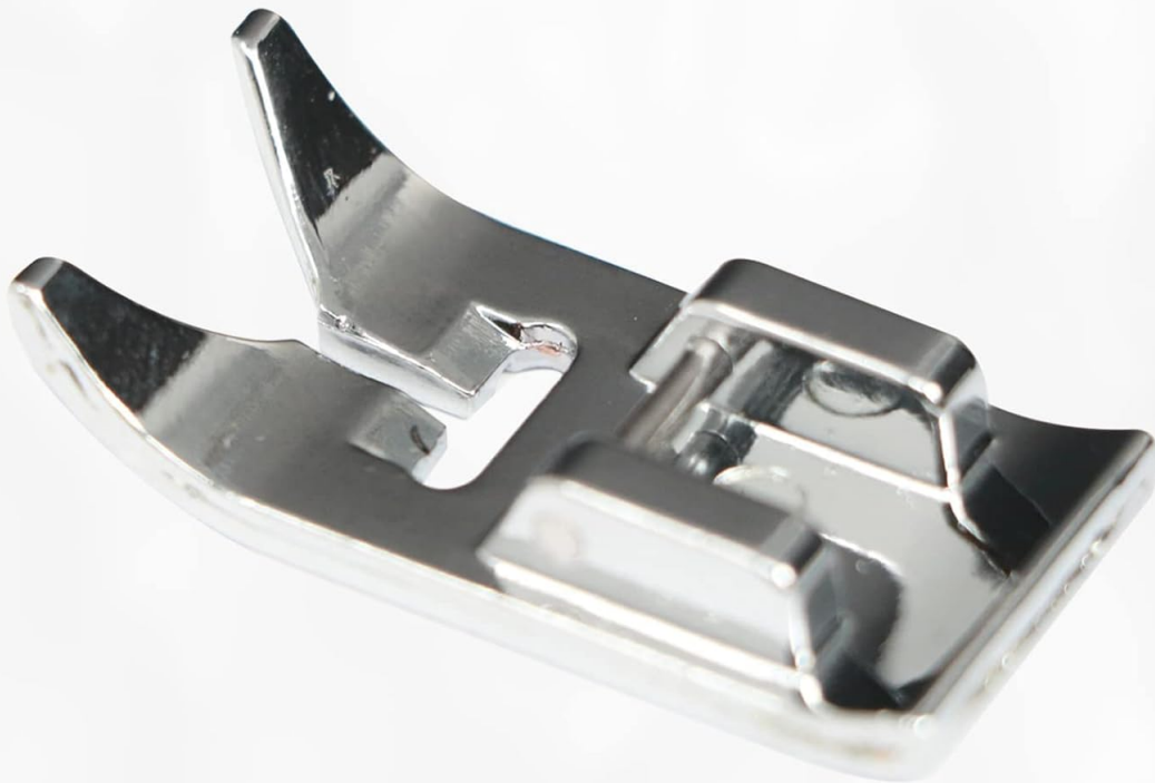
Image 1.2: UpStart Components Snap-On Zig Zag Presser Foot, illustrating the product with its brand identification.