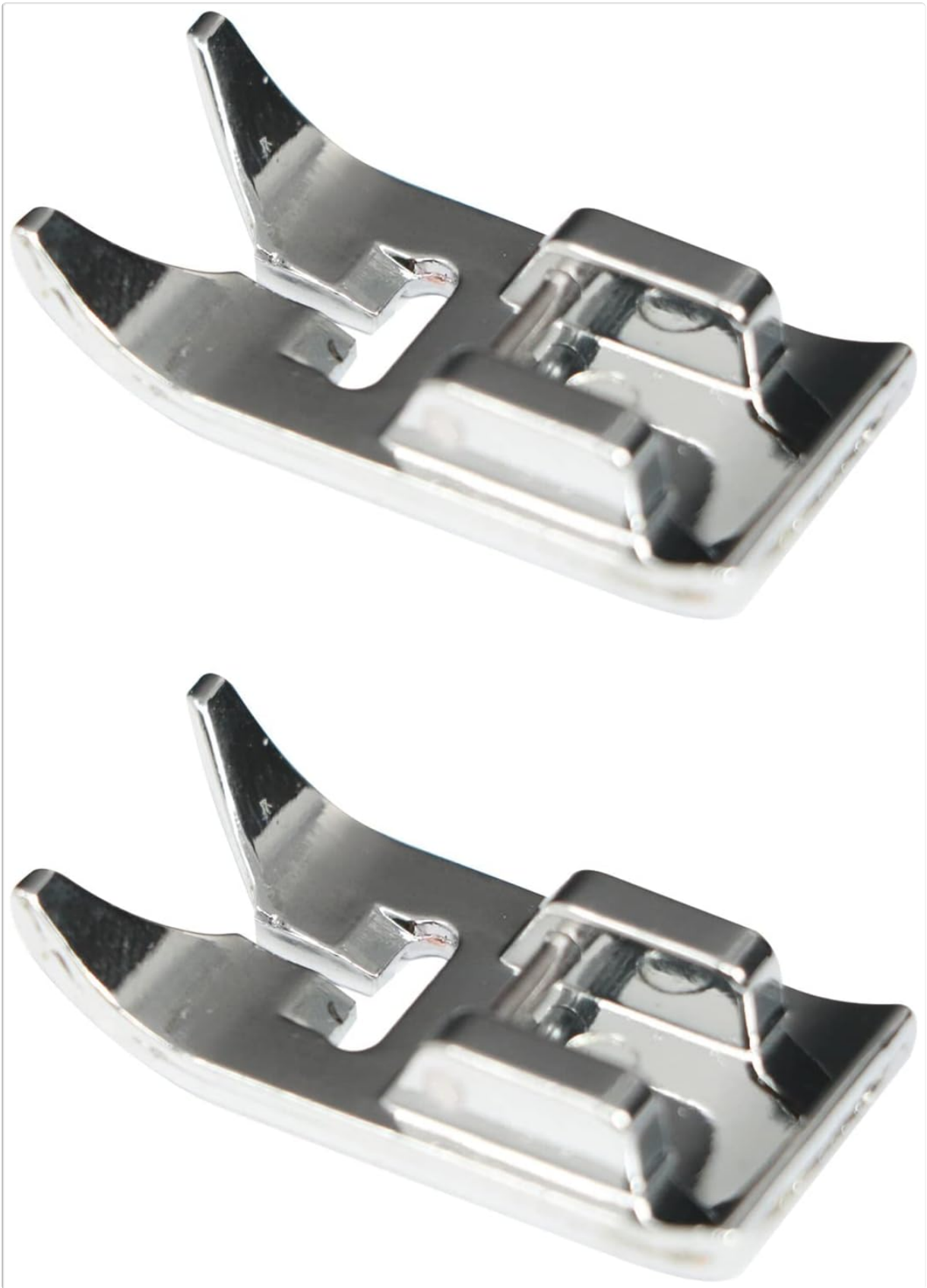
Image 1.1: Two UpStart Components Snap-On Zig Zag Presser Feet. These are chrome-plated metal components, designed for easy attachment to compatible sewing machines.