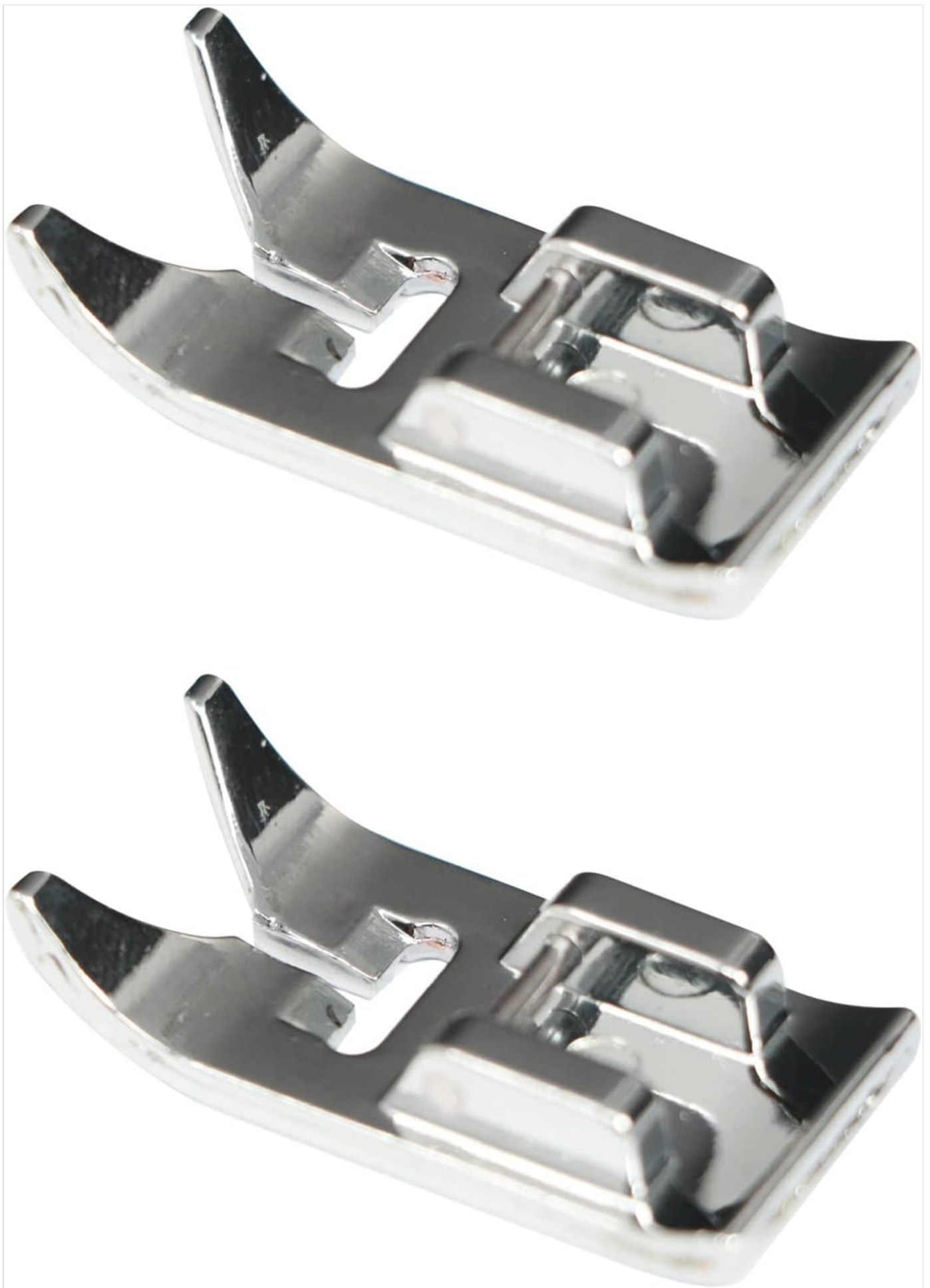
Figure 2.1: Two UpStart Components Snap-On Zig Zag Presser Feet. These are the primary components included in the package, ready for installation on a compatible sewing machine.