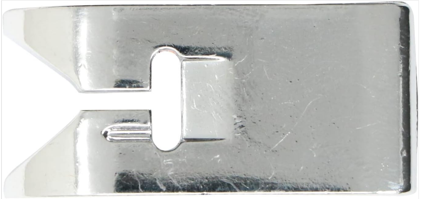
Figure 5.1: Bottom view of the Snap-On Zig Zag Presser Foot. This view shows the smooth underside designed to glide over fabric and the wide opening for needle movement.