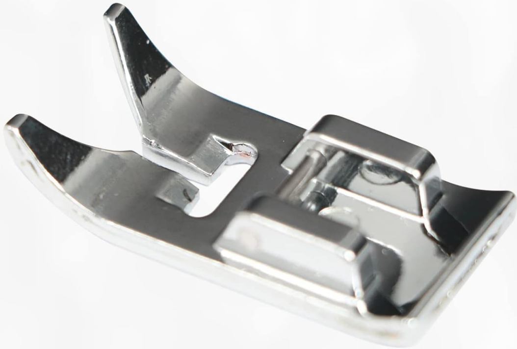
Image 4.1: Top view of the UpStart Components Snap-On Zig Zag Presser Foot. This image shows the upper surface of the presser foot, highlighting the snap-on mechanism at the rear and the needle opening towards the front.