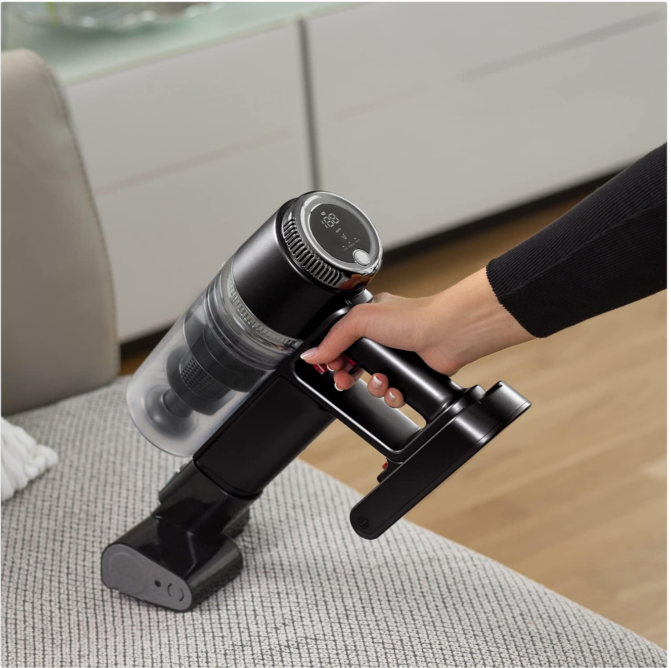
Image 4.3: The Hisense HVC6264BK in handheld mode, effectively cleaning upholstery, demonstrating its versatility for different surfaces.