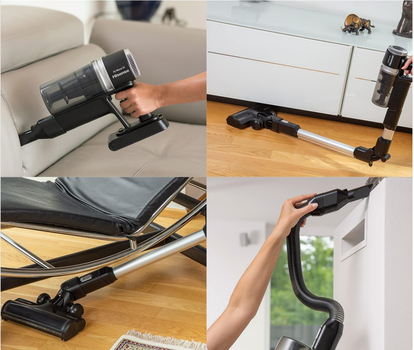
Image 2.2: Demonstrates the 2-in-1 functionality of the vacuum, showing its use as a full-size stick vacuum and as a compact handheld unit for cleaning various surfaces like upholstery and tight spaces.