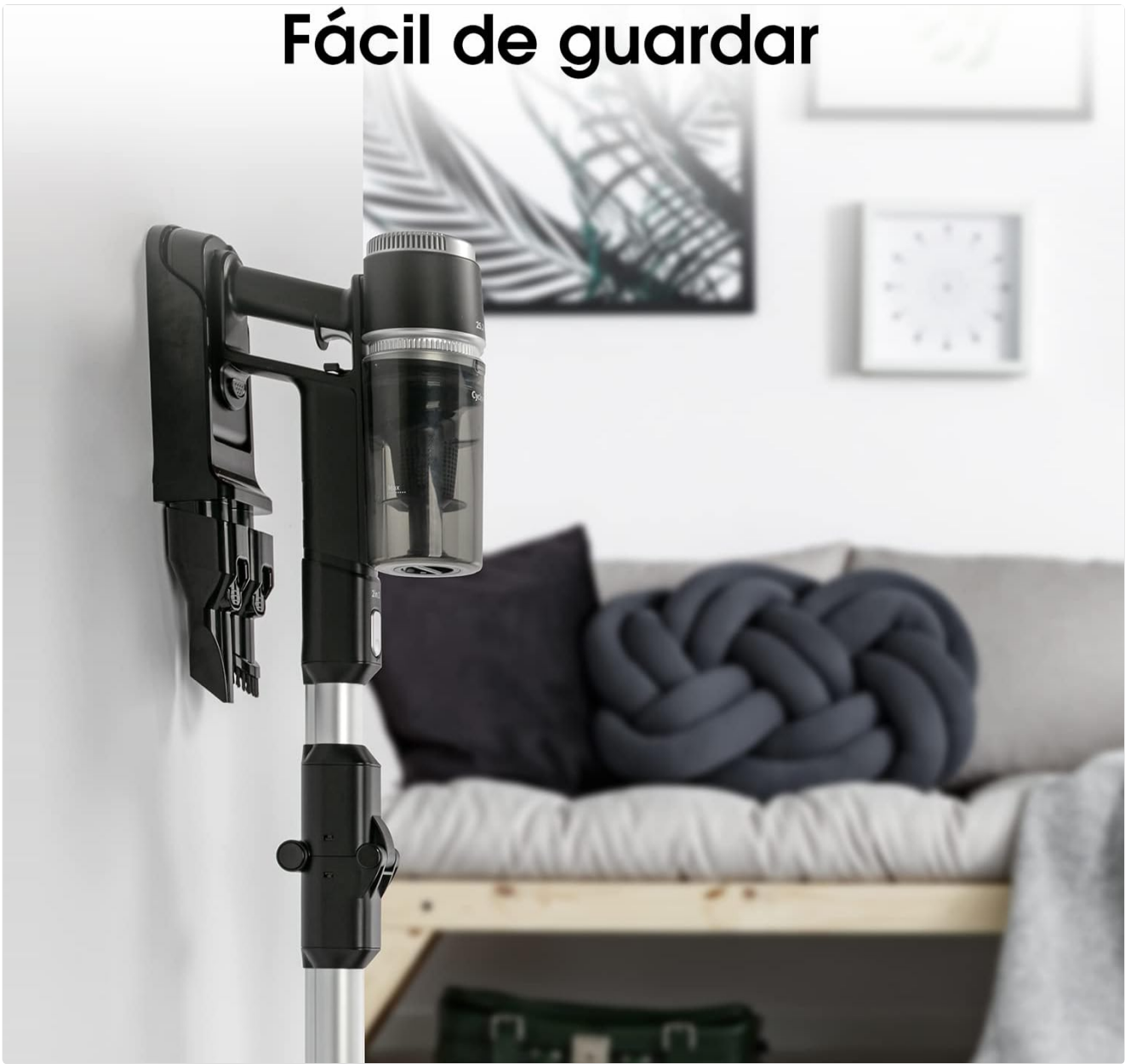
Image 3.2: The Hisense HVC6264BK vacuum cleaner conveniently stored and charging on its wall-mounted dock, demonstrating its space-saving design.