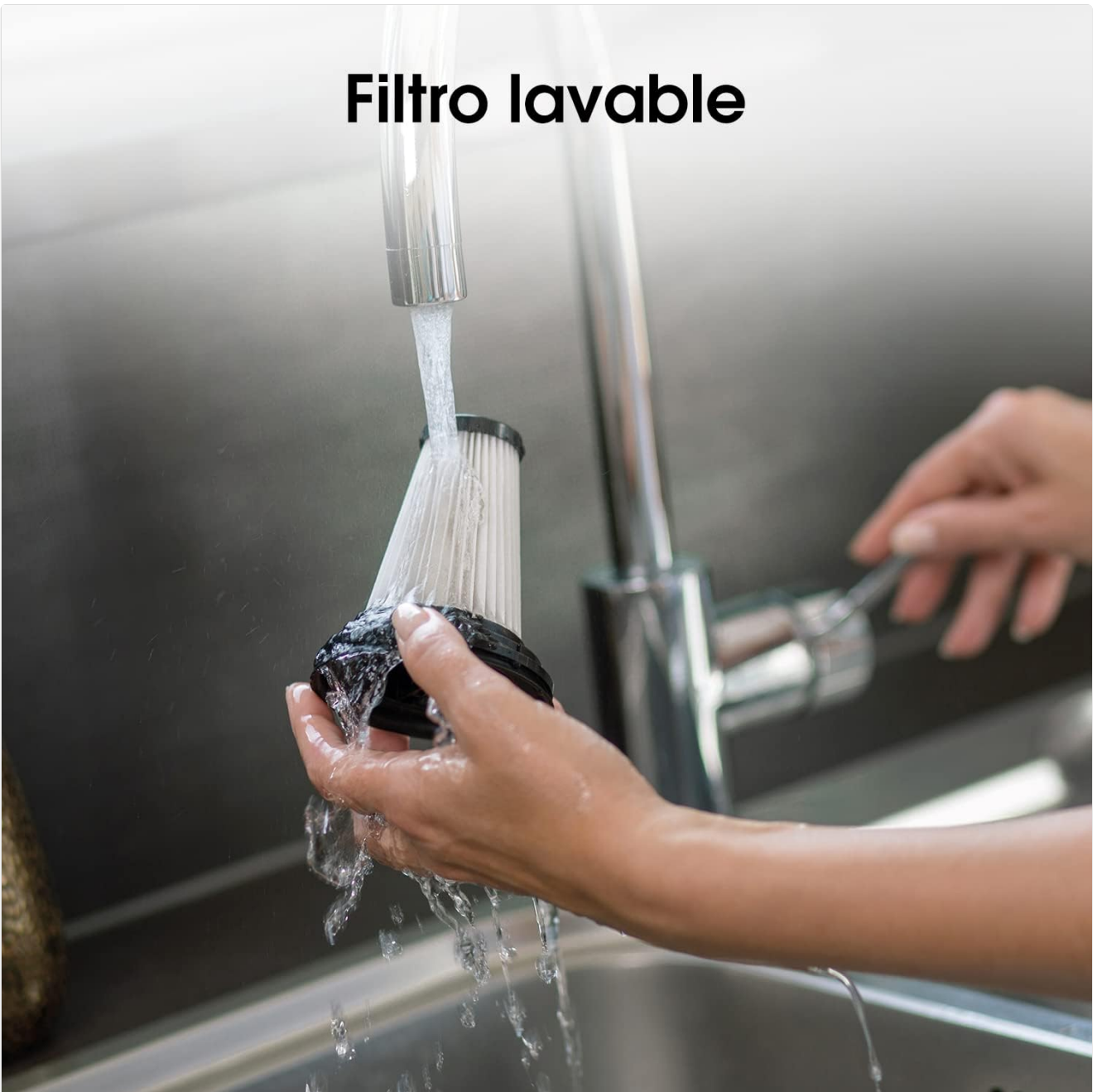
Image 5.2: A user washing the filter of the Hisense HVC6264BK under running water, illustrating the easy maintenance of the washable filter.