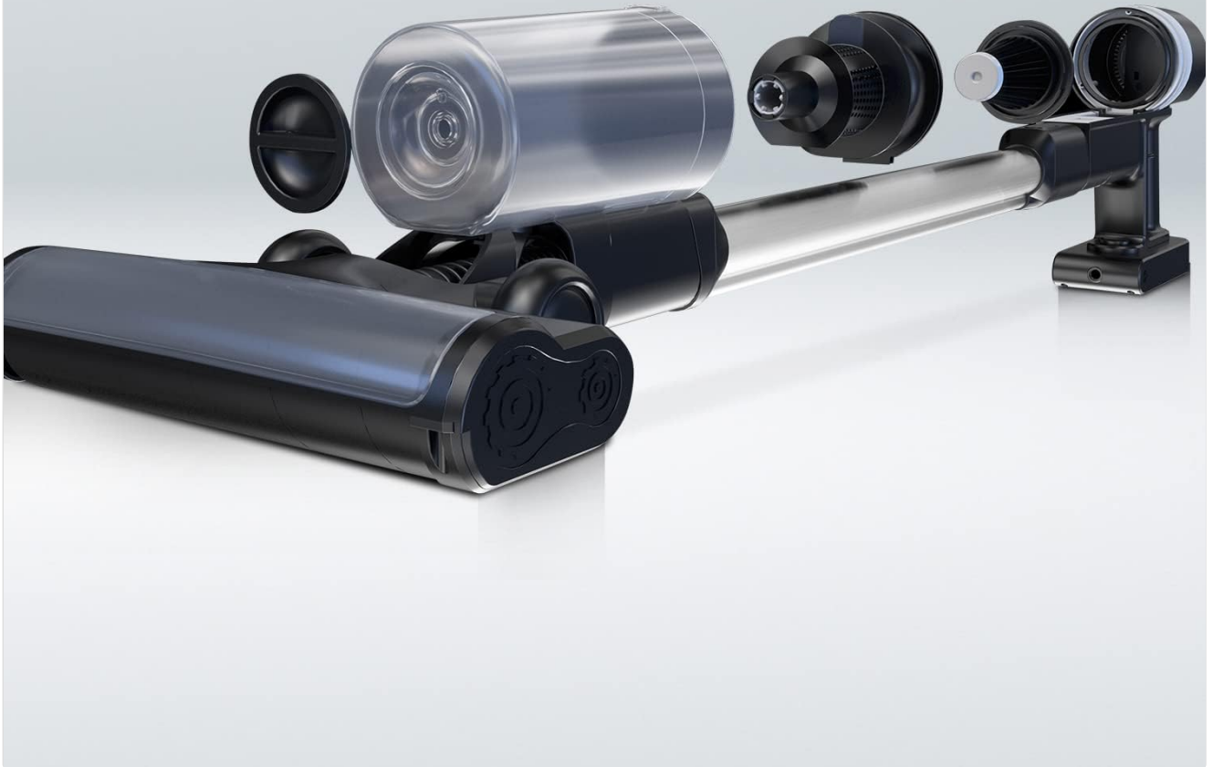
Image 3.1: An exploded view illustrating the main components of the Hisense HVC6264BK vacuum cleaner, including the handheld unit, dustbin, filters, extension wand, and motorized brush.