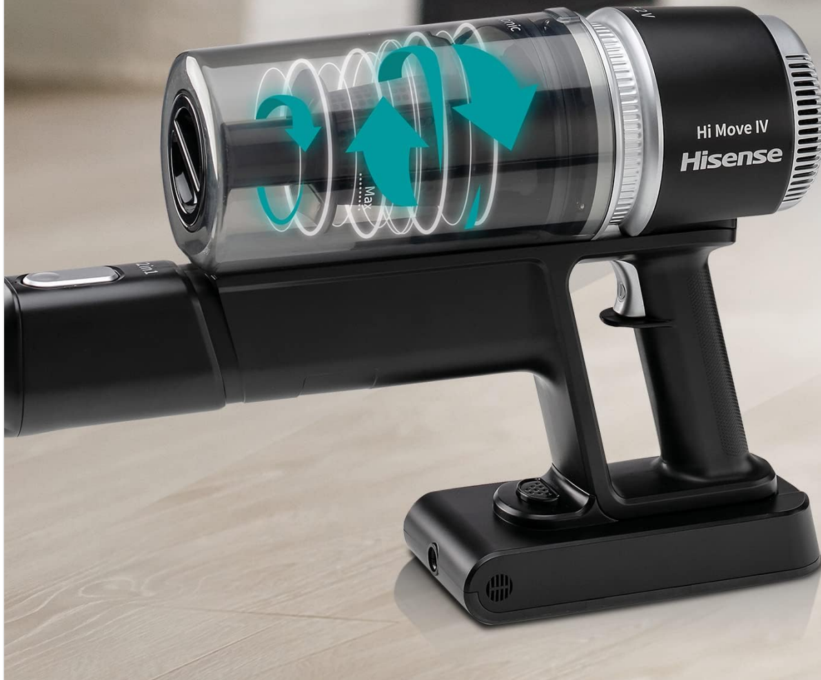
Image 5.1: A visual representation of the high-power cyclonic action within the dustbin of the Hisense HVC6264BK, demonstrating how dust and debris are separated from the airflow.