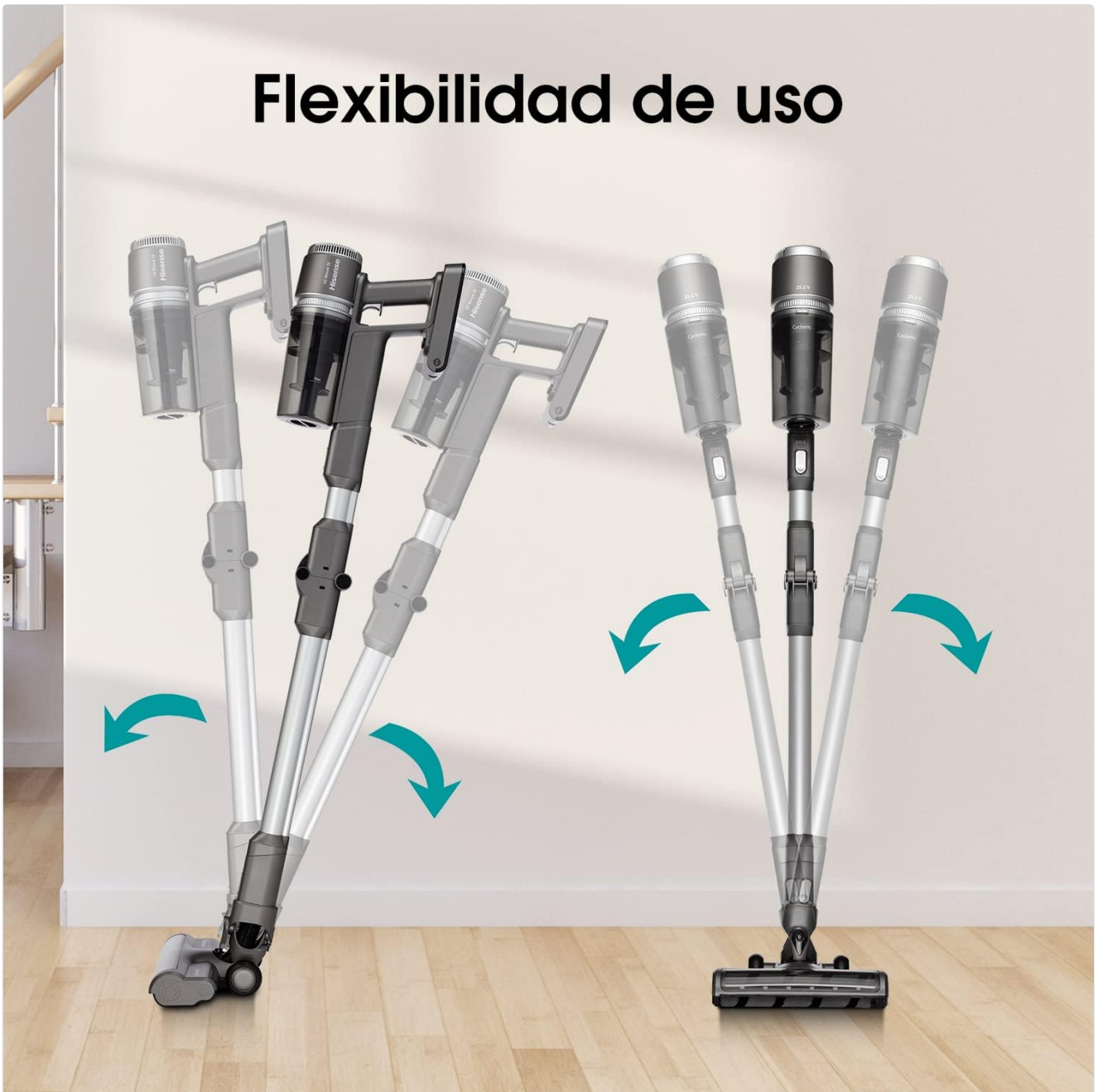
Image 4.4: Illustrates the flexible usage positions of the Hisense HVC6264BK, showing how it can be angled and folded for cleaning under furniture and in hard-to-reach areas.