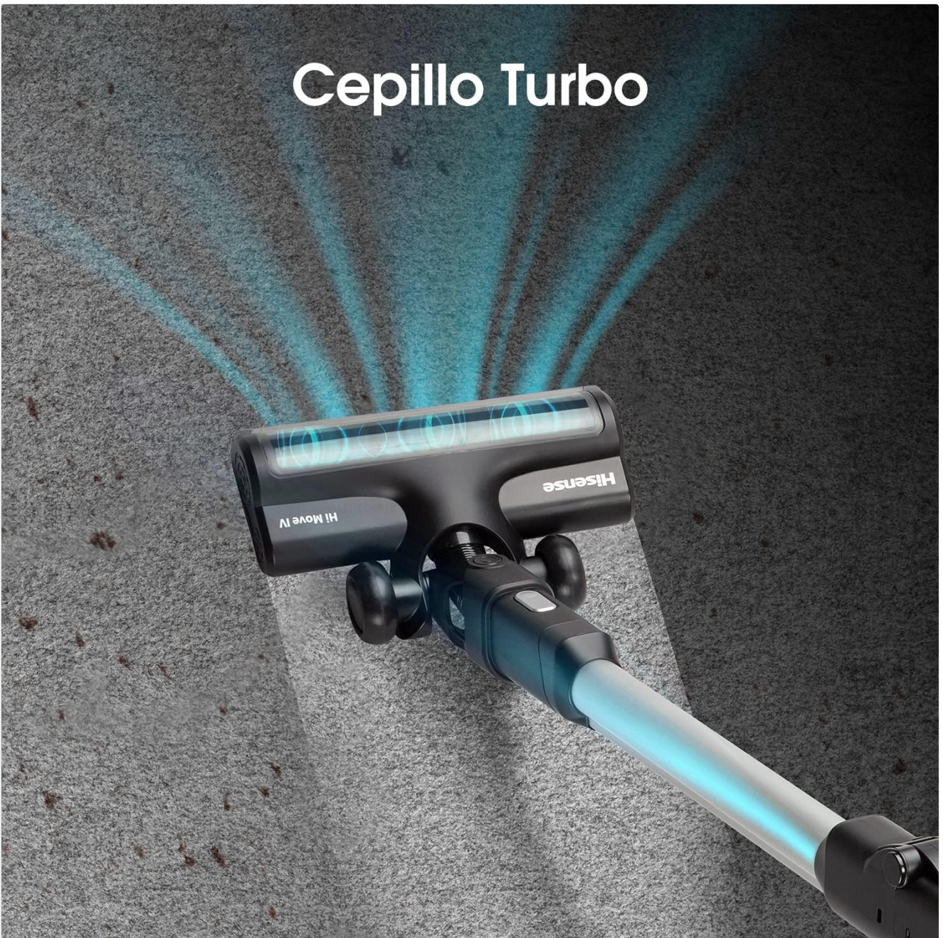
Image 4.1: Close-up of the motorized turbo brush of the Hisense HVC6264BK, showing the integrated LED lights that enhance visibility during cleaning.