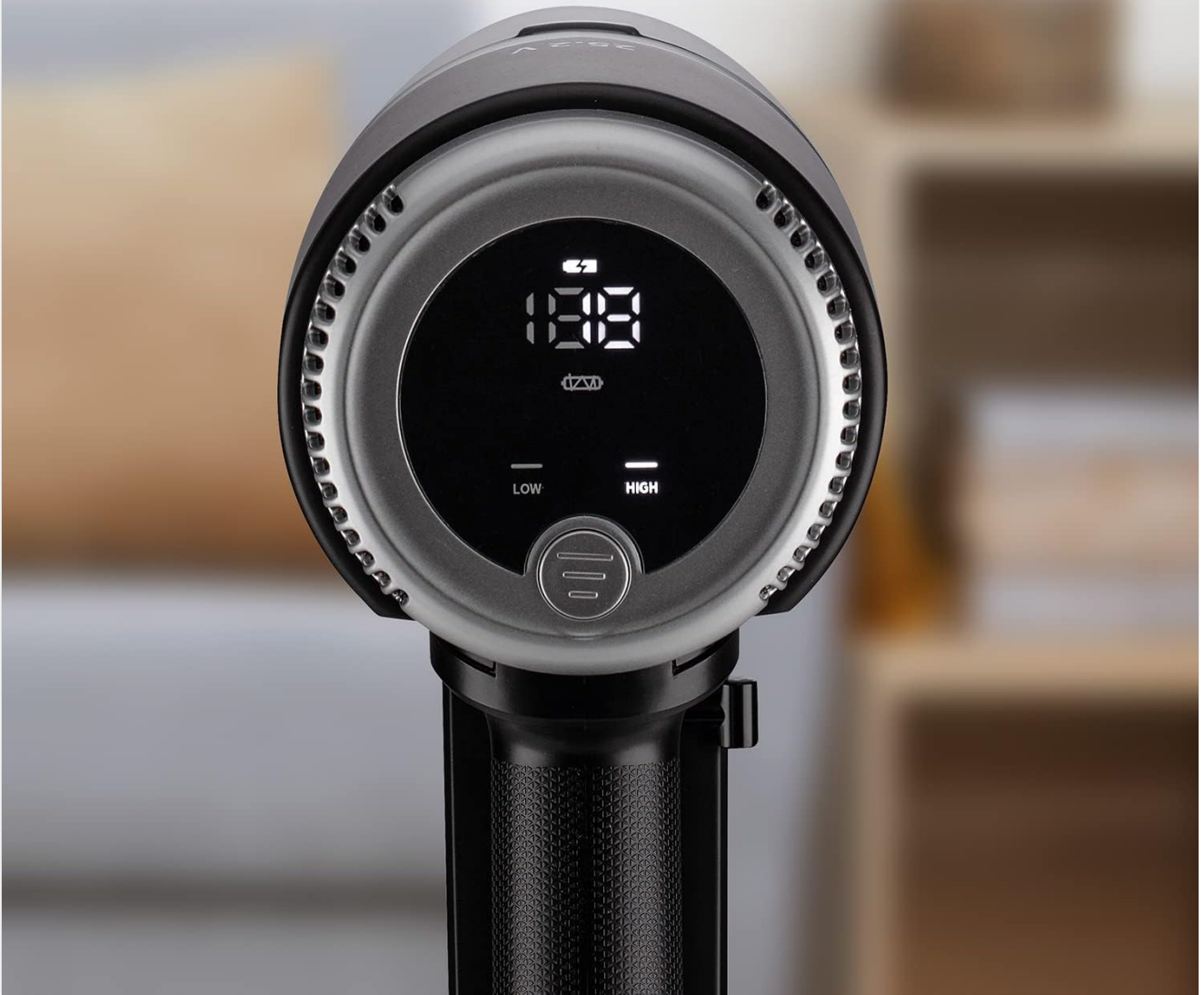
Image 4.2: A detailed view of the Hisense HVC6264BK's LED display, showing battery charge level and current power setting (Low/High).