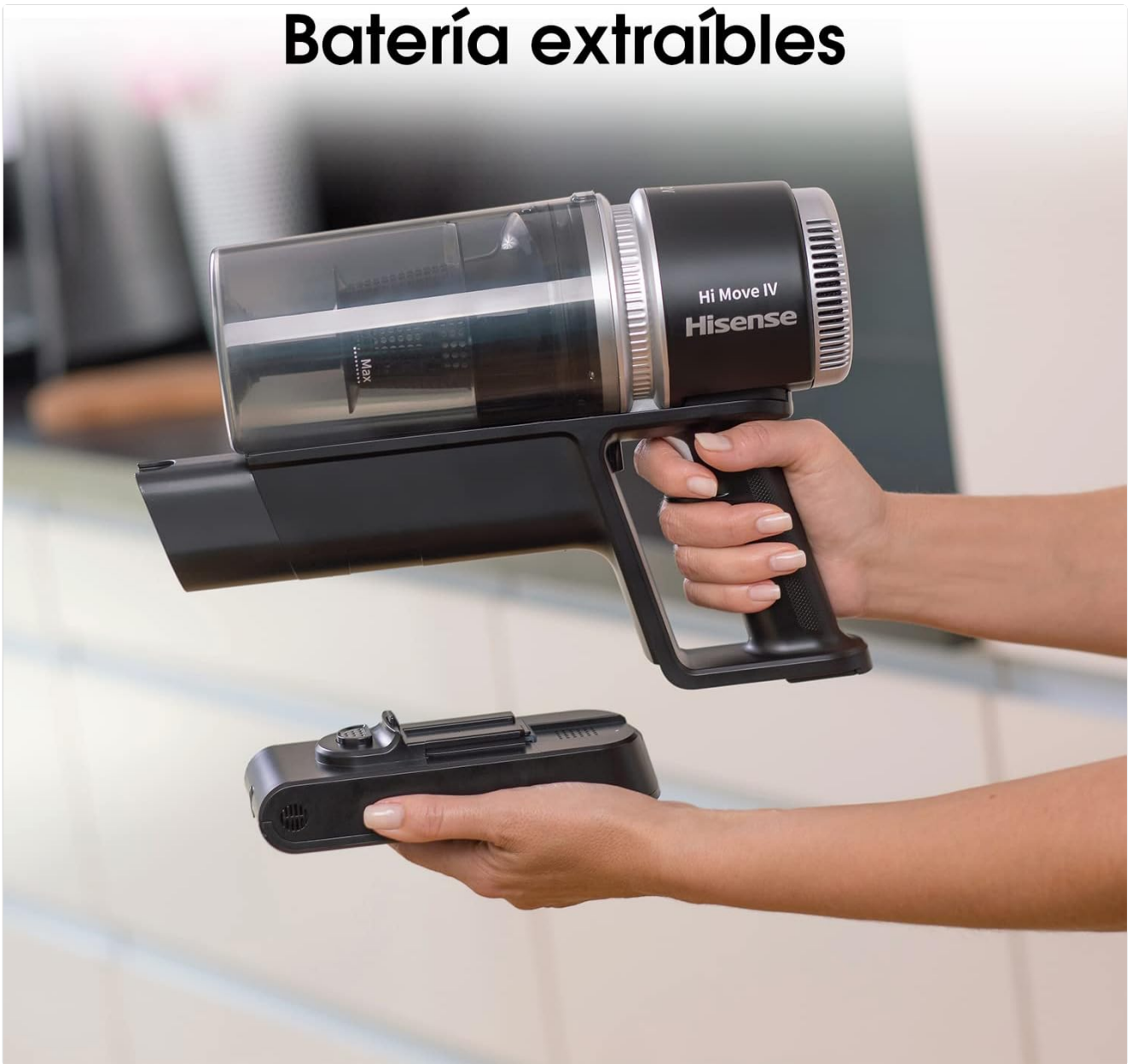
Image 3.3: The removable battery feature of the Hisense HVC6264BK, allowing for flexible charging options and potential battery replacement.