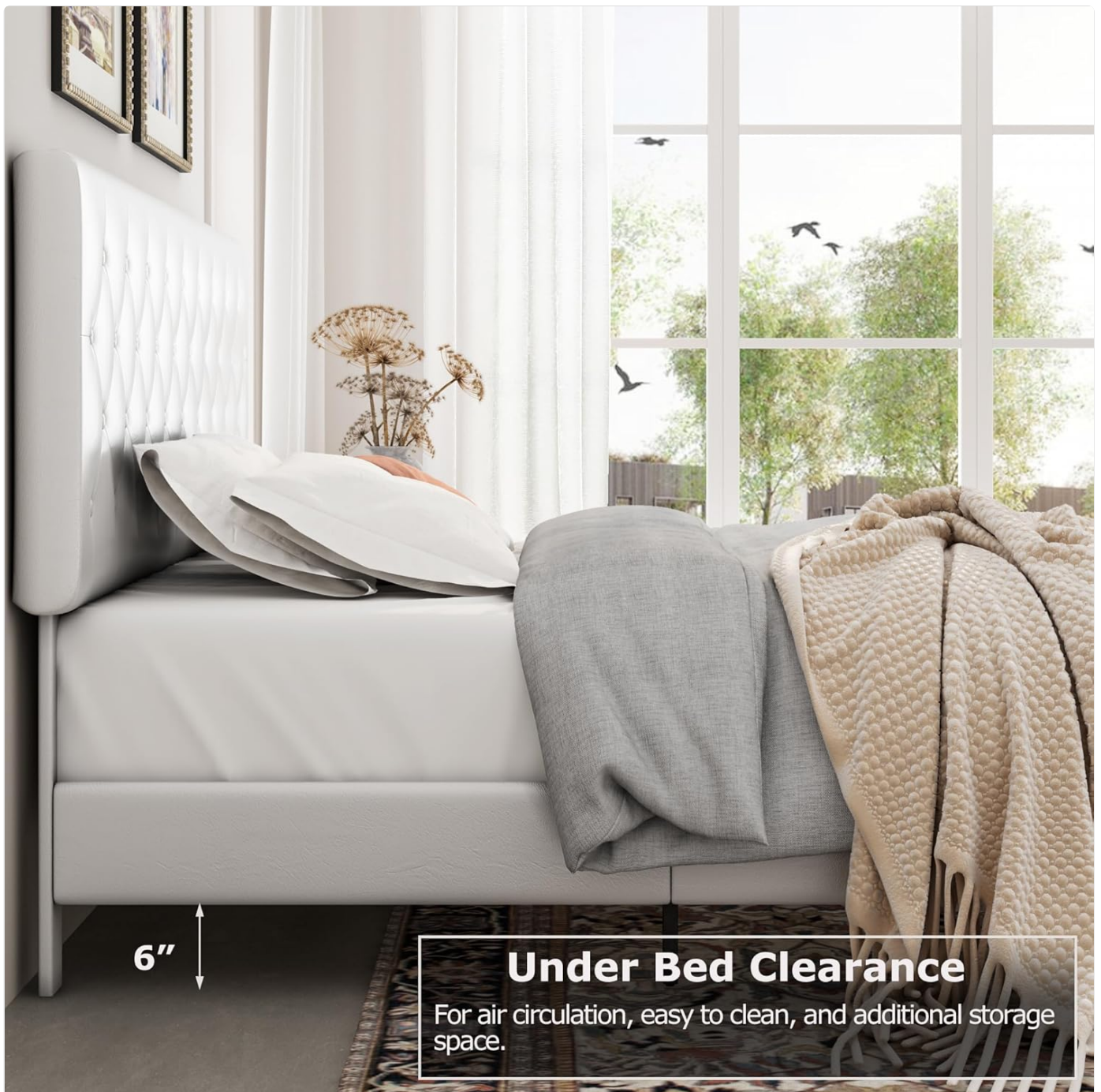
Image: The bed frame offers a 6-inch under-bed clearance, providing space for air circulation, easy cleaning, and additional storage.