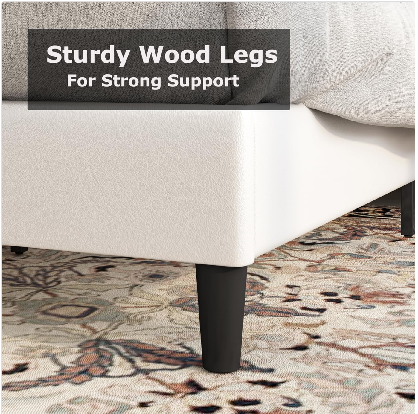
Image: A close-up view of the sturdy black wooden legs that provide strong support and stability to the bed frame.