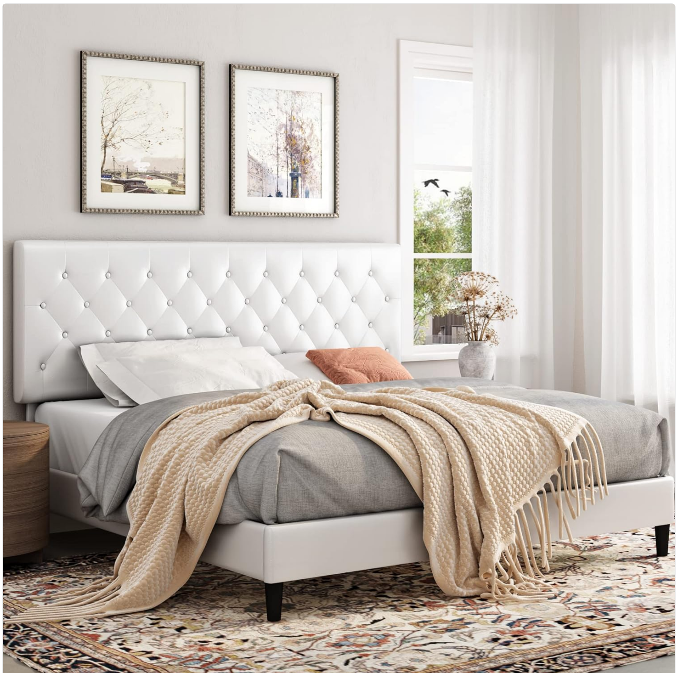
Image: The Keyluv Upholstered Platform Bed Frame, Queen Size in White, featuring a button-tufted headboard and faux leather finish, set in a bedroom environment.