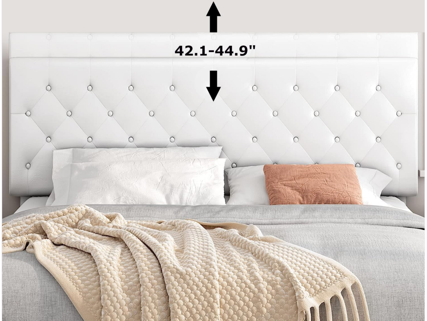
Image: Illustration showing the height adjustability of the headboard, which can be set between 42.1 and 44.9 inches to accommodate different mattress heights.

Accommodate different mattress thicknesses.