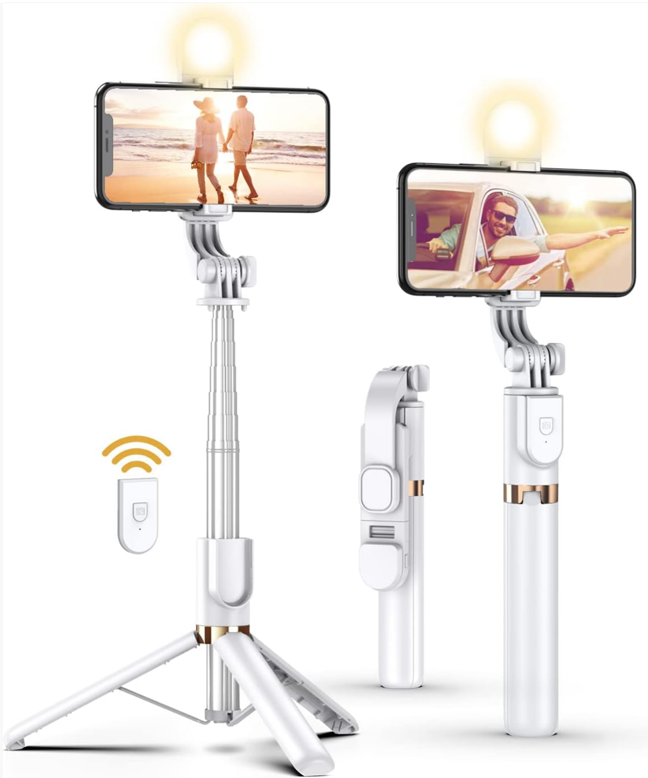
The Yeaki Selfie Stick Tripod, showcasing its compact, extended, and tripod modes, along with the wireless remote.