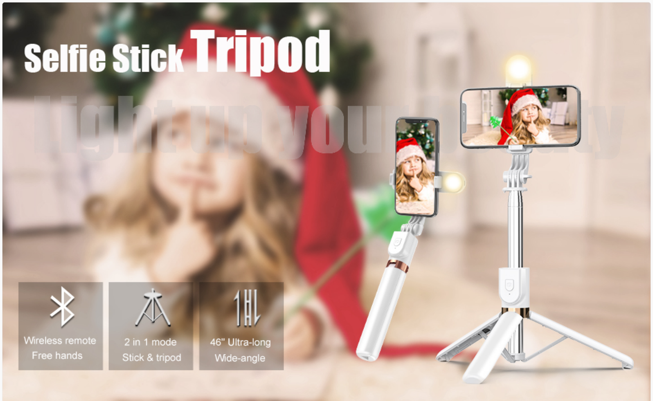
Key features of the Yeaki Selfie Stick Tripod.