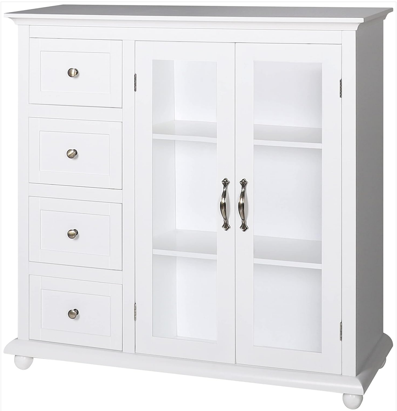
Image 1.1: The VEIKOUS Sideboard Cabinet, a versatile storage unit with drawers and glass doors.