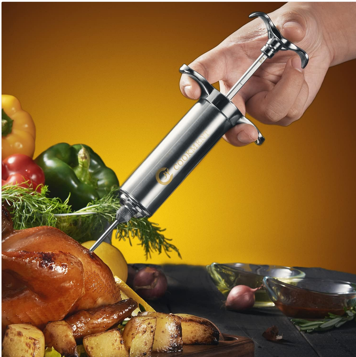
Image: A hand demonstrating the use of the JY COOKMENT meat injector to infuse marinade into a roasted turkey, illustrating the practical application of the tool.

4. Post-Injection: After injecting, you may gently massage the meat to further distribute the marinade.