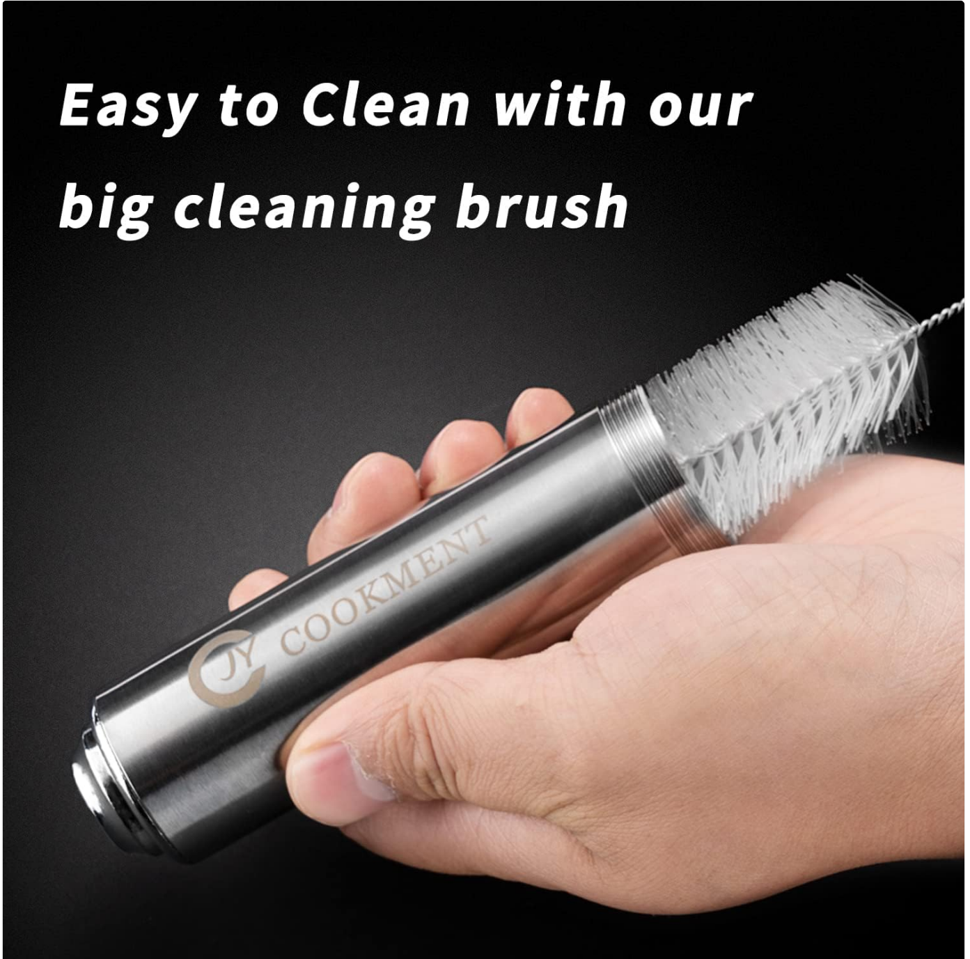
Image: A hand demonstrating the use of the large cleaning brush to clean the interior of the JY COOKMENT meat injector barrel, highlighting the ease of maintenance.

Easy to Clean with our big cleaning brush