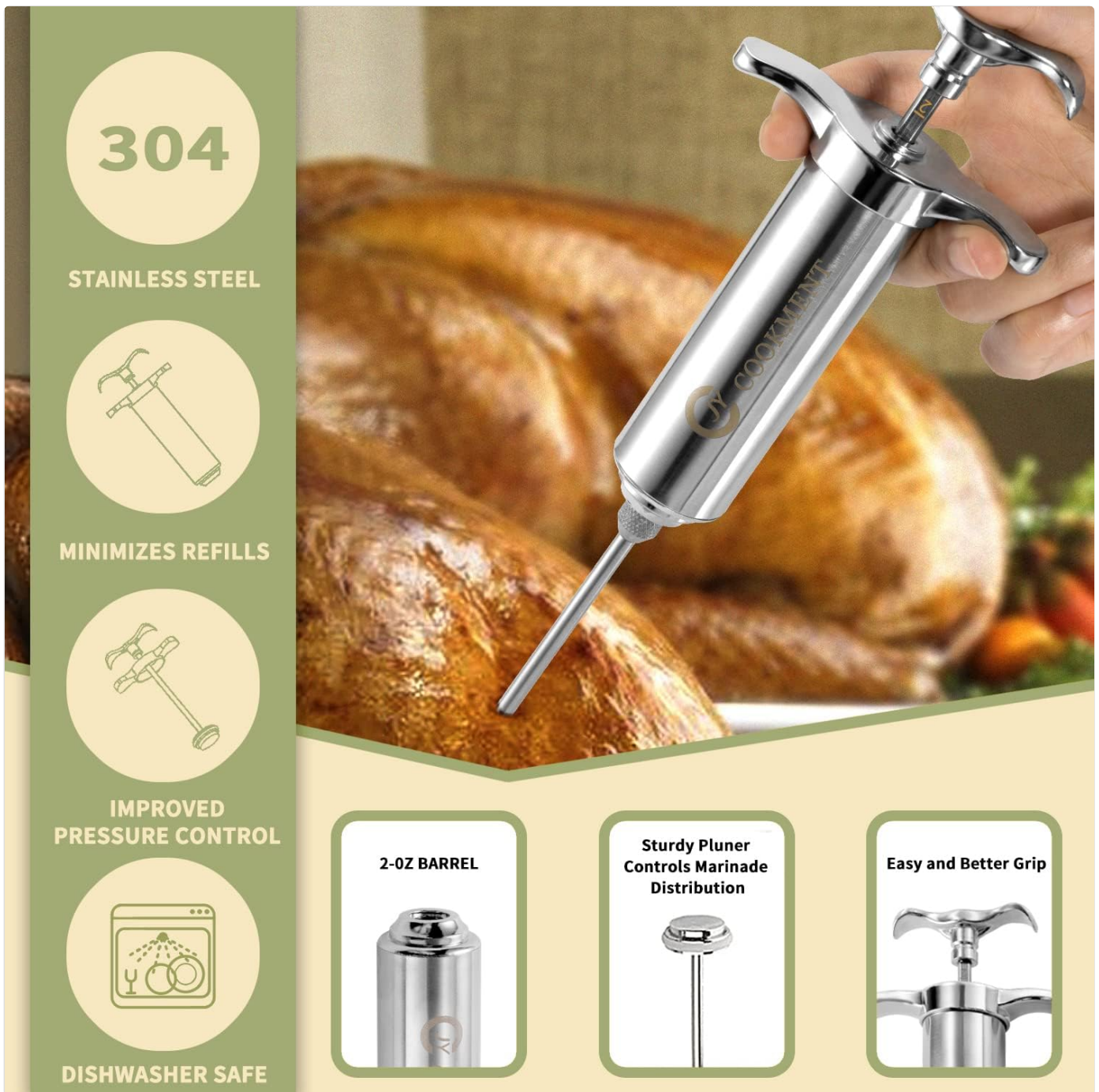
Image: Another infographic showcasing additional features including 304 stainless steel material, improved pressure control, the 2-oz barrel capacity, a sturdy plunger for controlled distribution, an ergonomic grip, and dishwasher-safe convenience.