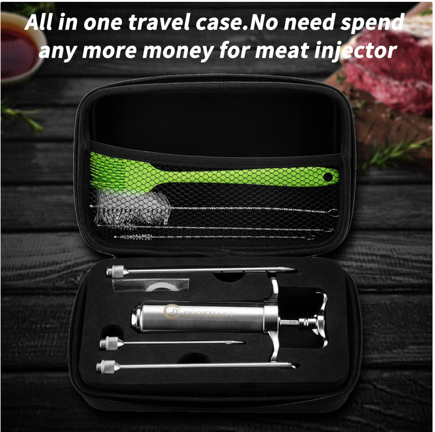
Image: The interior of the travel case, showing the custom-fitted compartments for the injector body, needles, and cleaning accessories, ensuring organized storage and portability.

All in one travel case. No need spend any more money for meat injector