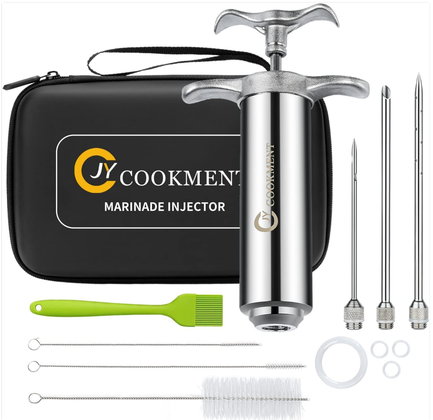
Image: The complete JY COOKMENT Meat Injector Syringe kit, showcasing the main injector body, three different needles, cleaning brushes, silicone basting brush, and the travel case.