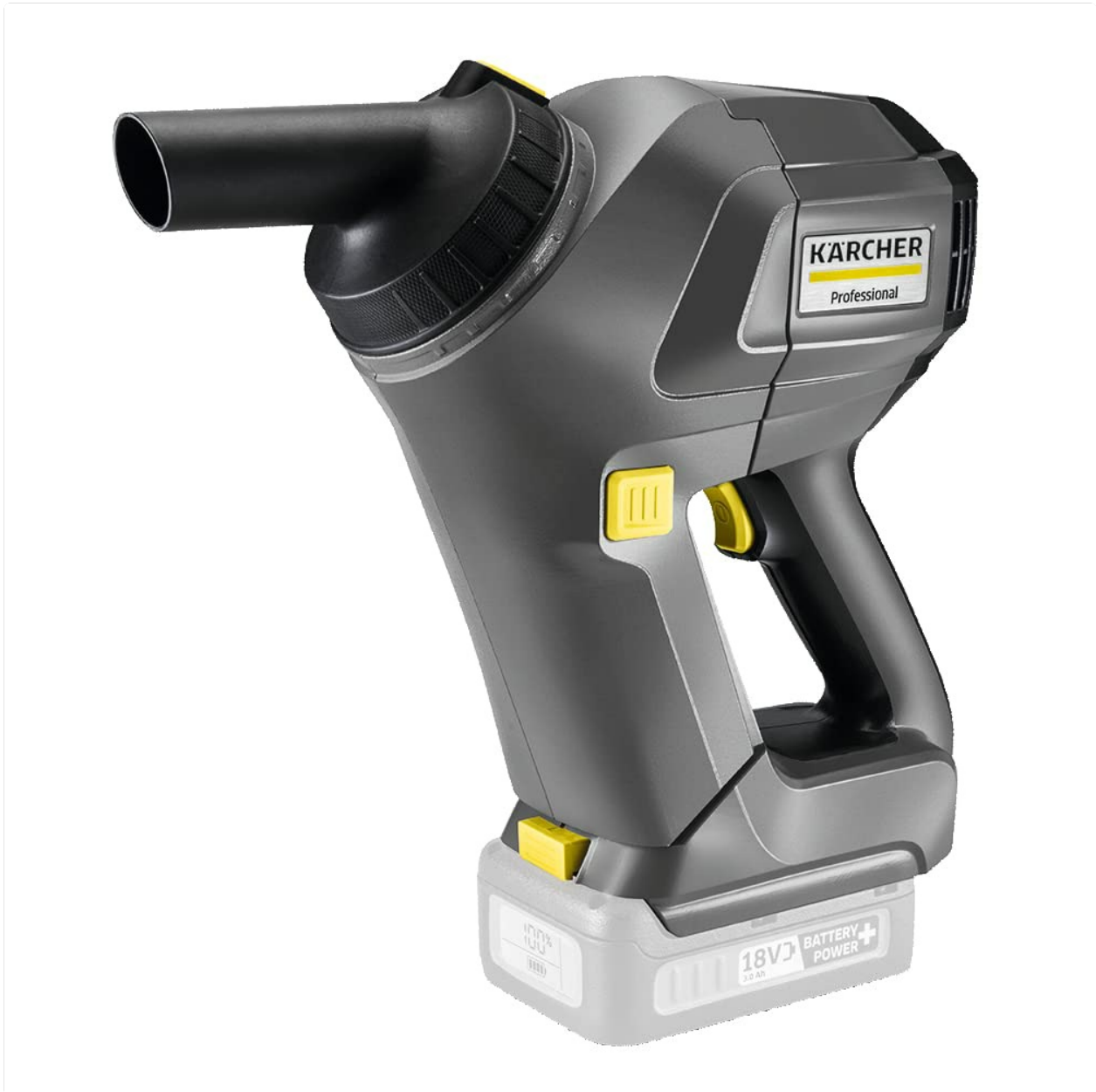
Figure 1: Kärcher HV 1/1 Bp Commercial Handy Vacuum Cleaner (main unit only, battery and charger sold separately).

The Kärcher HV 1/1 Bp is engineered for efficiency and user comfort in commercial cleaning environments.