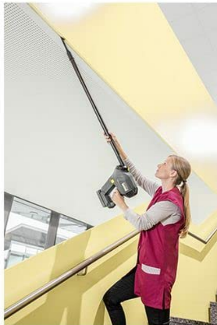
Figure 4: Demonstrating the vacuum cleaner's ability to reach high areas, such as ceilings, due to its lightweight design and versatile application.