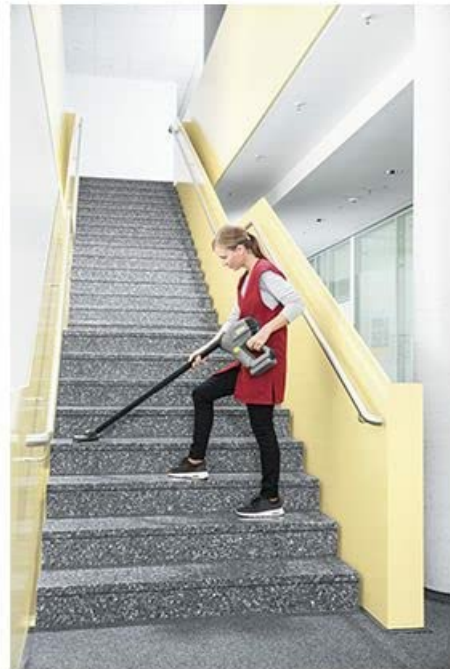
Figure 2: Example of using the vacuum cleaner on stairs, demonstrating its portability and ease of use with an extension.