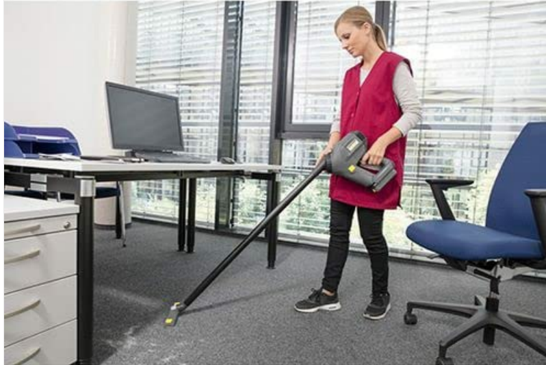
Figure 3: The vacuum cleaner being used to clean office carpet, highlighting its suitability for commercial environments.