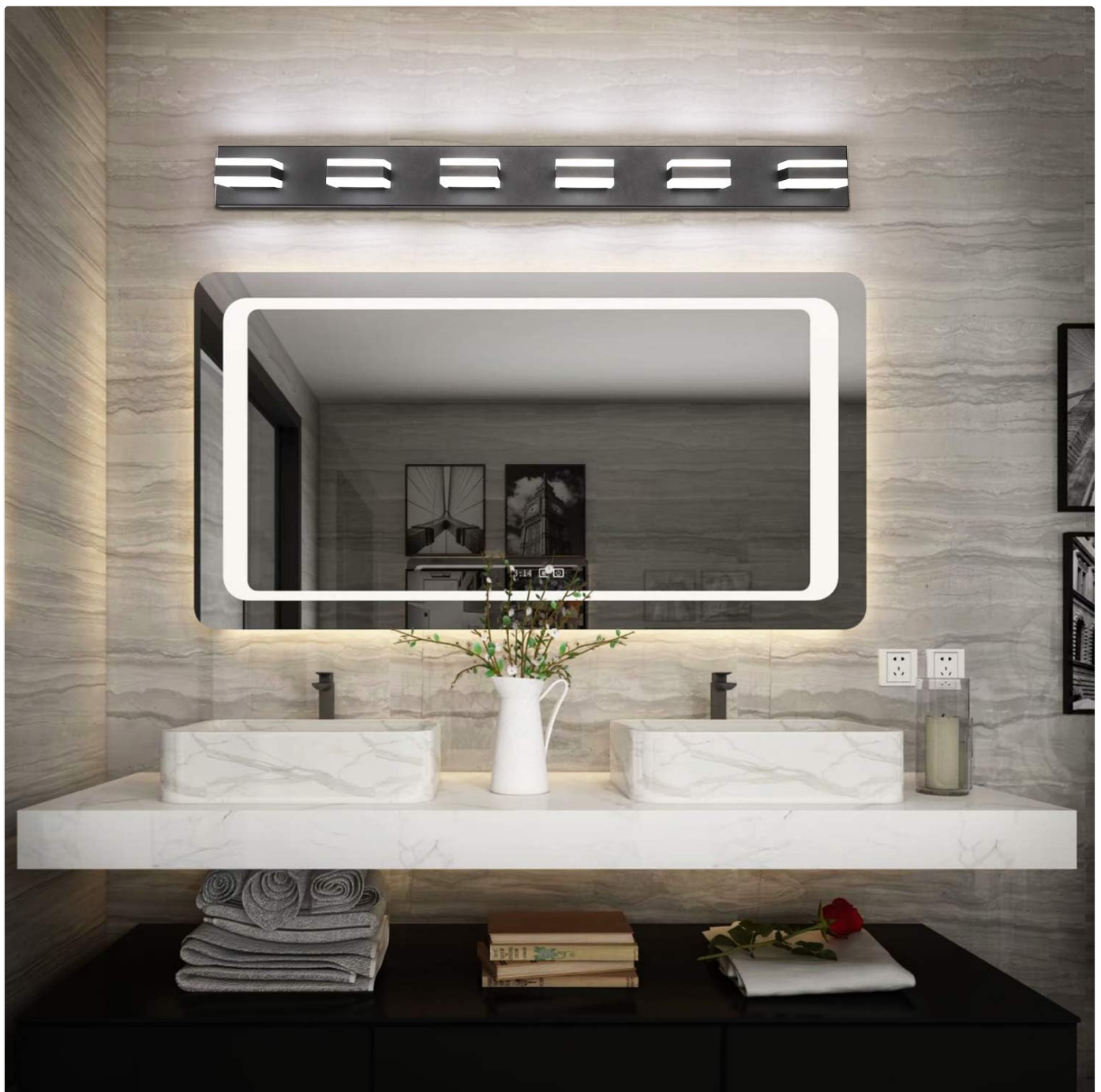
Figure 3: Example of the vanity light installed above a mirror.