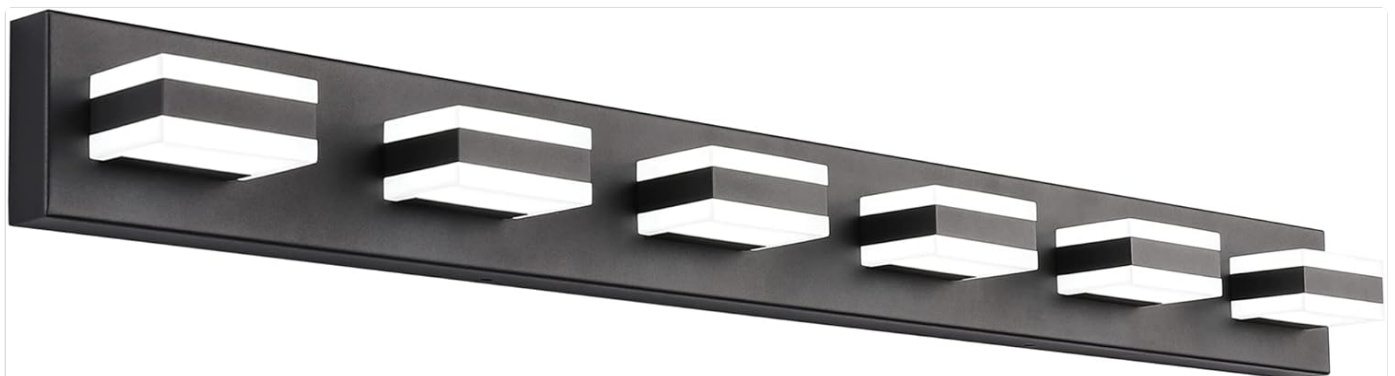
Figure 1: Main components of the SOLFART LED Vanity Light.