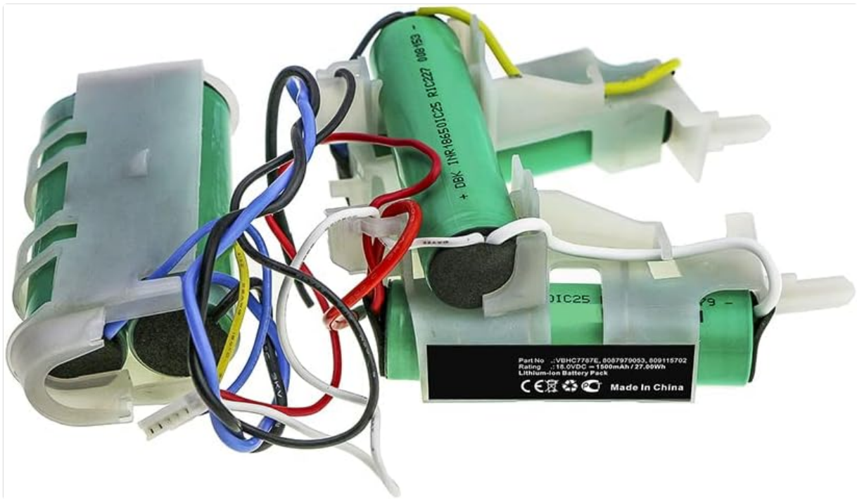
Image 2: Side view of the Synergy Digital replacement battery, showing wiring.