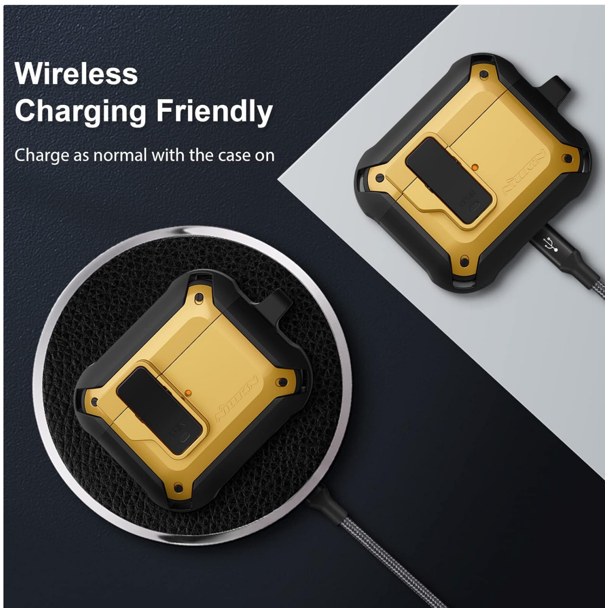
Image: The Nillkin AirPods 3 case placed on a wireless charging pad, demonstrating its wireless charging friendly design.