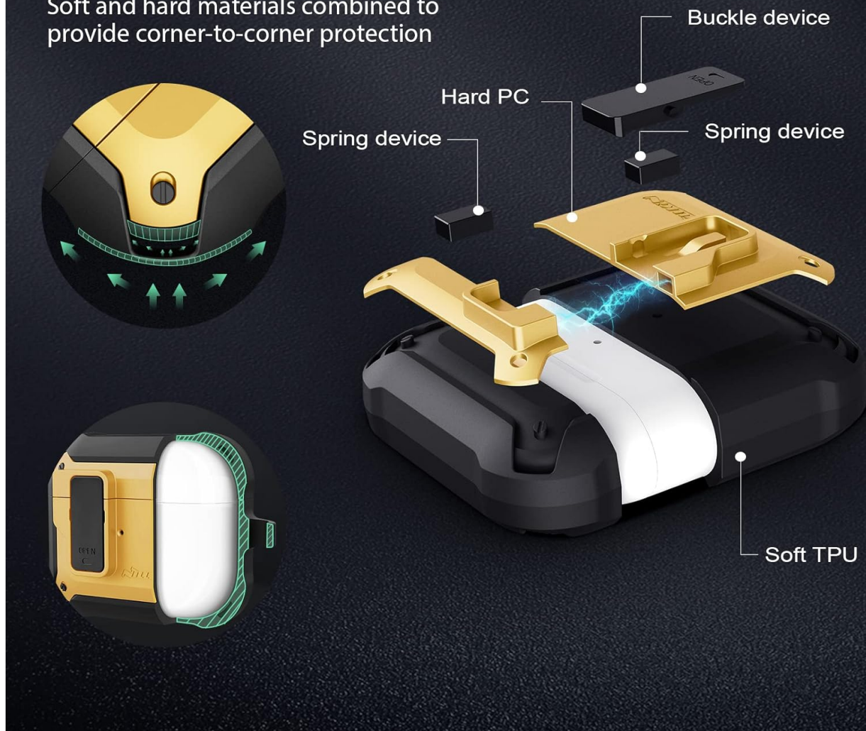
Image: Exploded view of the Nillkin AirPods 3 case, illustrating the separate hard PC and soft TPU components that provide corner-to-corner protection.

Soft and hard materials combined to provide corner-to-corner protection