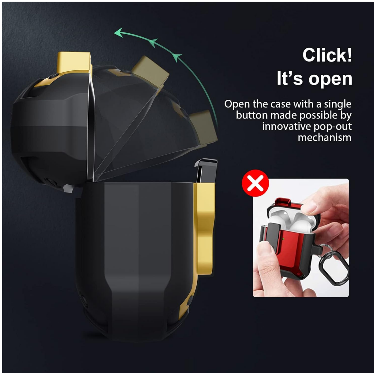
Image: The case lid opening with a distinct 'click', highlighting the innovative pop-out mechanism for quick and simple access.