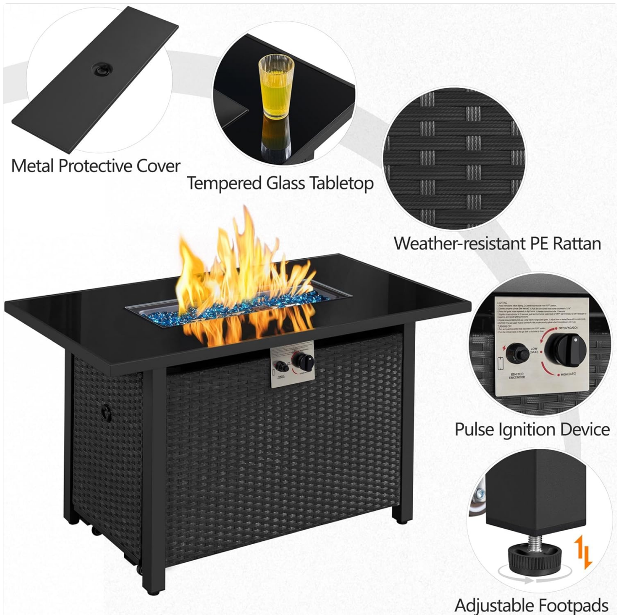
Figure 3.1: Key features and components of the Yaheetech Fire Pit.