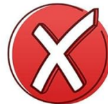
Figure 2.1: Proper propane hose placement. Ensure the hose and valve are away from high-temperature areas to prevent safety hazards.