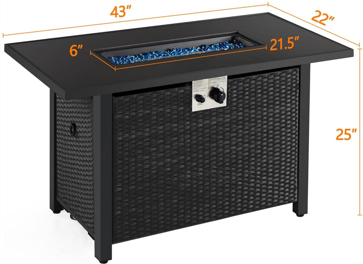
Figure 8.1: Product dimensions and weight capacities.

Max. Weight capacity: tabletop: 110lb Bottom steel ring: 55lb