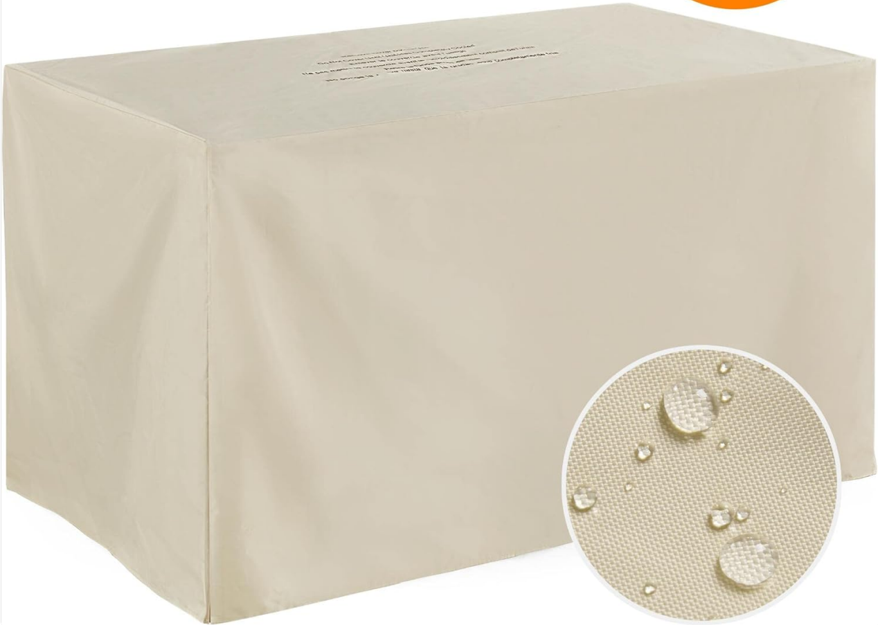
Figure 6.1: Protect your fire pit with the included quality rain cover.