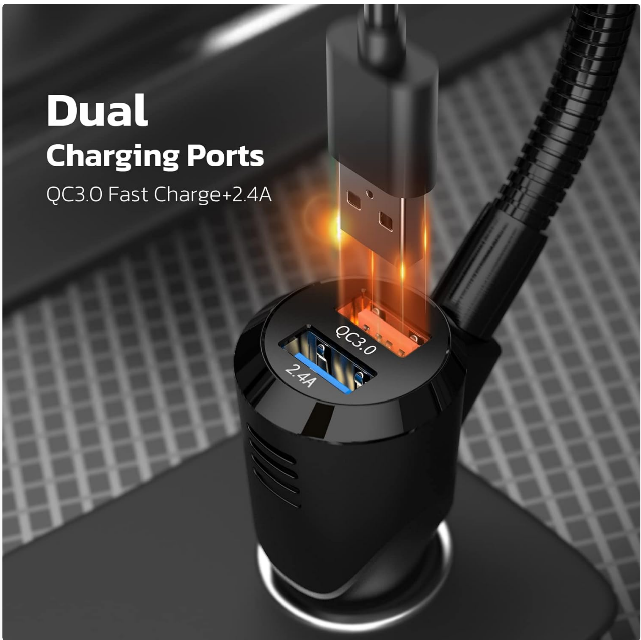
Figure 9: Dual USB Charging Ports