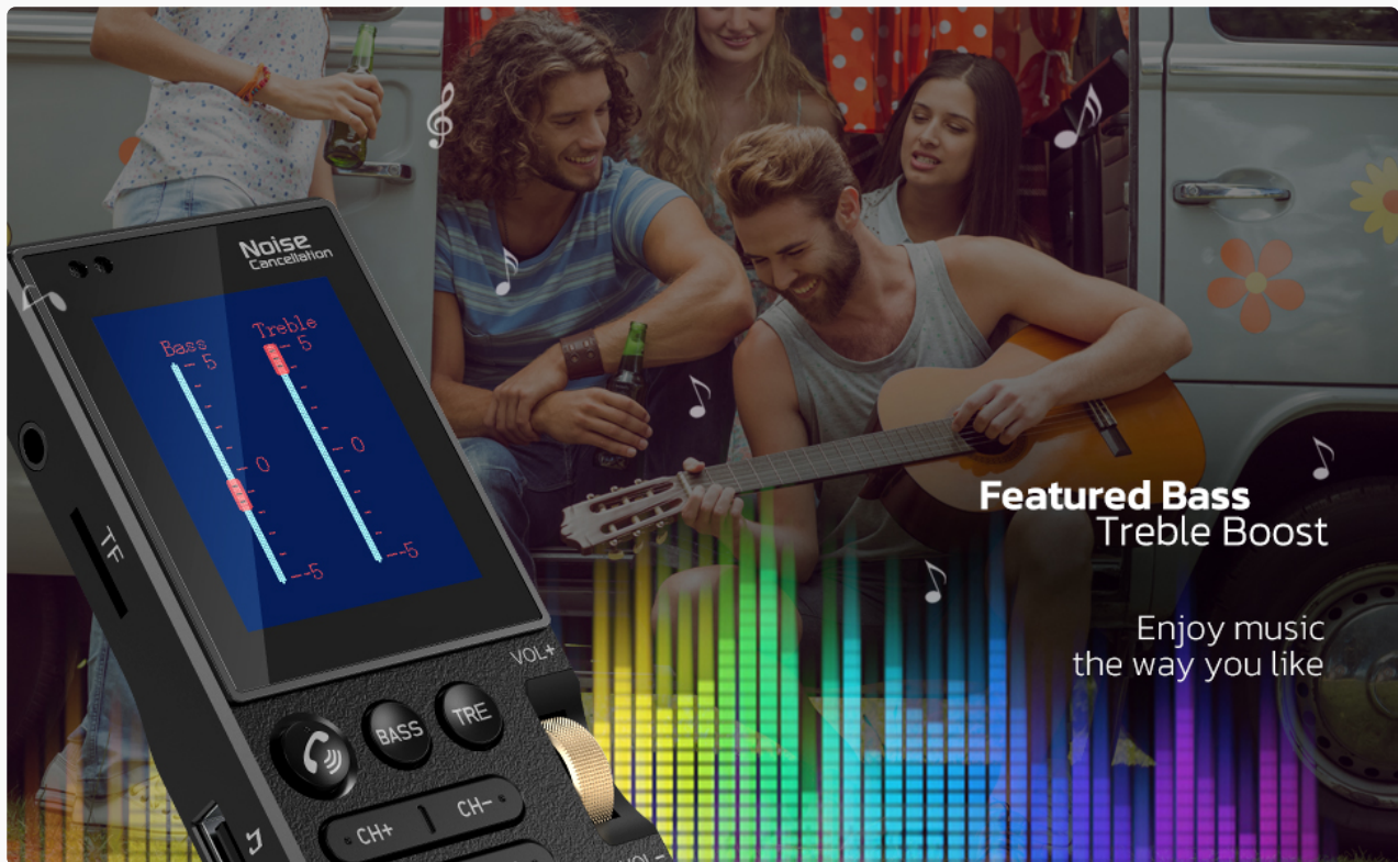
Figure 8: Adjusting Bass and Treble Levels