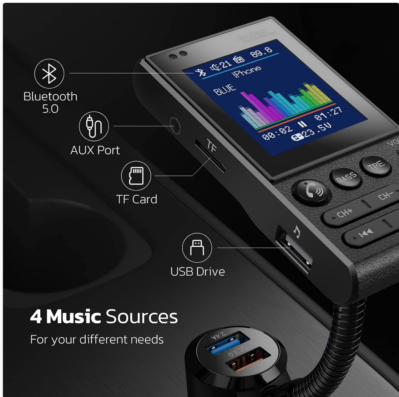
Figure 2: KM20 with labels for its various ports and features.