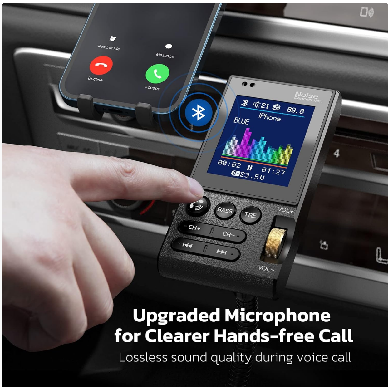
Figure 5: Enhanced Microphone for Clear Calls