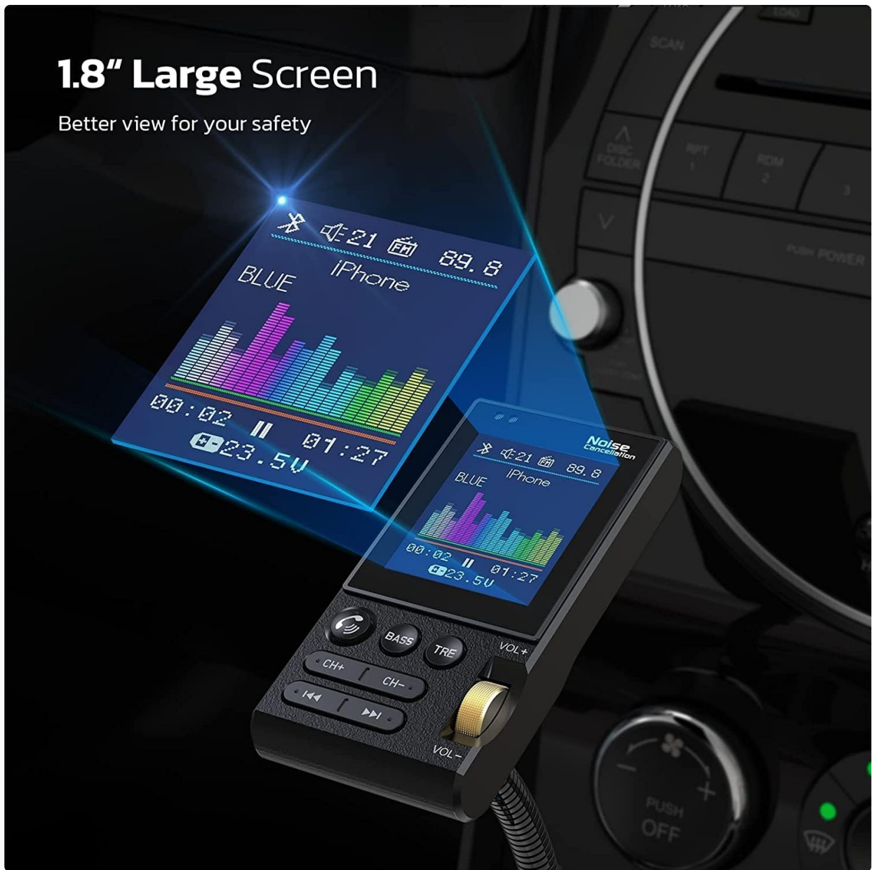
Figure 3: 1.8" Large Color Screen