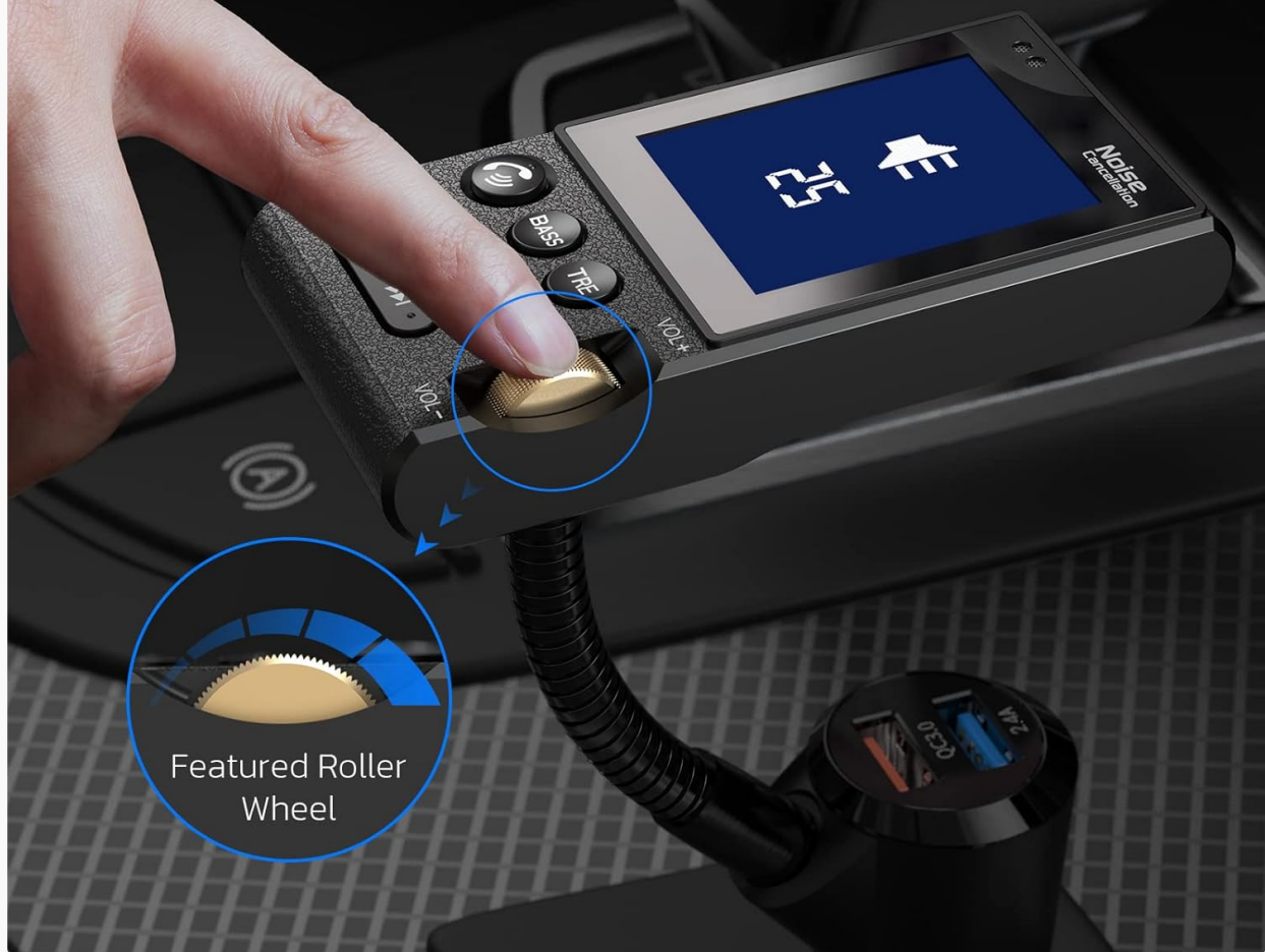
Figure 4: Metal Scroll Wheel for Volume and Tuning

Additional volume adjustable compared with button