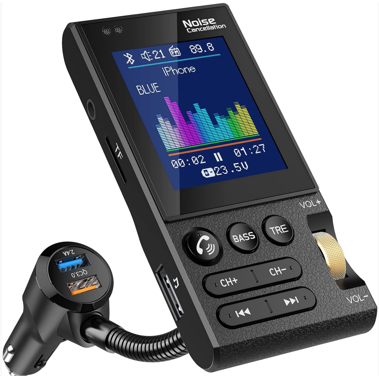
Figure 1: Nulaxy KM20 Bluetooth FM Transmitter