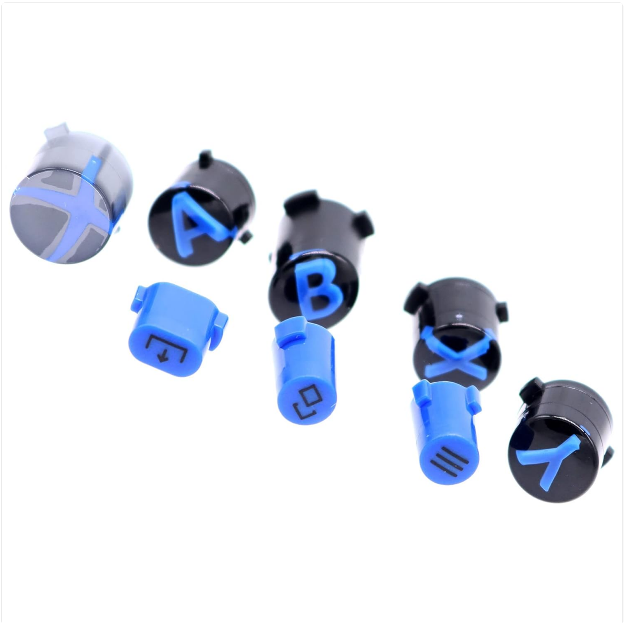
Image: A side view of the replacement button set, highlighting the distinct shapes and sizes of the ABXY buttons alongside the smaller Menu, View, and Share buttons.