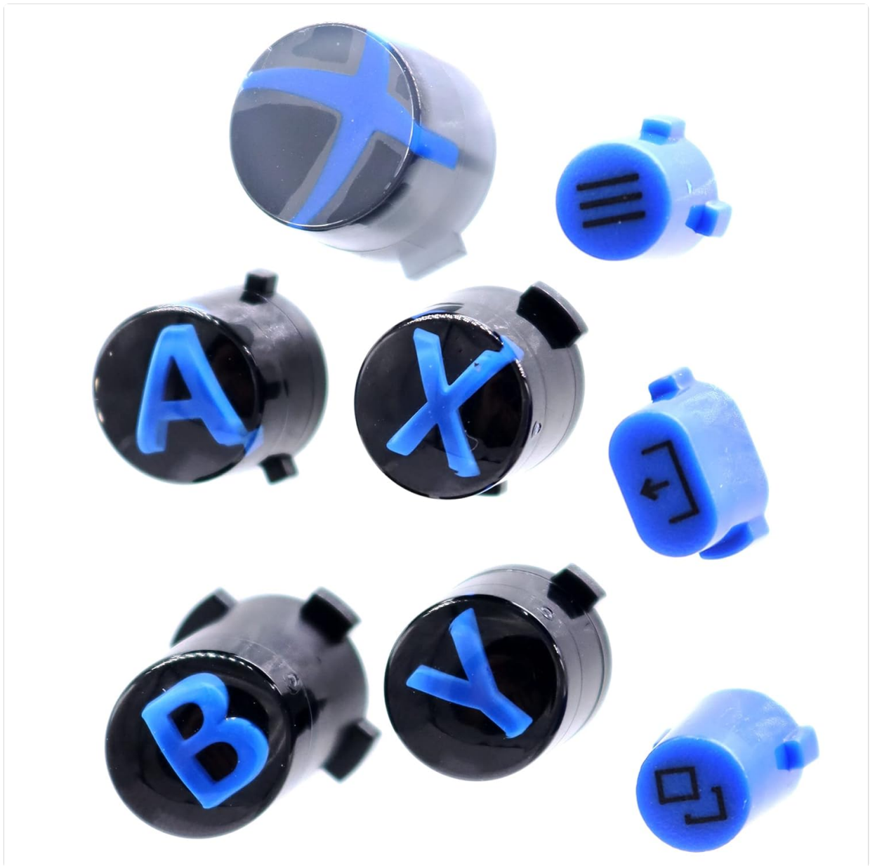
Image: The complete set of blue replacement buttons for Xbox Series S and X controllers. This includes the A, B, X, Y buttons, the Xbox Guide button, and the Menu, View, and Share buttons, all in a vibrant blue color.