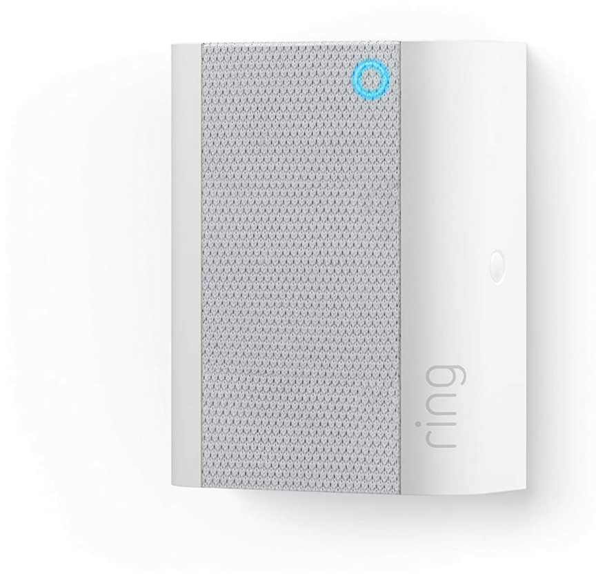
Image: A top-down view of the Ring Chime 1, showcasing its rectangular shape and the textured speaker grille on its front surface. The Ring logo is subtly visible on the side. This perspective highlights the device's compact and minimalist design.