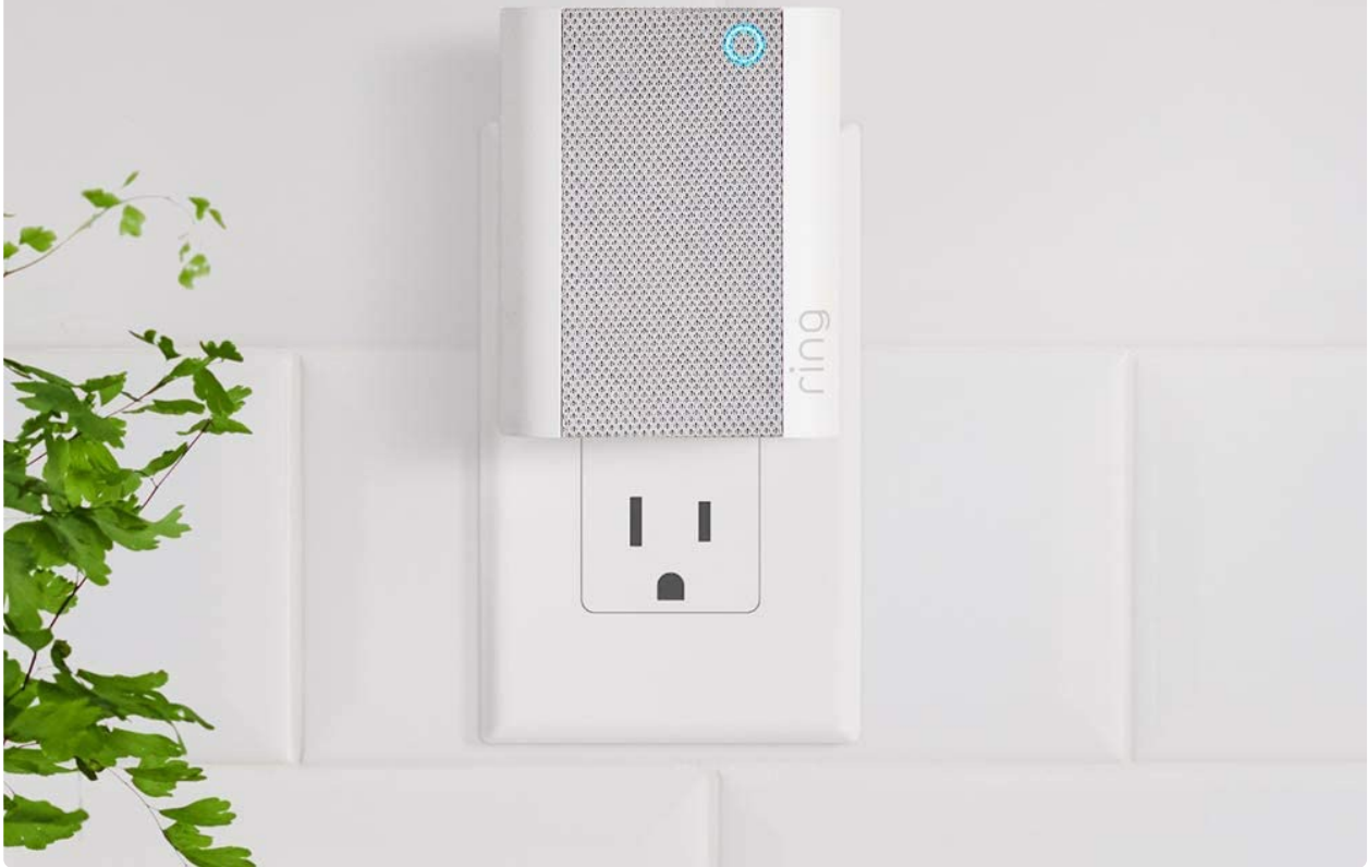
Image: The Ring Chime 1, a compact white device, is shown plugged into a standard electrical wall outlet. The device features a speaker grille on its front with a blue LED indicator light at the top, signifying its operational status. This image illustrates the simple plug-and-play nature of the device for easy installation.