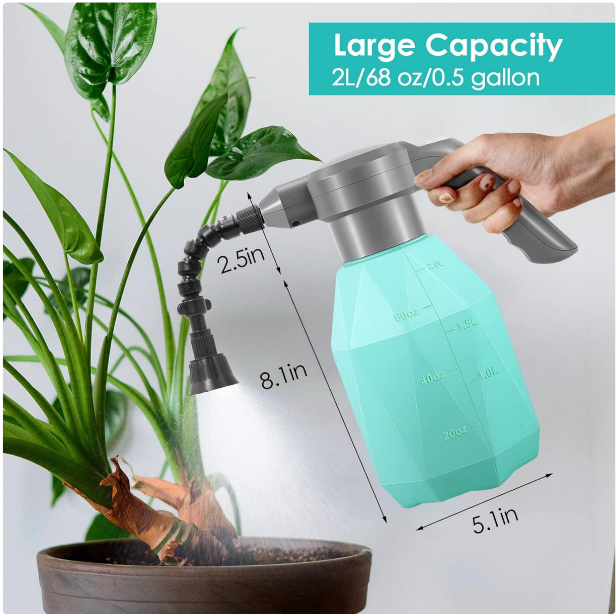
Image: The bottle features clear markings for 2L (0.5 Gallon) capacity and includes an extended nozzle for versatile use.