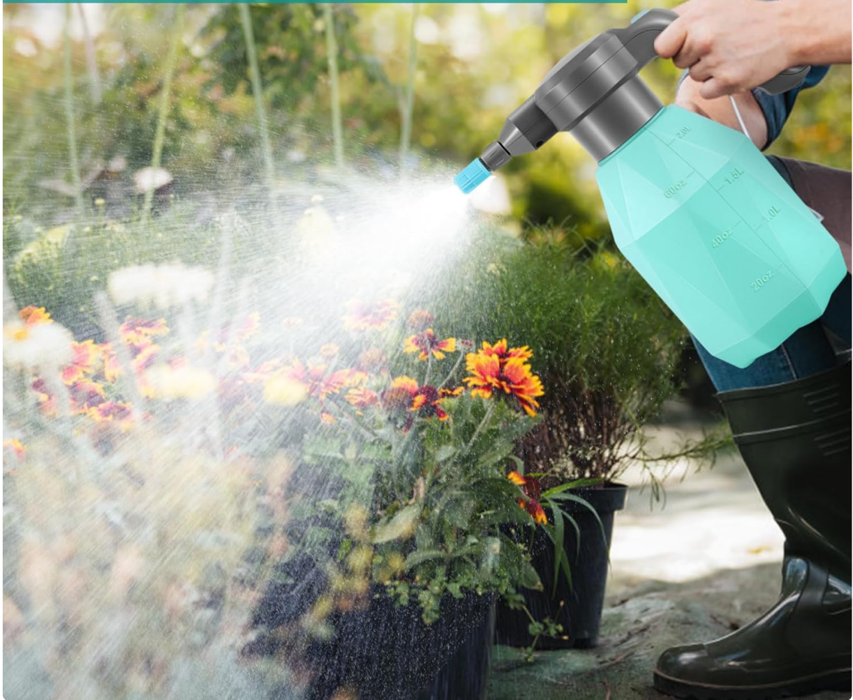
Image: The electric spray bottle in action, providing a continuous spray with a single button press, ideal for plant care.