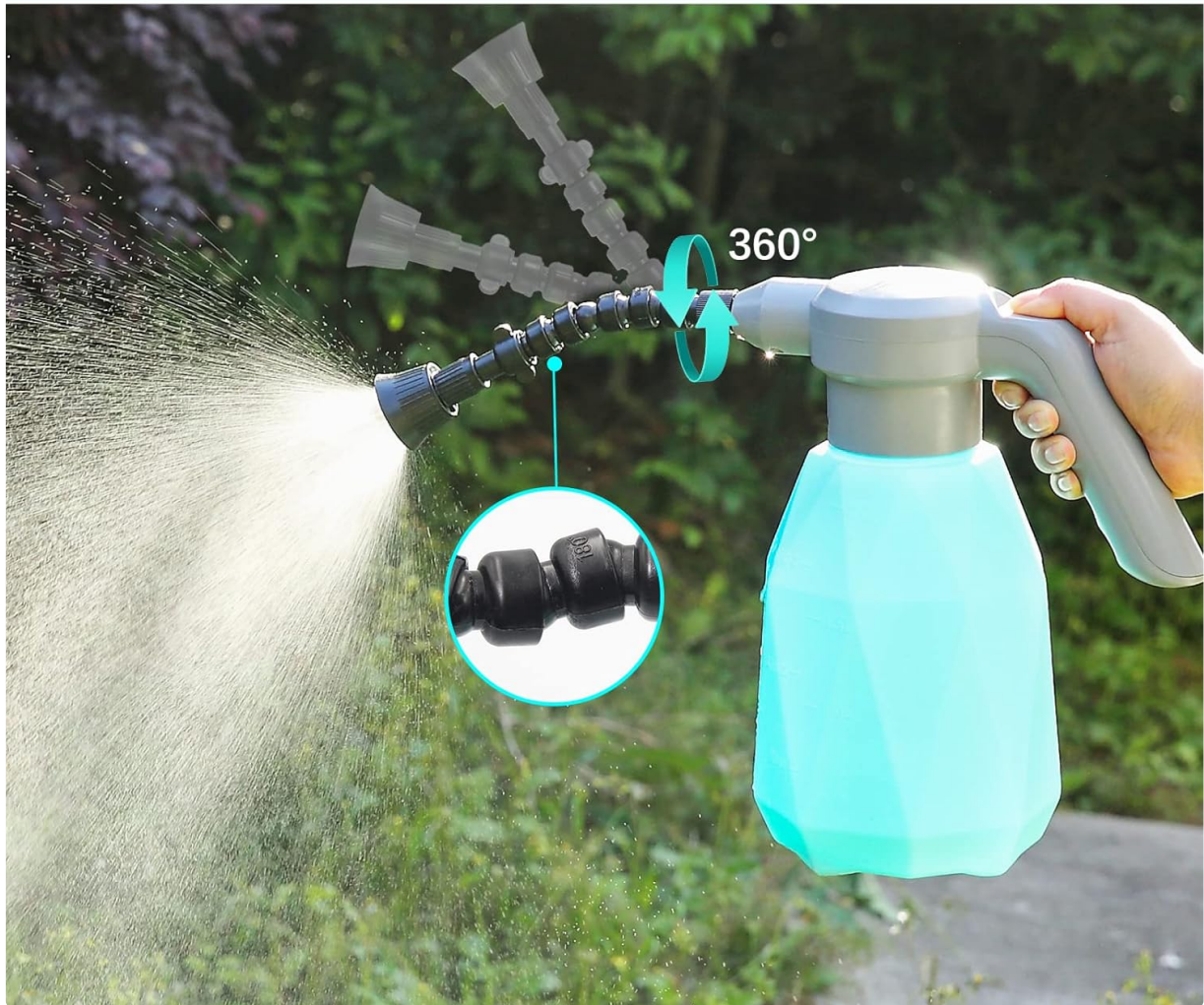
Image: The flexible extended nozzle can be rotated 360 degrees, allowing for precise spraying in various directions.

Your browser does not support the video tag.