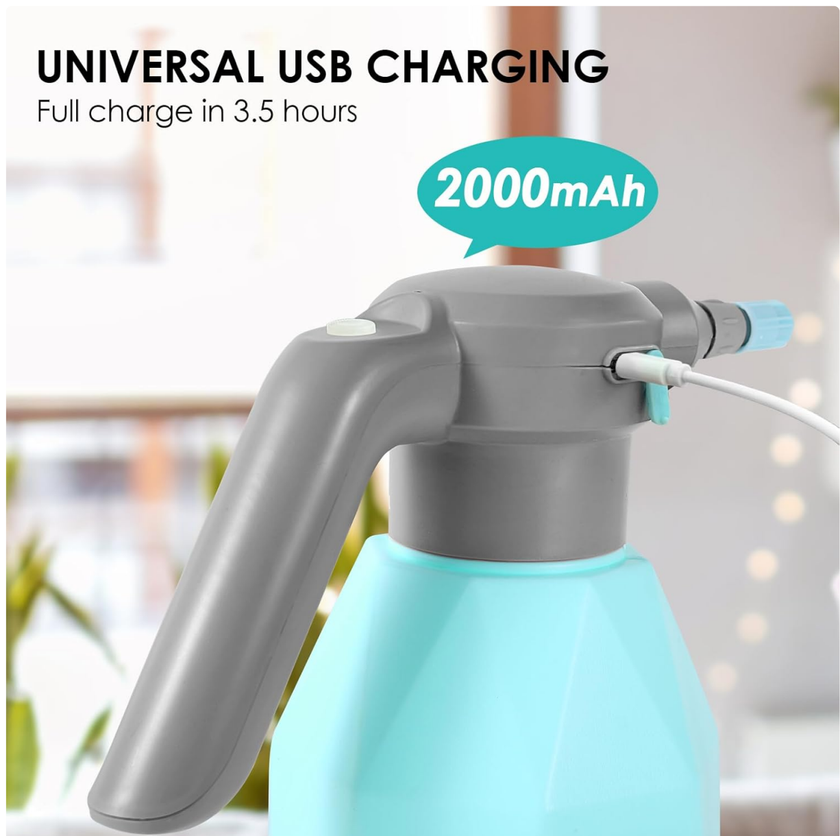
Image: The USB charging port is located on the handle of the sprayer head. Ensure the port cover is securely closed after charging.