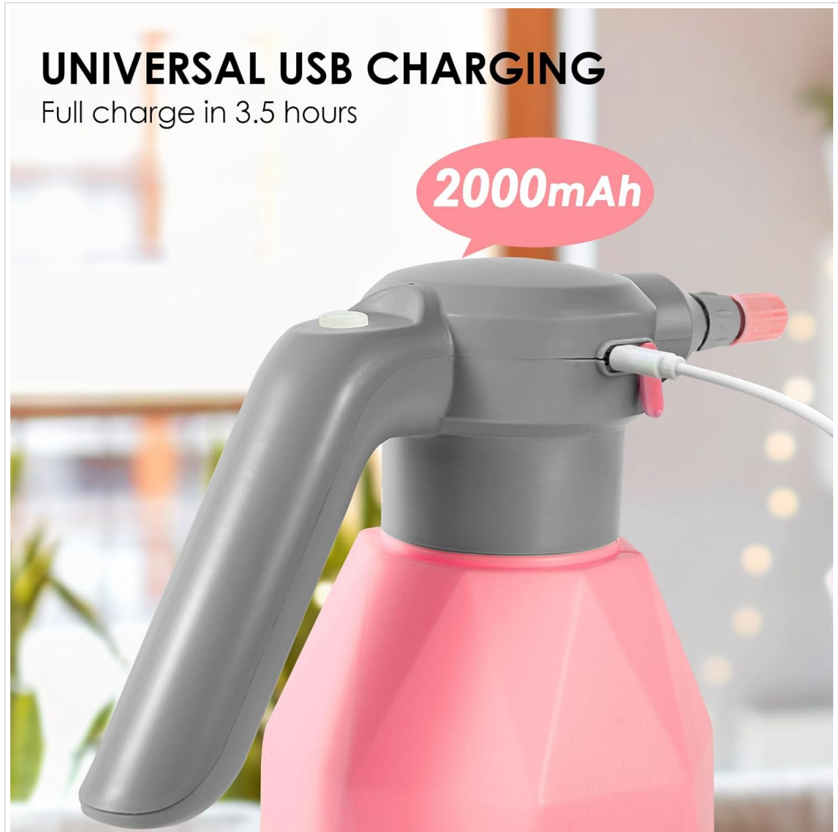
Image: A close-up view of the SideKing Electric Plant Sprayer's handle, highlighting the USB charging port and indicating a 2000mAh battery capacity.

Before first use, ensure the battery is fully charged. Connect the provided USB cable to the charging port on the sprayer's handle and plug the other end into a 5V USB power adapter (not included). The charging indicator light will show the charging status. A full charge takes approximately 3.5 hours.