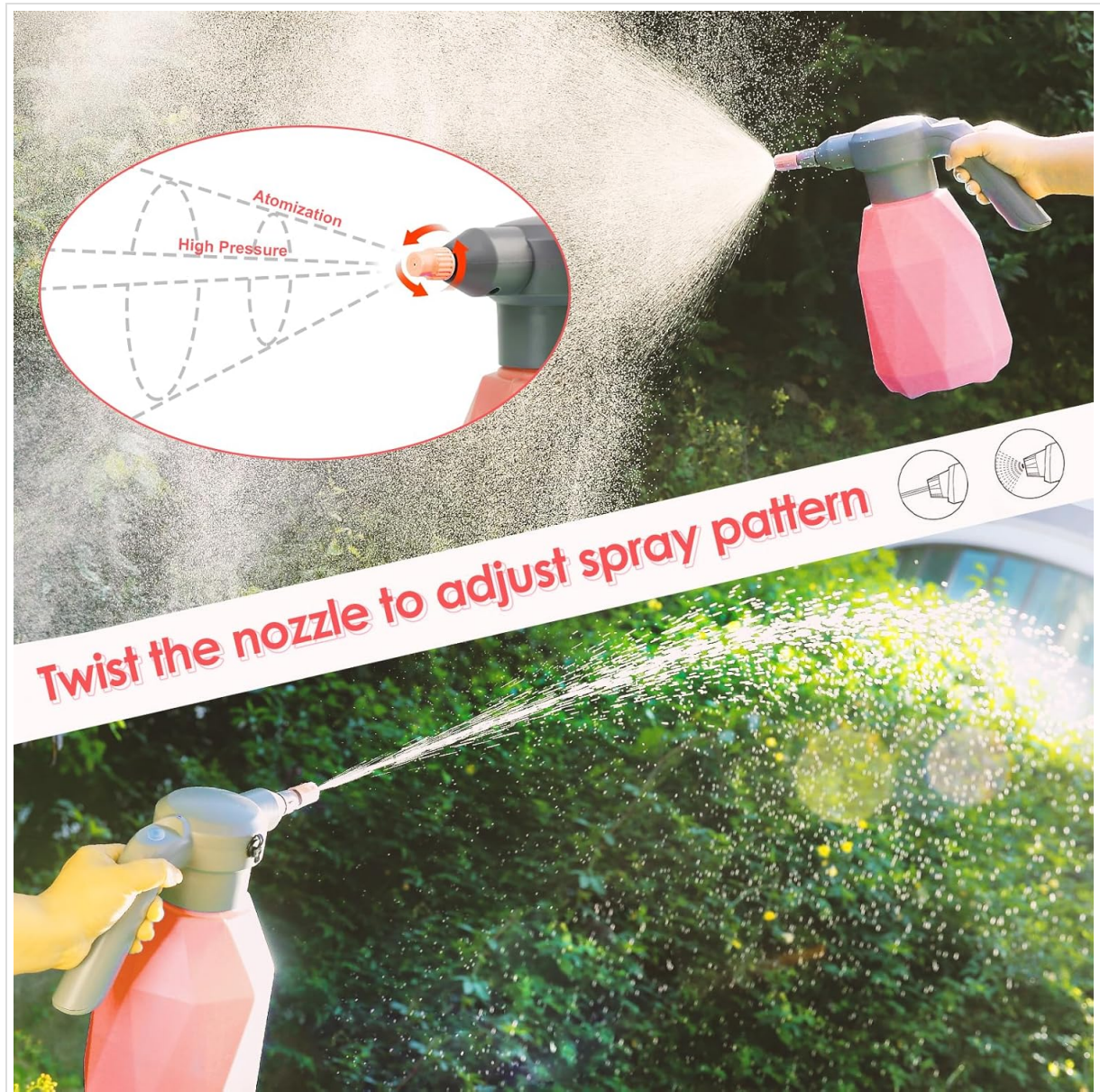
Image: A visual guide demonstrating how to adjust the spray pattern of the SideKing Electric Plant Sprayer by twisting the nozzle, showing both a fine mist and a direct stream.

The sprayer offers two spray modes: uniform mist and water column. To switch between modes, twist the nozzle at the end of the spout. Twist clockwise for a finer mist and counter-clockwise for a more direct water column spray.