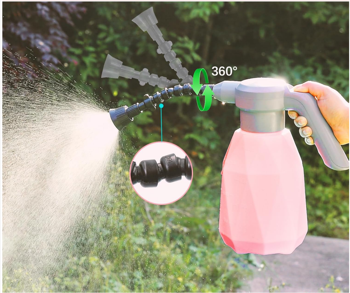
Image: The SideKing Electric Plant Sprayer with its flexible, extended nozzle, illustrating its 360-degree adjustability and various spray angles.