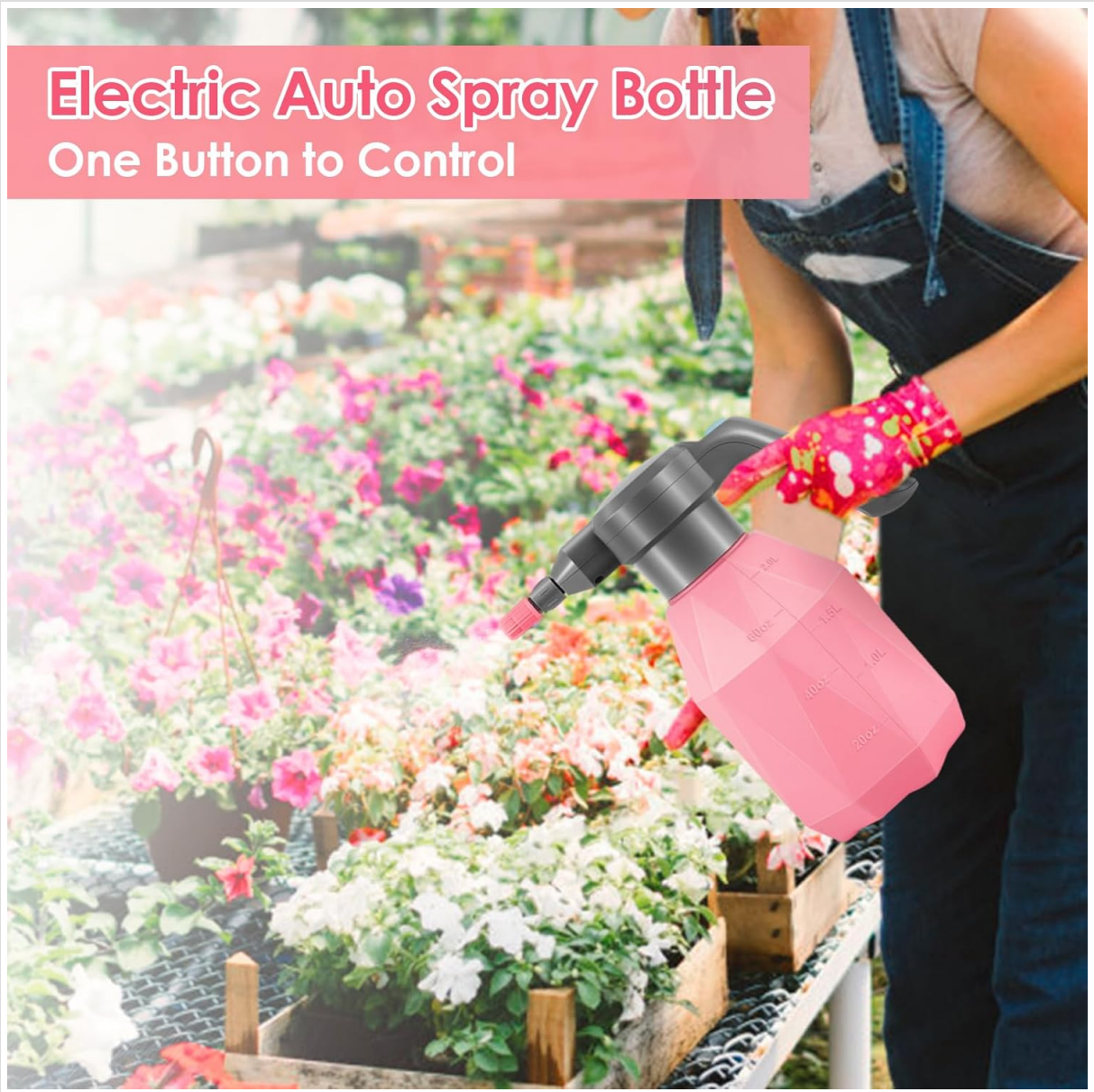
Image: A person in a garden using the SideKing Electric Auto Spray Bottle, demonstrating its one-button control feature.