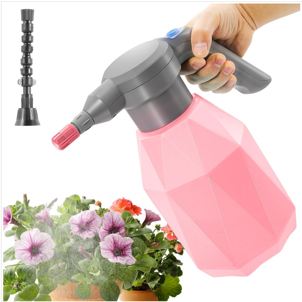
Image: The SideKing 2L Electric Plant Sprayer, pink in color, being held and used to mist a green potted plant. An additional long, flexible nozzle attachment is shown to the left.