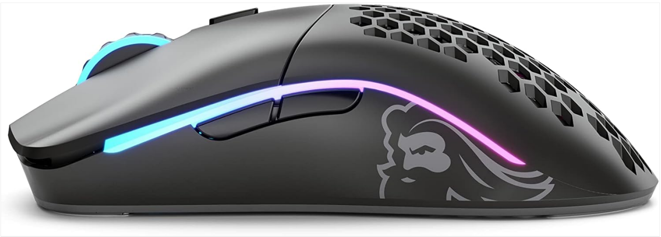
Figure 2: Side view of the mouse, highlighting the USB-C charging port.