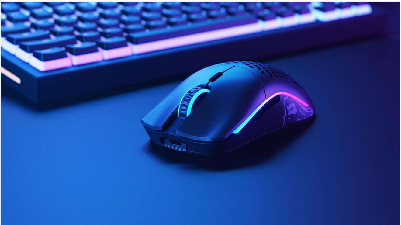
Figure 3: The mouse positioned on a desk, ready for use.