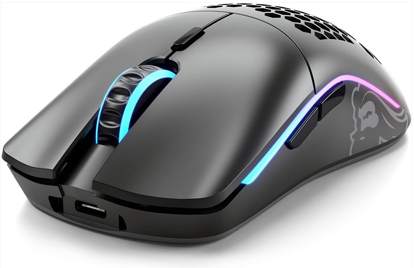
Figure 1: Front view of the GLORIOUS Model O- Wireless Gaming Mouse.

The GLORIOUS Model O- Wireless Gaming Mouse is designed for high-performance gaming and productivity. It features an ultralight design, advanced wireless connectivity, and customizable settings to enhance your computing experience.