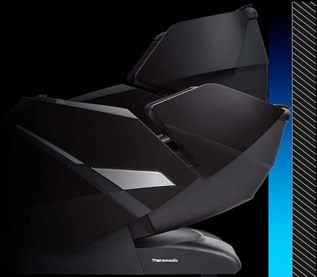
Figure 5.2: Overview of the full body air massage system with 48 air cells and the 12 available auto programs, including stretching, recovery, and customized options.