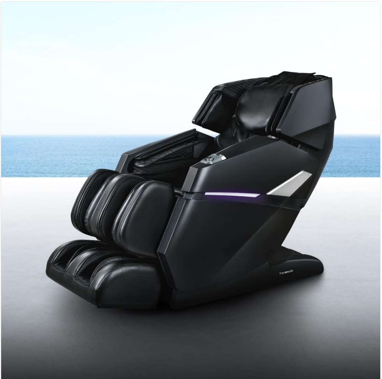
Figure 5.3: Features include infrared heat for the back and calves, a footrest with 7-inch extension for taller individuals, and a quick controller with an integrated USB charger.