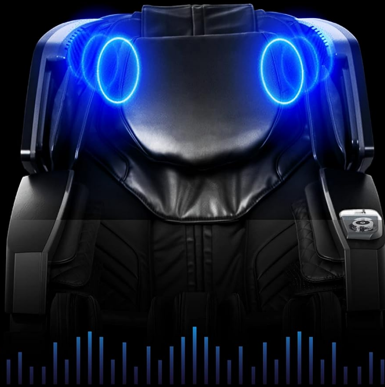
Figure 5.1: The five primary massage techniques offered by the chair's smooth and sensitive massage rollers.