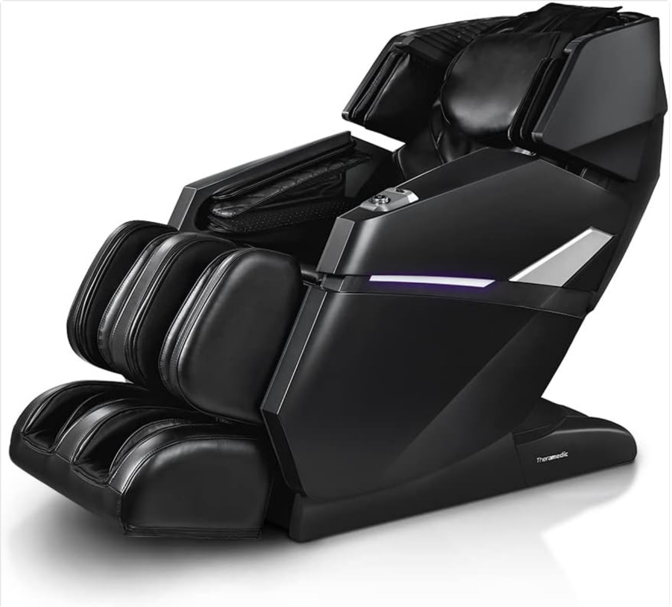
Figure 2.1: The Theramedic Flex Track Massage Chair, showcasing its sleek black design.