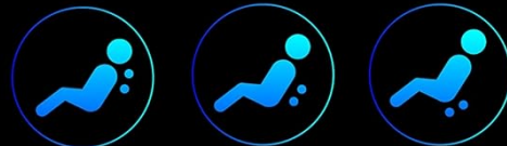
Figure 6.1: The chair operates at an ultra-quiet 50 dB and features integrated Bluetooth audio for an enhanced relaxation experience.