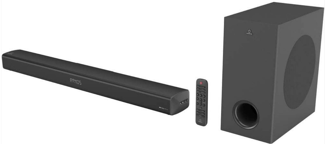
Image 1.1: Renkforce RF-SB-301 Soundbar and Wireless Subwoofer. This image displays the main soundbar unit positioned horizontally in the foreground, with the compact, rectangular wireless subwoofer standing vertically in the background to the right. Both components are black.