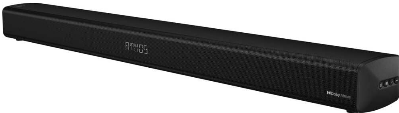
Image 4.1: Front view of Renkforce RF-SB-301 Soundbar. This image shows the soundbar from a direct front perspective, highlighting its sleek, black grille and the central 'Atmos' display.

The Renkforce RF-SB-301 system consists of a main soundbar unit and a separate wireless subwoofer. The soundbar features an LED display with adjustable brightness and side control elements for easy operation.