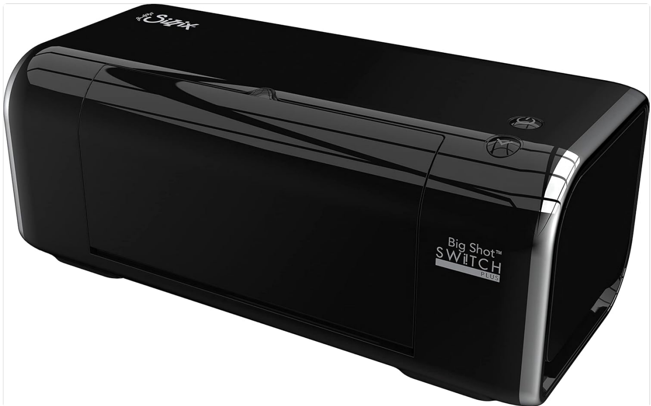
Figure 1: The Sizzix Big Shot Switch Plus Electric Die-Cutting Machine.