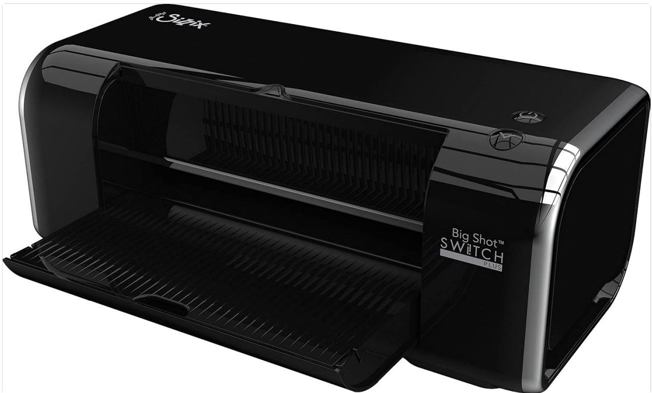
Figure 2: Preparing a die-cutting sandwich with the Sizzix Big Shot Switch Plus.

5. One-Touch Reverse: If a jam occurs or you need to reverse the material, press the reverse button.