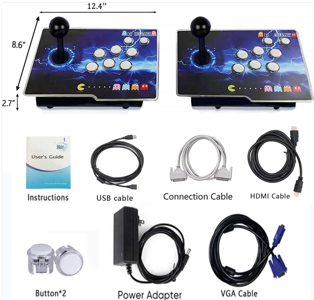
Image 2.1: The package includes the main console, a secondary controller, various connection cables (HDMI, VGA, USB, inter-controller), a power adapter, and spare parts.