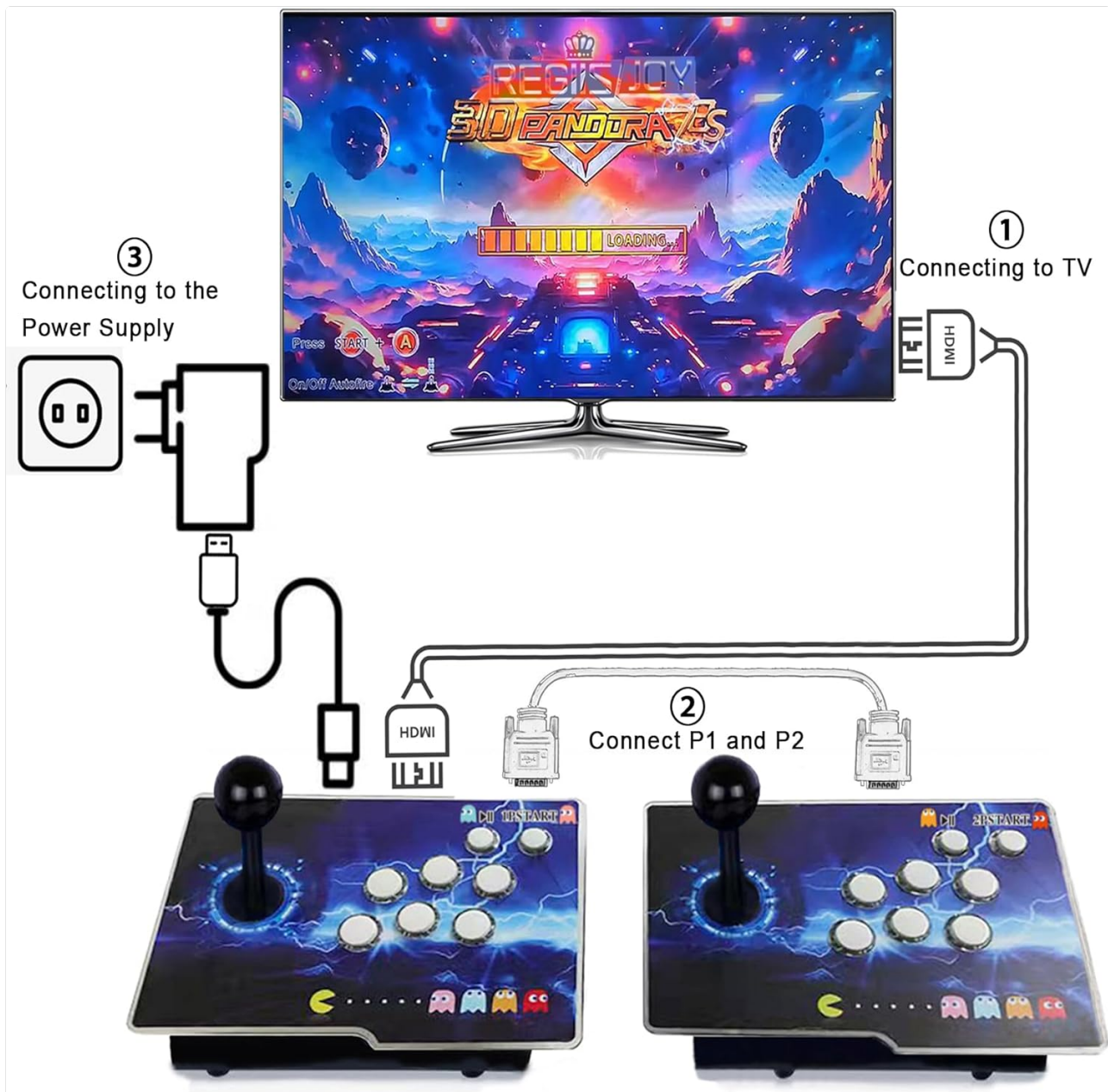
Image 3.2: A visual guide demonstrating the physical connections for power, HDMI, and the inter-controller cable.

Video 3.1: This video provides a visual demonstration of connecting the joysticks, power, and HDMI cable to the console, and linking the two player units.