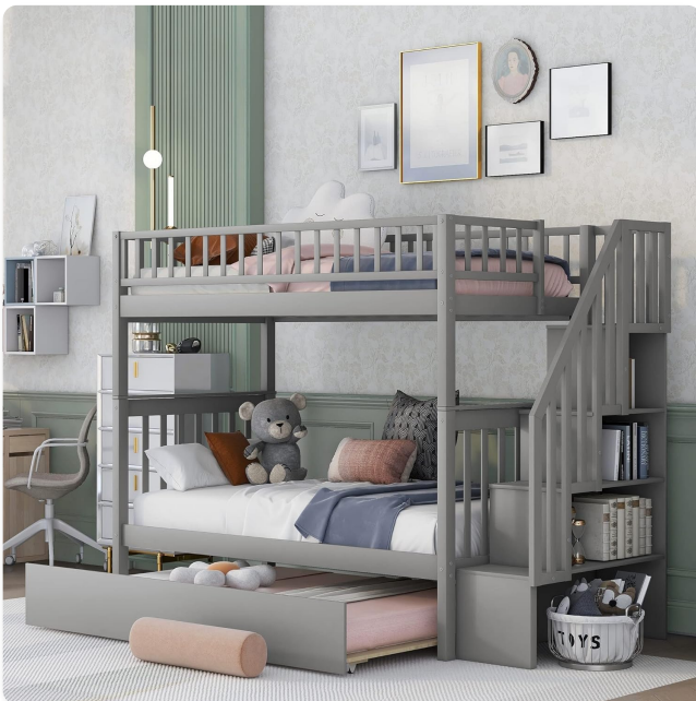
Figure 4.1: Fully assembled bunk bed with trundle and stairs.

Assembly typically requires two adults and can take approximately 3-4 hours. Follow the step-by-step diagrams provided in your physical manual. Below are general guidelines and visual aids.