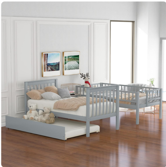
Figure 5.2: The bunk bed can be converted into two individual twin beds and a trundle.