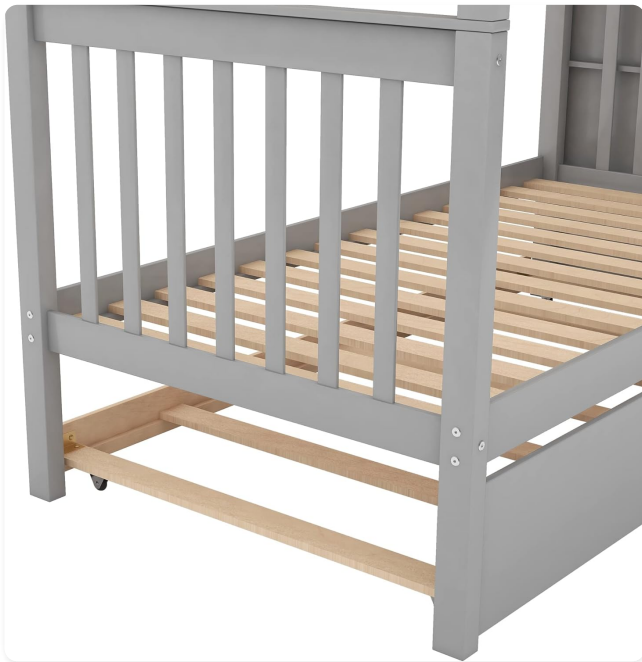
Figure 5.1: Trundle bed wheels for easy pull-out.