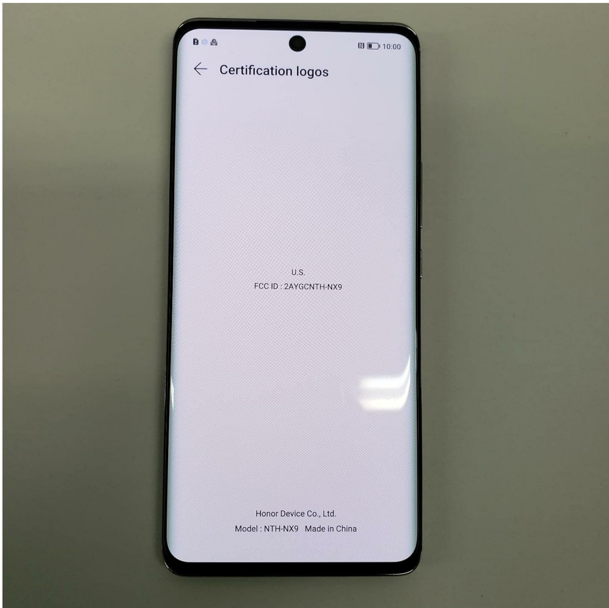
Image: The Honor 50 5G display showing certification logos and FCC ID: 2AYGCNTH-NX9.