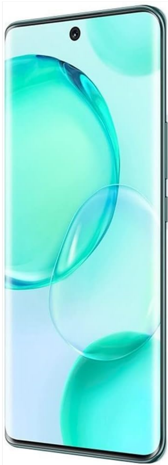
Image: Front view of the Honor 50 5G smartphone, showing the curved display and front camera cutout.