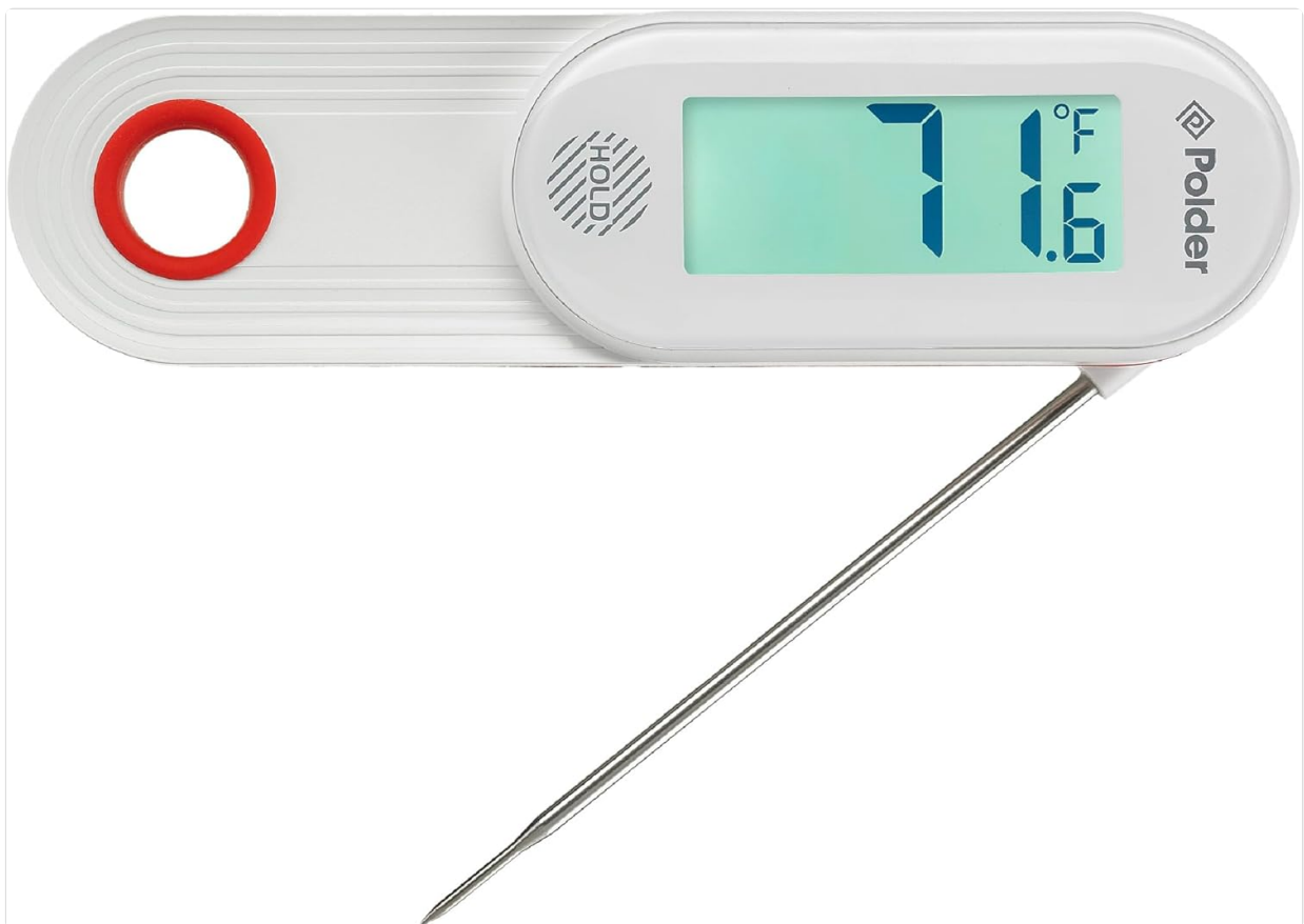
Image: The Polder Waterproof Instant Read Thermometer, highlighting its digital display and probe, with water splashes demonstrating its waterproof IP65 rating.

The Polder Waterproof Instant Read Thermometer is designed for precise temperature measurement of various foods. Its intuitive design and durable construction make it suitable for both home cooks and professional chefs. This thermometer provides quick and accurate readings, ensuring food is cooked to the desired internal temperature.