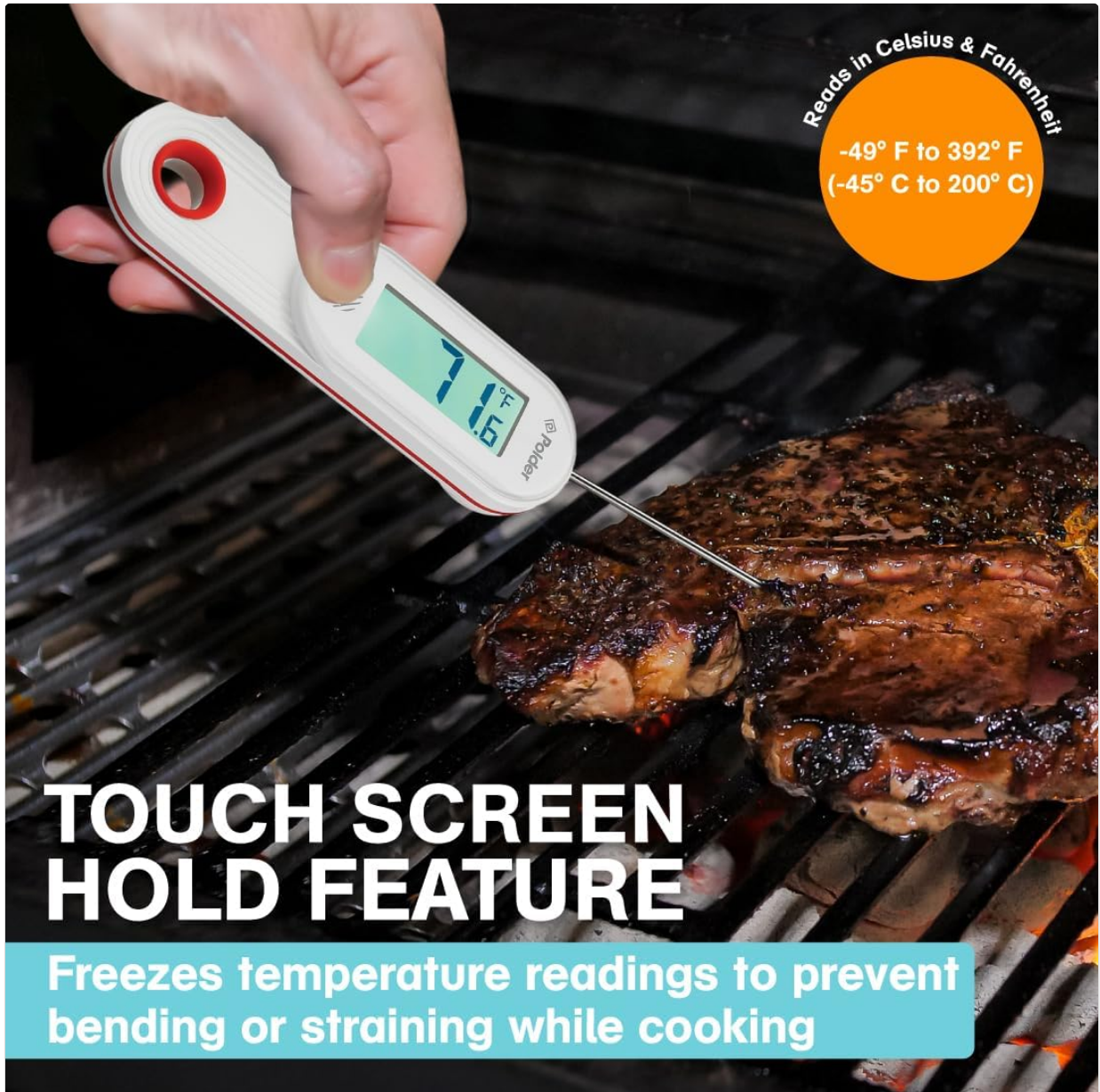
Image: The thermometer's display showing both Celsius and Fahrenheit readings, highlighting the touch-screen hold feature.