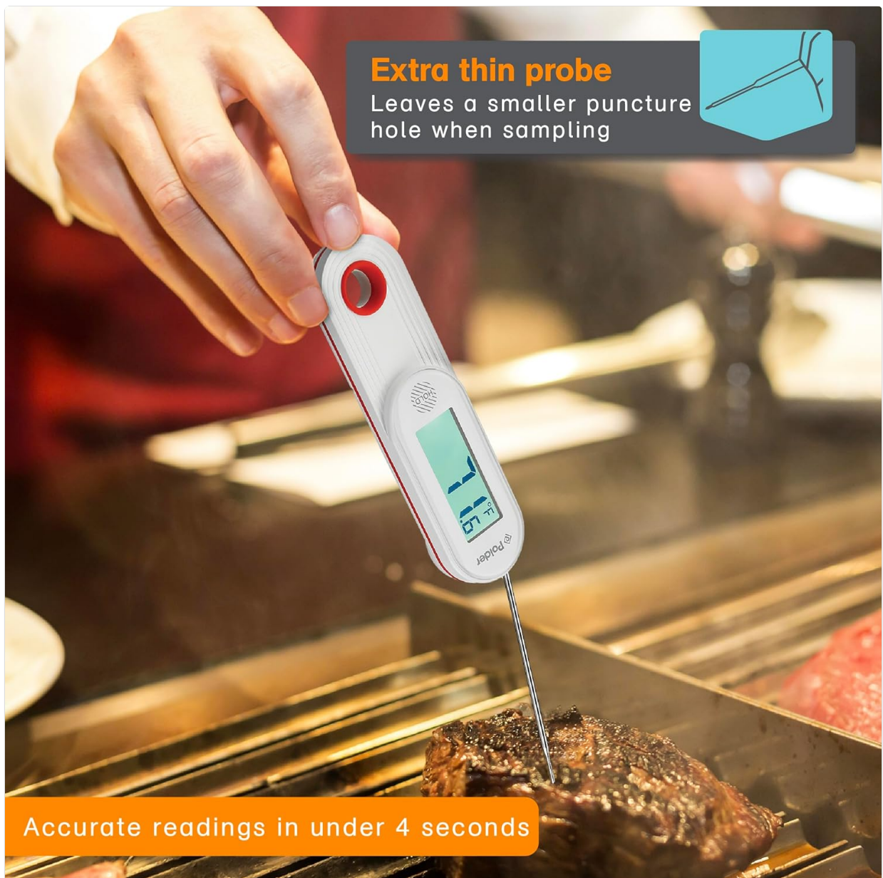
Image: A hand using the Polder thermometer to measure the temperature of meat on a grill, demonstrating the extra-thin probe and