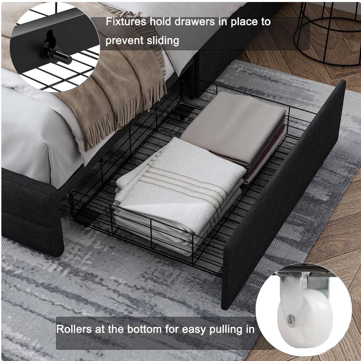
Image: Detail of drawer rollers and anti-slide fixtures.