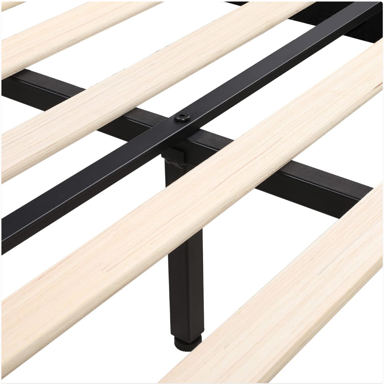
Image: Detail of wooden slat support.