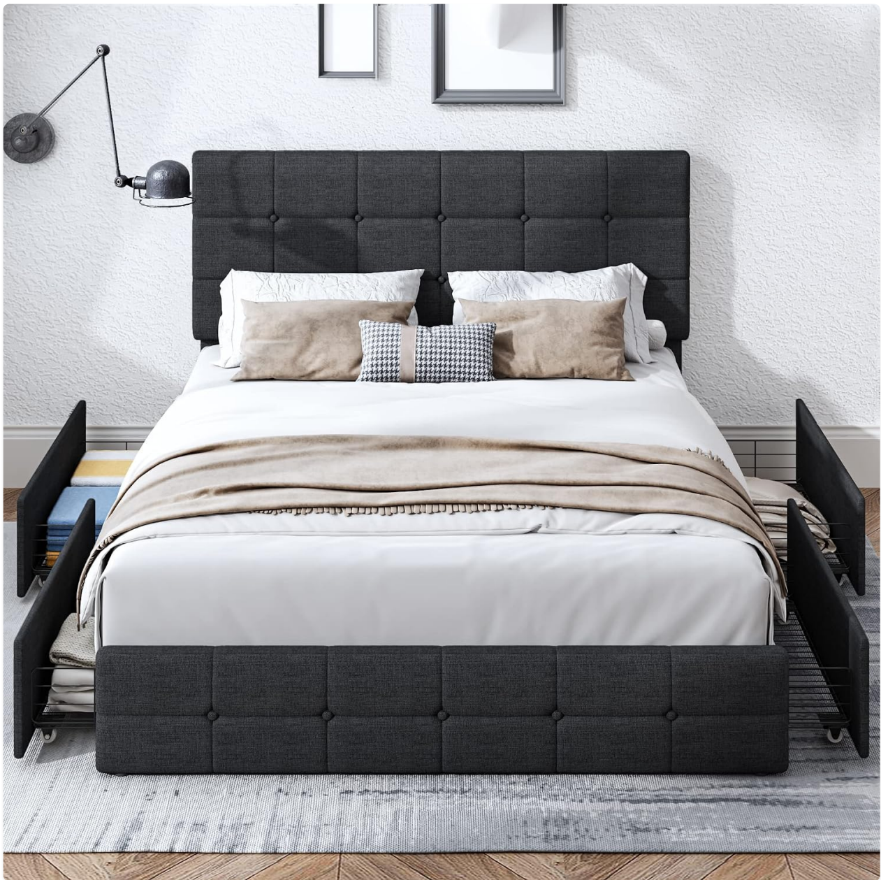
Image: Bed frame with storage drawers open.