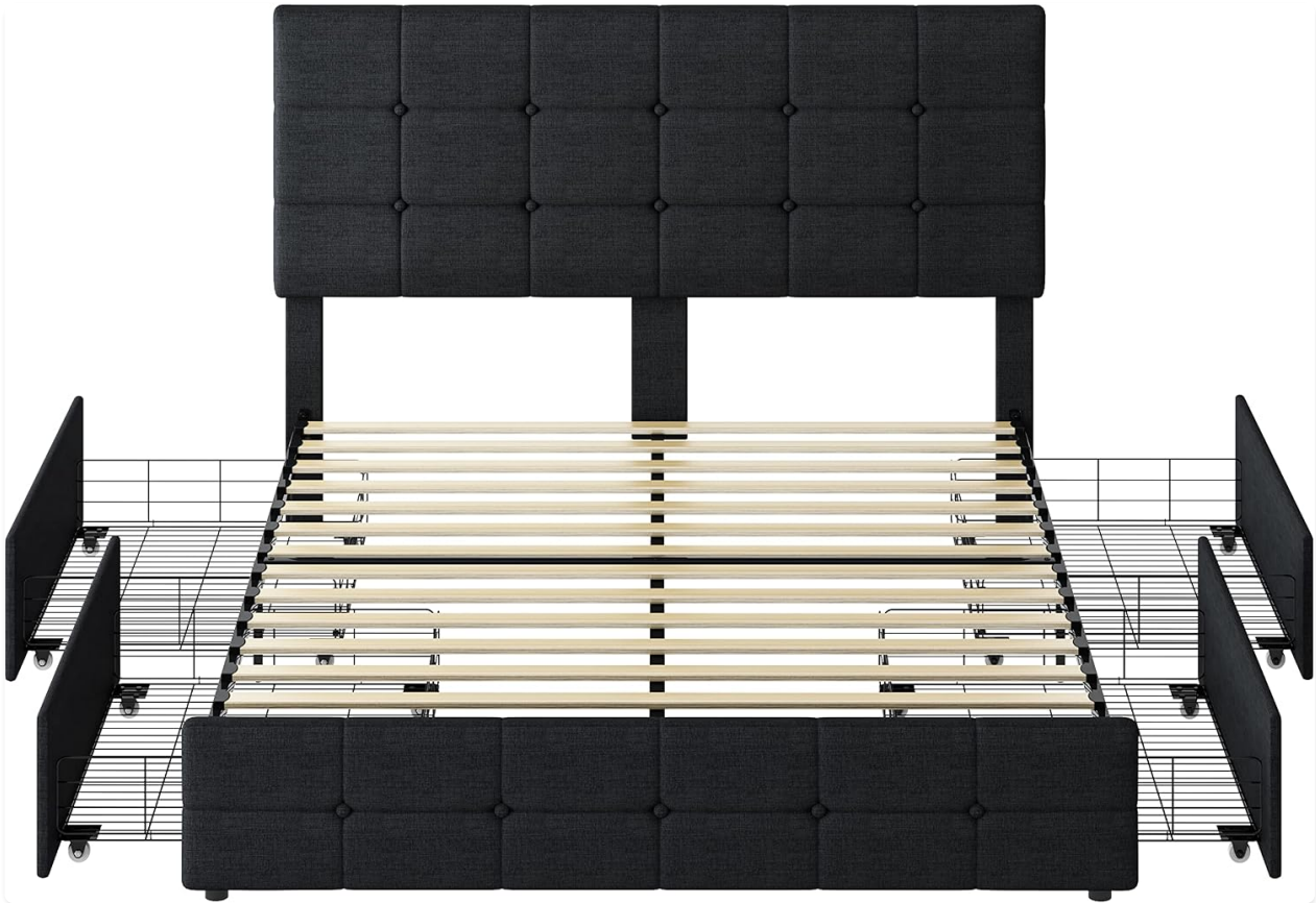
Image: Exploded view of bed frame components for assembly.

Before starting, unpack all components and verify against the parts list provided in your package. Ensure all parts are present and undamaged.