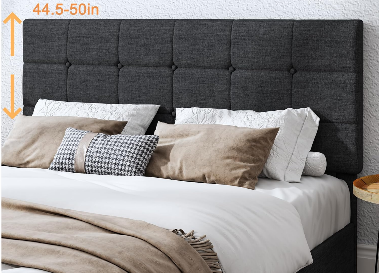
Image: Adjustable headboard with height range indicated.