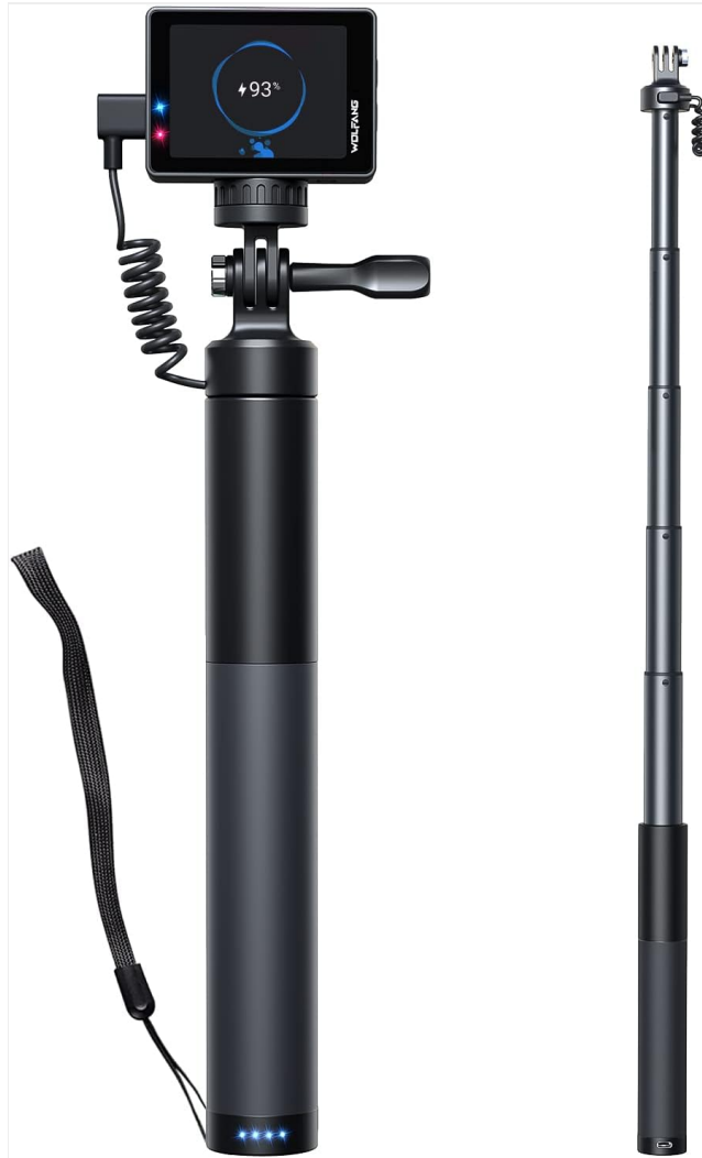
Image: The WOLFANG GB2200 selfie stick with an action camera attached to its top mount, ready for use.