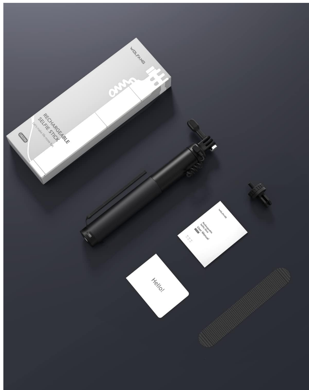
Image: Contents of the WOLFANG GB2200 package, including the selfie stick, user manual, and mounting screw.