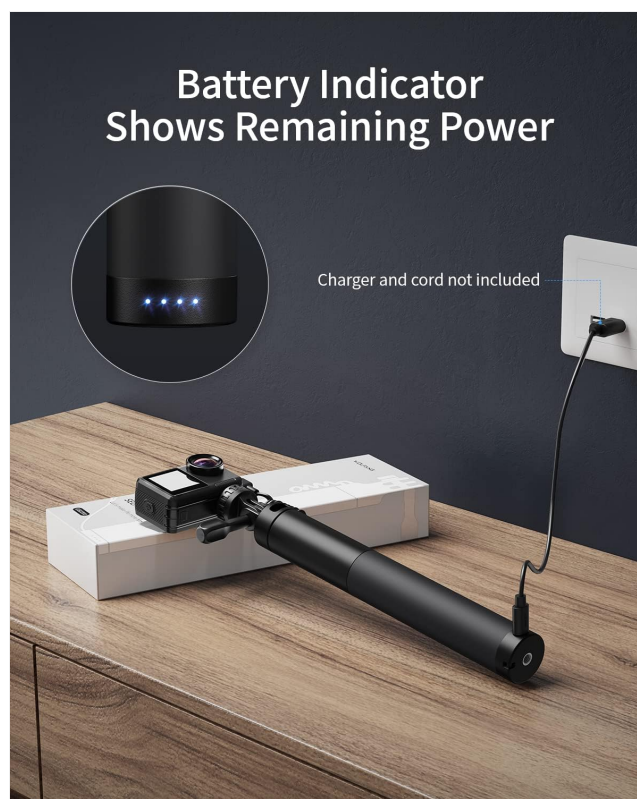
Image: The WOLFANG GB2200 selfie stick connected to a wall charger via its Type-C port, with blue indicator lights showing charging status.