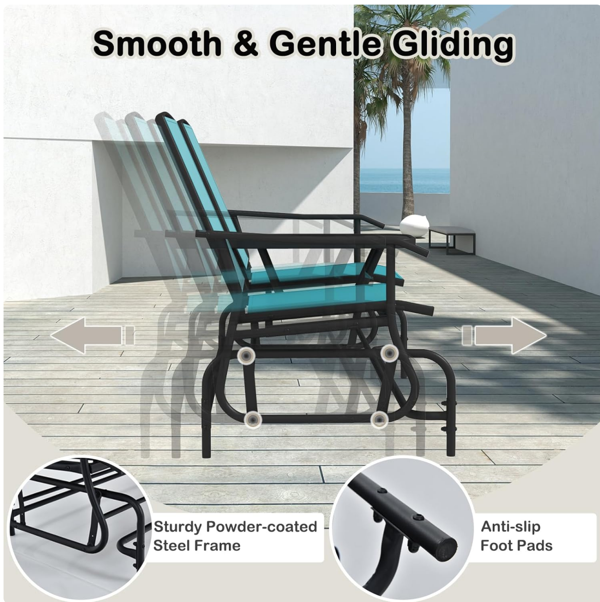
Image 5.1: Illustration of the smooth and gentle gliding mechanism, highlighting the sturdy powder-coated steel frame and anti-slip foot pads.