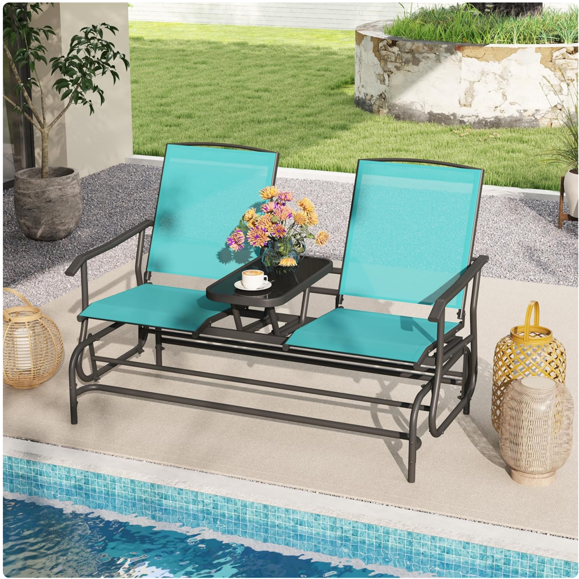
Image 2.1: The Tangkula 2 Person Swing Glider Chair in a patio setting, showcasing its design and functionality.