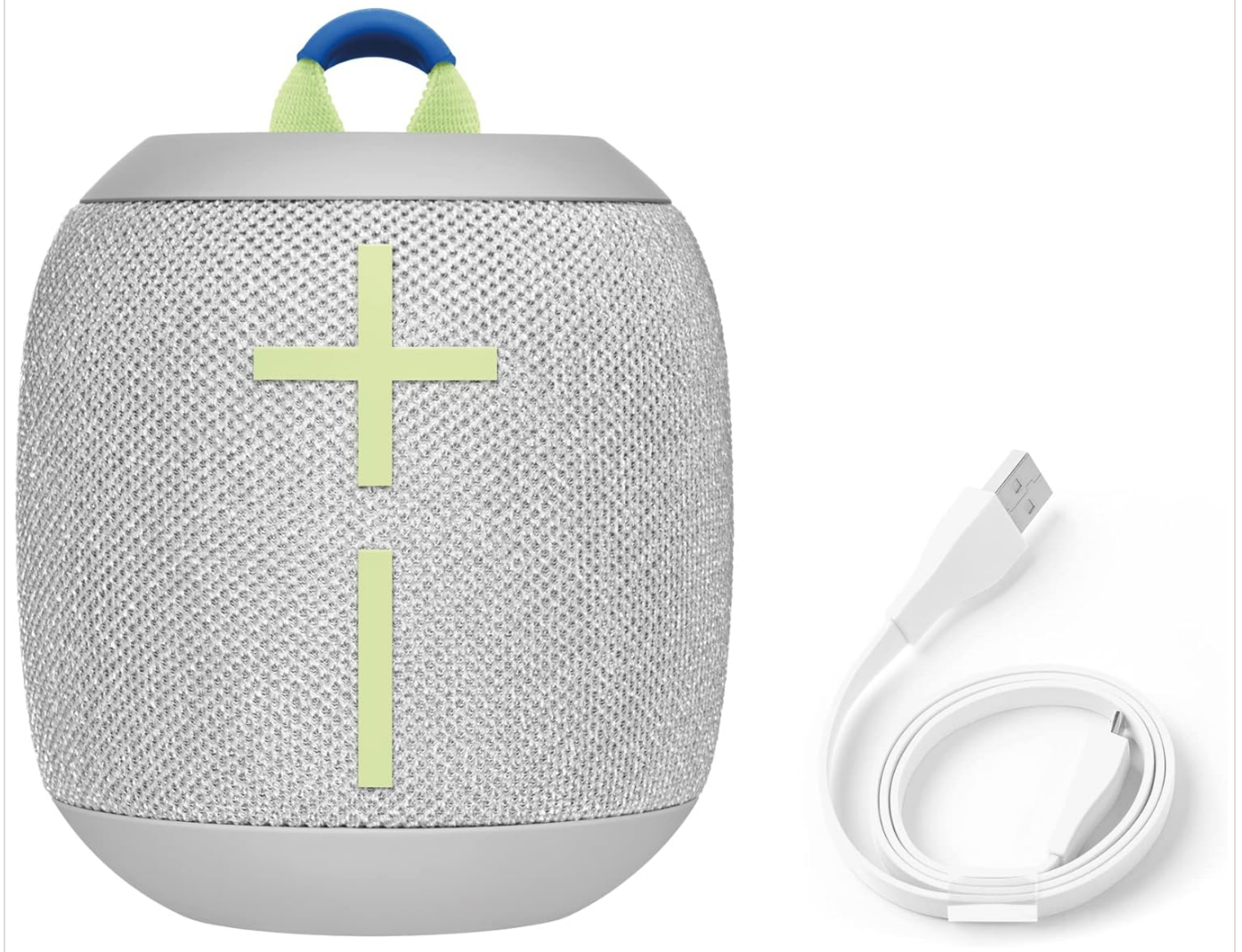
Image: The WONDERBOOM 3 speaker and its accompanying USB charging cable, as found in the product packaging.