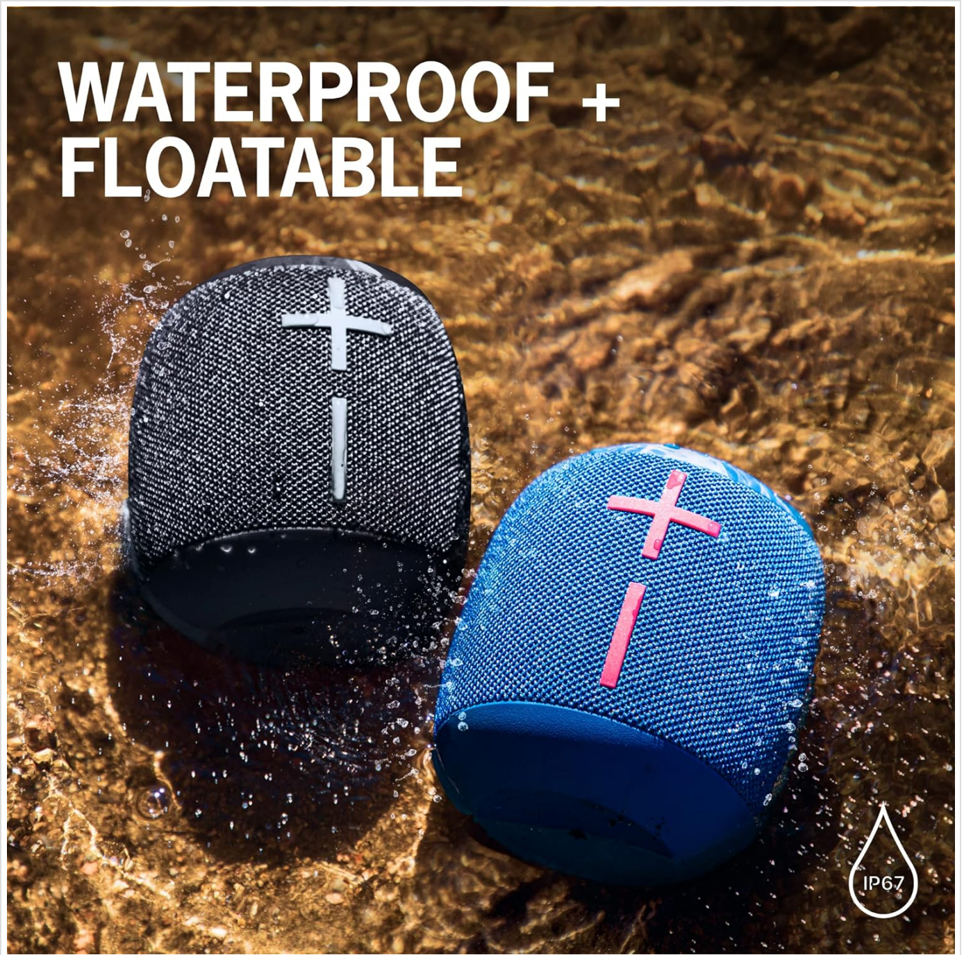
Image: Two WONDERBOOM 3 speakers floating on the surface of water, highlighting their waterproof and floatable capabilities.