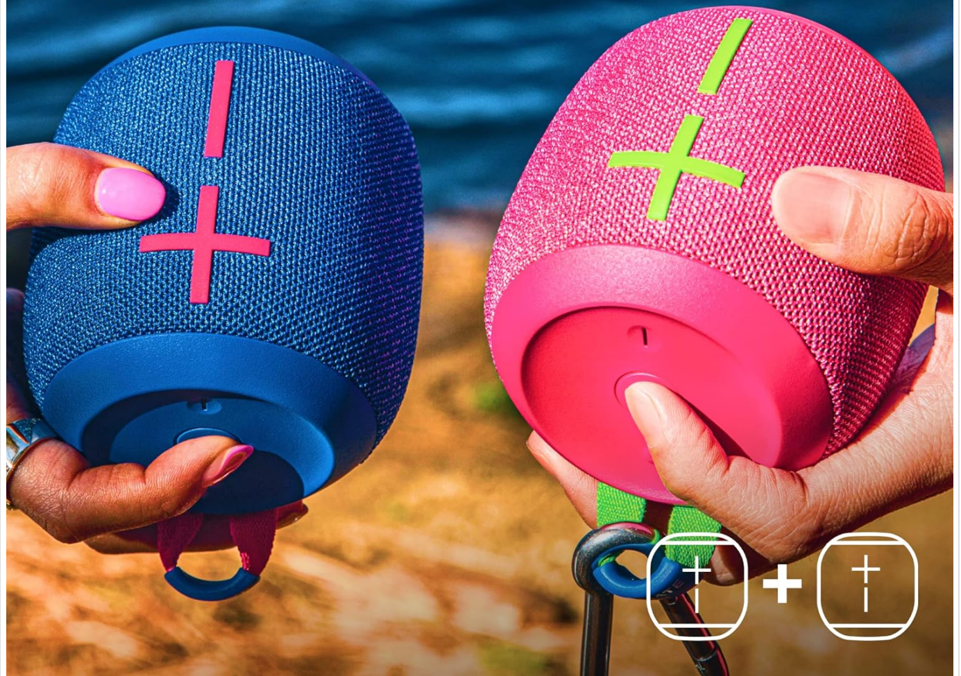
Image: Two hands holding two WONDERBOOM 3 speakers, demonstrating the ability to pair them for enhanced stereo sound.