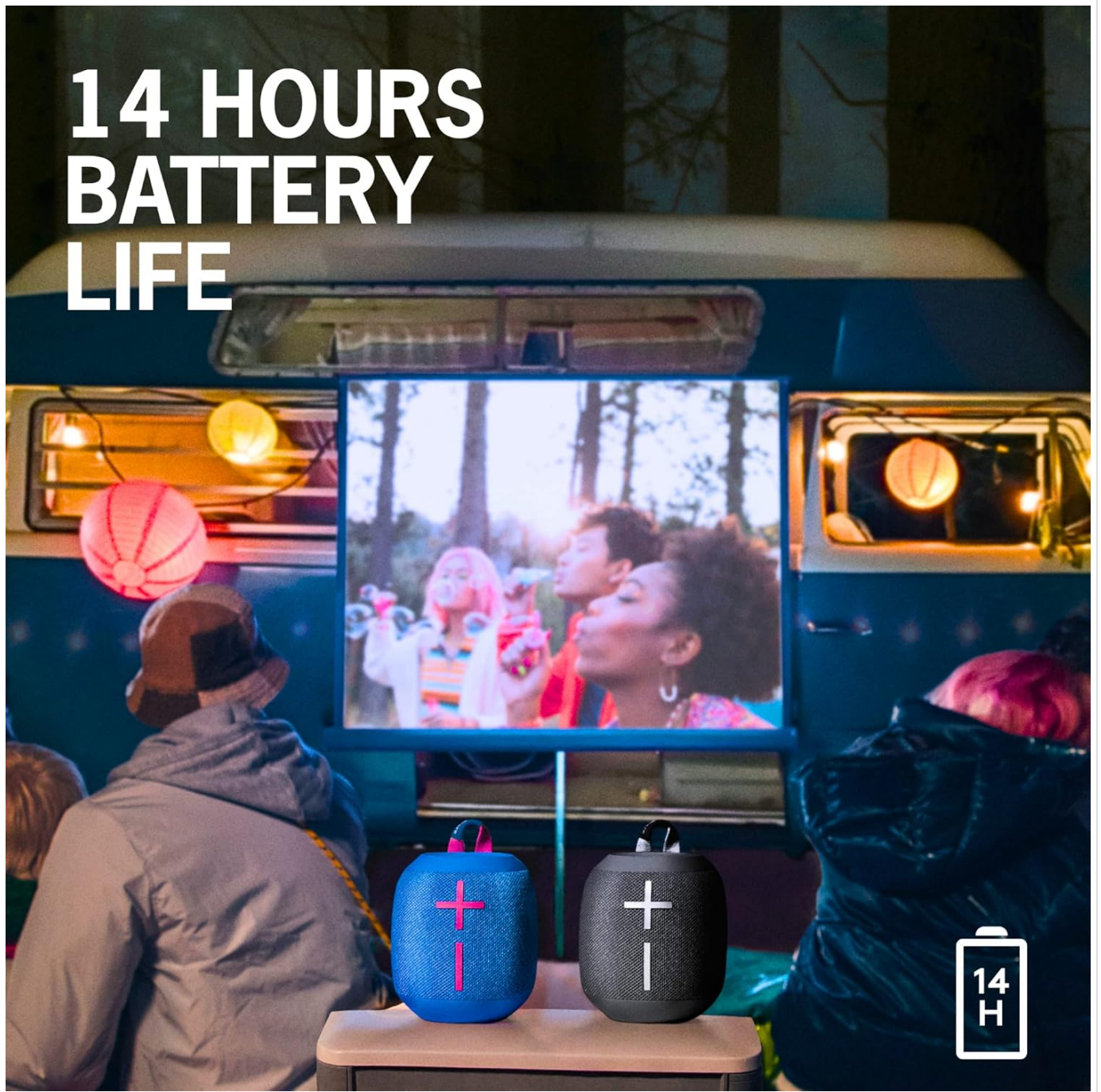
Image: Two WONDERBOOM 3 speakers positioned in front of a group of people enjoying an outdoor movie, emphasizing the 14-hour battery life.