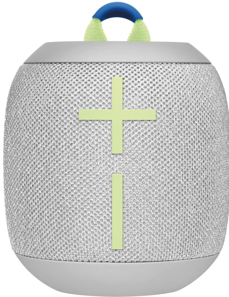
Image: Ultimate Ears WONDERBOOM 3 speaker in Joyous Brights Grey, showcasing its compact and robust design.