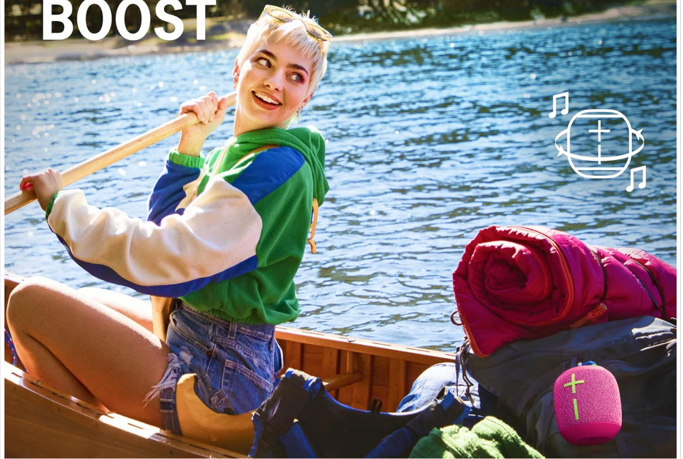
Image: A woman paddling in a kayak with a WONDERBOOM 3 speaker attached to her backpack, highlighting the speaker's 360-degree sound and outdoor boost feature.